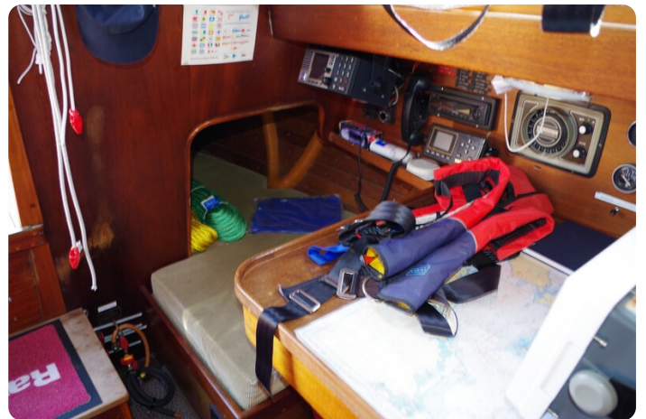
Vindö 50 msp269542 15