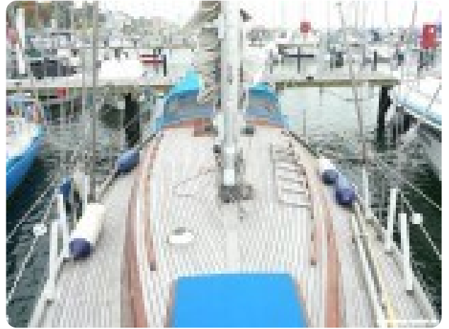
Vindö 50 msp269542 2