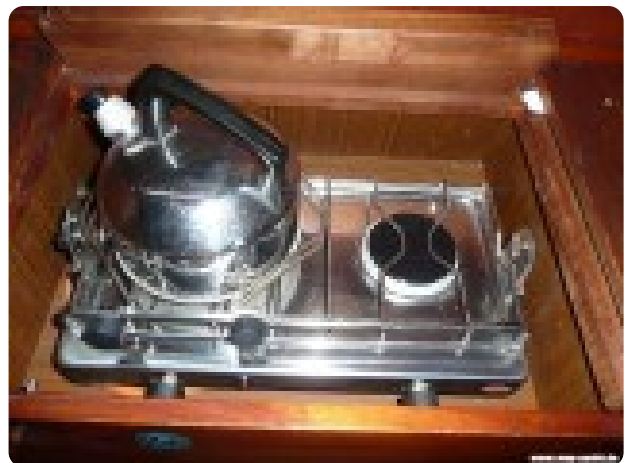
Vindö 50 msp269542 5