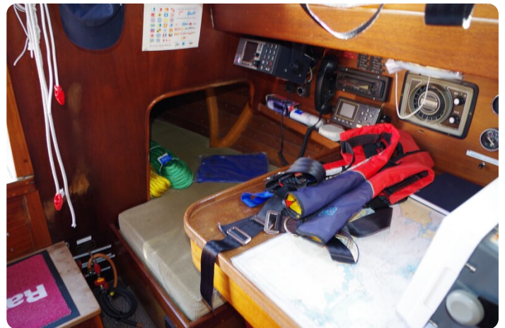
Vindö 50 msp269542 15