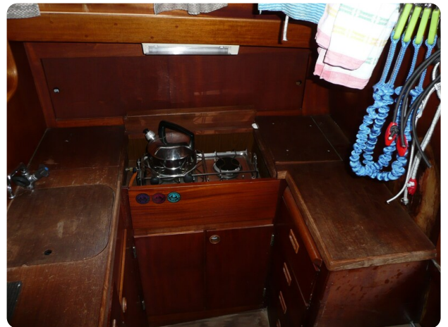
Vindö 50 msp269542 9