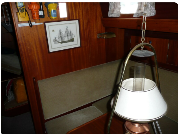
Vindö 50 msp269542 10