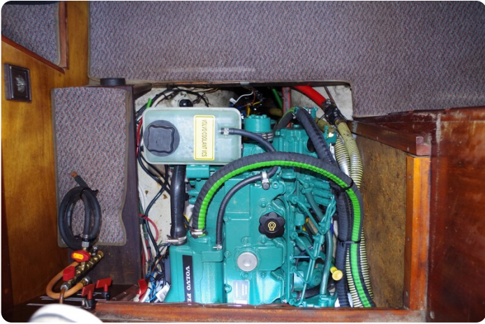
Vindö 50 msp269542 18