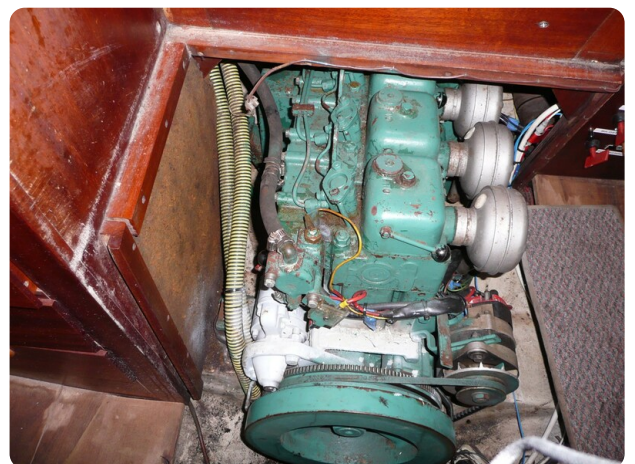
Vindö 50 msp269542 17