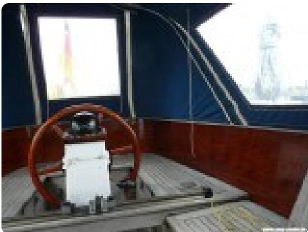
Vindö 50 msp269542 4