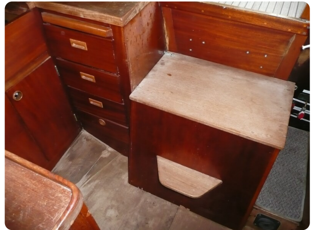
Vindö 50 msp269542 7