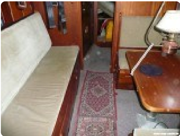
Vindö 50 msp269542 8