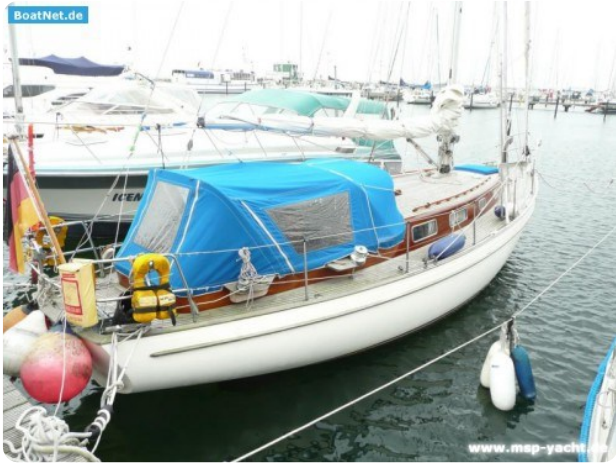
Vindö 50 msp269542 1