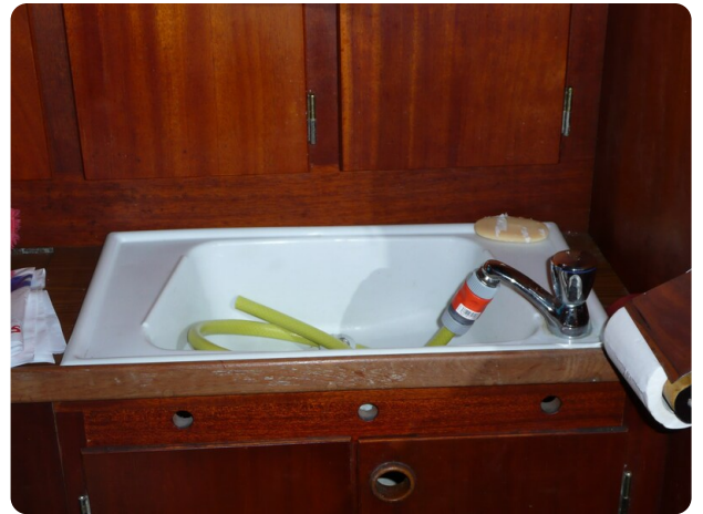
Vindö 50 msp269542 13