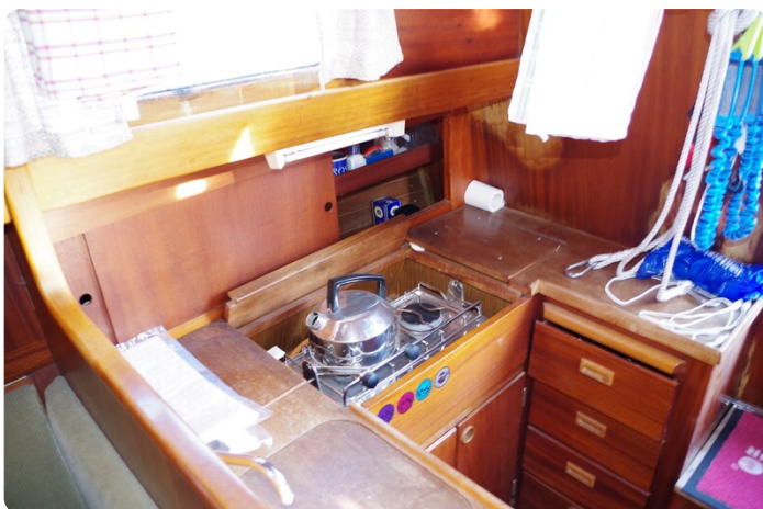
Vindö 50 msp269542 16