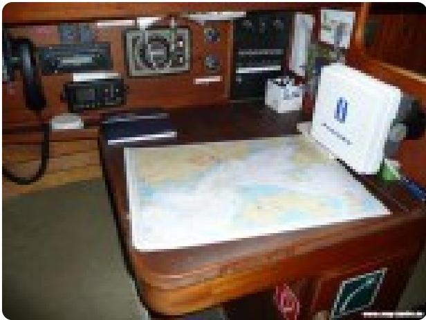
Vindö 50 msp269542 6