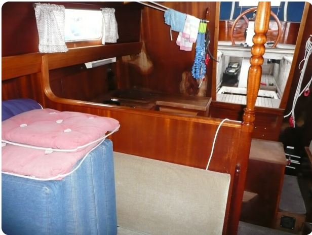
Vindö 50 msp269542 12