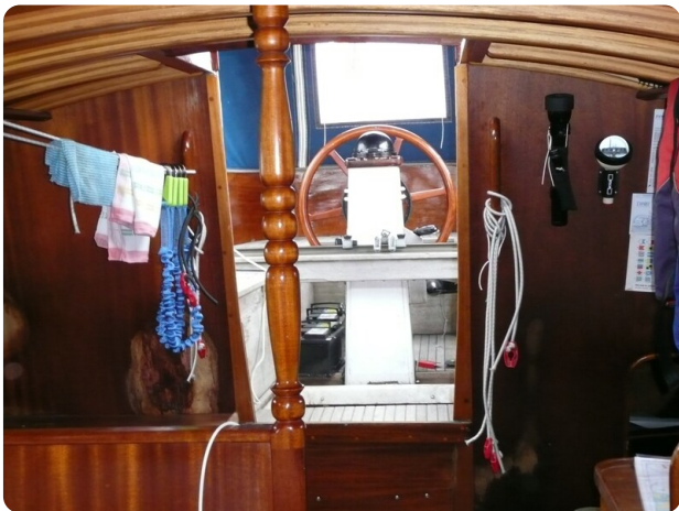
Vindö 50 msp269542 14