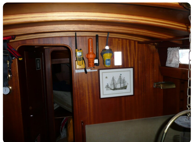
Vindö 50 msp269542 11