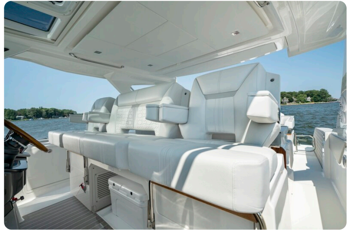
Tiara 43LS helm seats