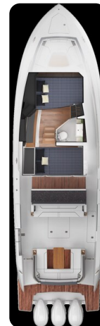
Tiara 43 LS interior layout