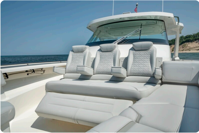
Tiara 43LS fwd seats