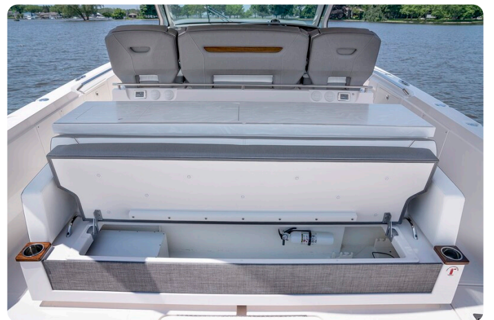
Tiara 43 LS aft storage