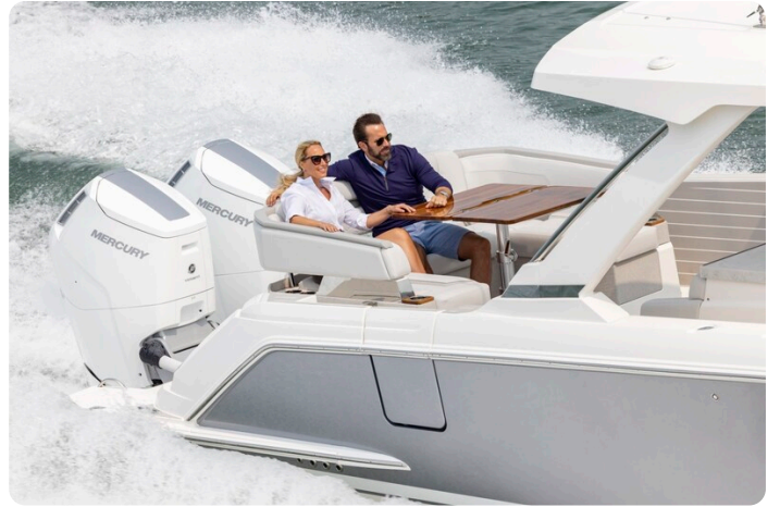
Tiara 43LS details