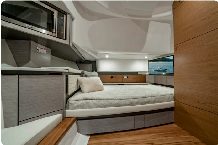
Tiara 43LS cabin