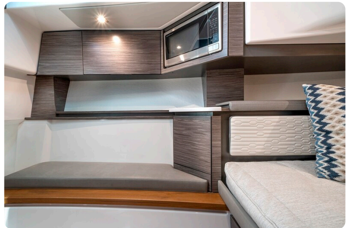
Tiara 43 LS interior detail