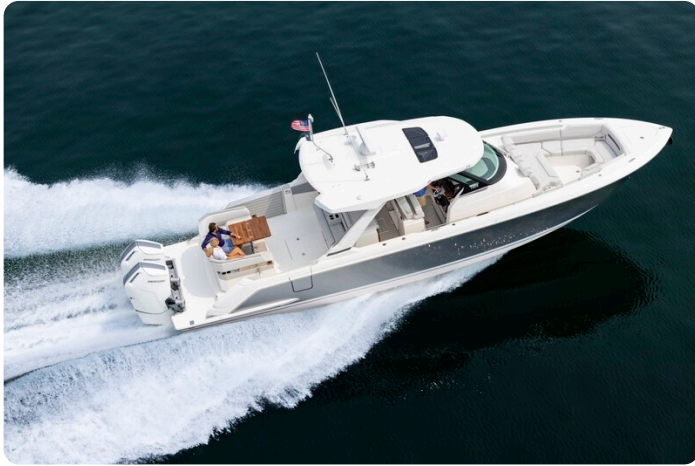
Tiara 43LS aerial view