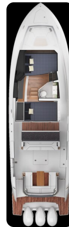
Tiara 43 LS interior layout