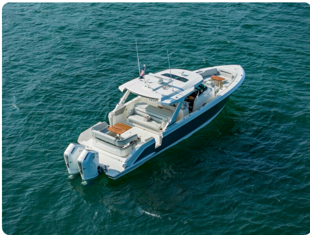
Tiara 43LS aerial