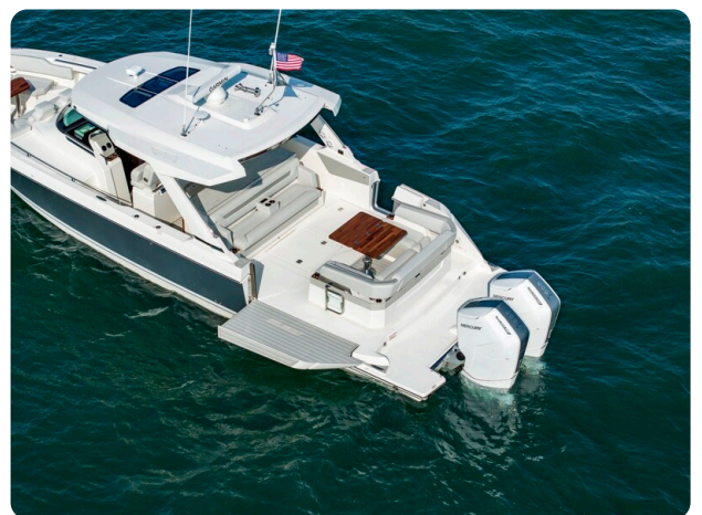
Tiara 43LS terrace detail