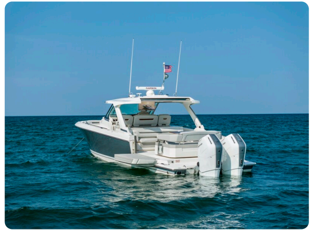
Tiara 43LS aft view