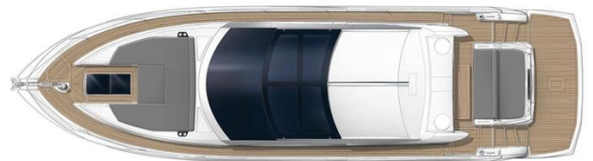
PRED50 upper deck