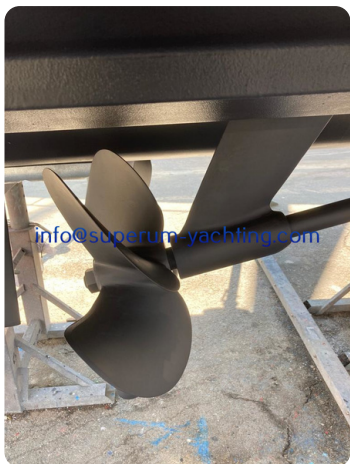
prop and shaft Velox treated