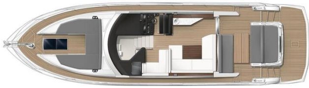
PRED50 main deck