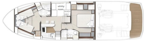
PRED50 lower deck w. utility room