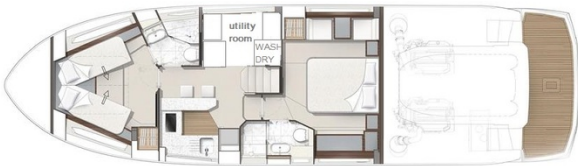
PRED50 lower deck w. utility room