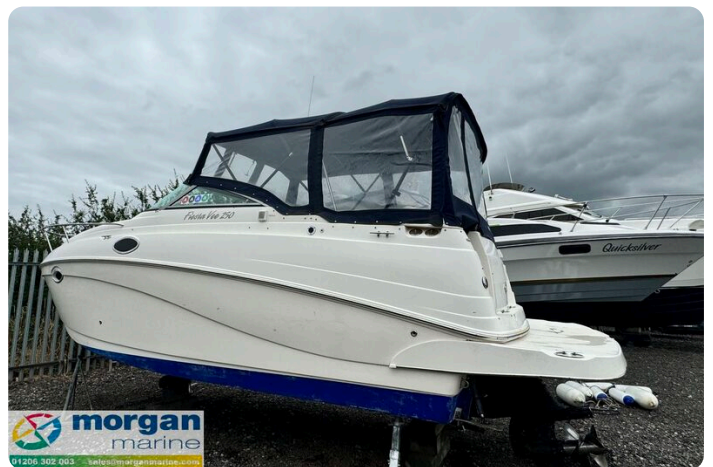
Rinker fiesta vee 250 boat - port side canopy