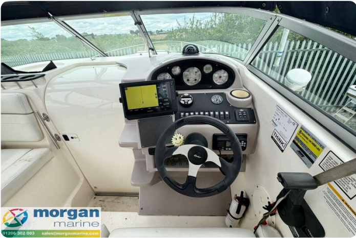
Rinker fiesta vee 250 boat - steering wheel