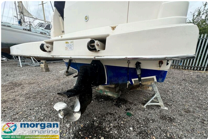
Rinker fiesta vee 250 boat - sterndrive and propeller