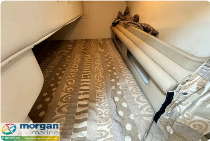
Rinker fiesta vee 250 boat - aft berth mattress