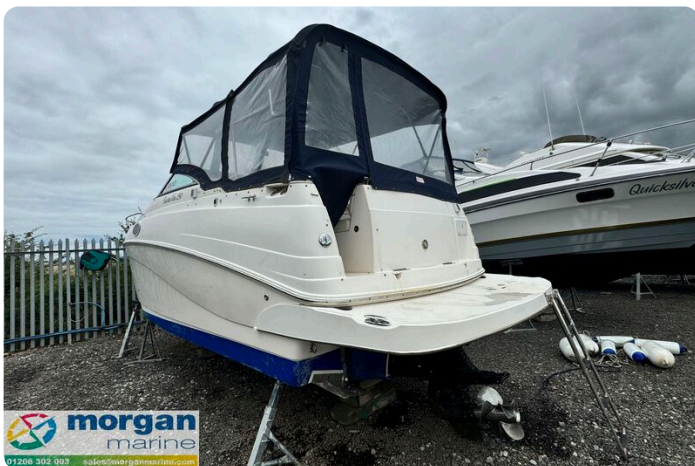
Rinker fiesta vee 250 boat - bathing platform and entrance to cockpit