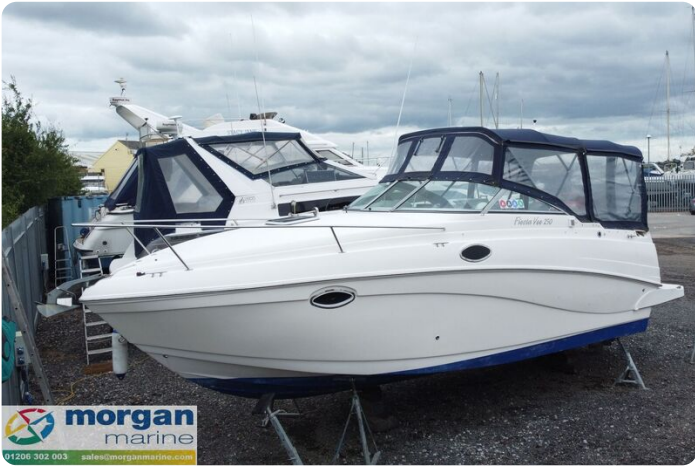
Rinker fiesta vee 250 boat - pulpit