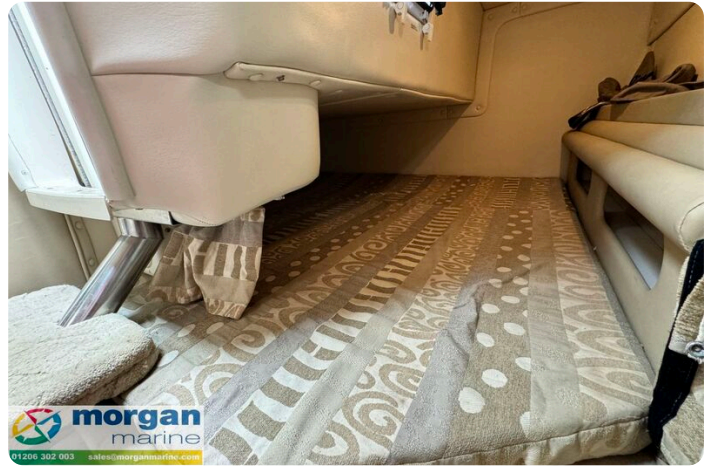
Rinker fiesta vee 250 boat - aft berth