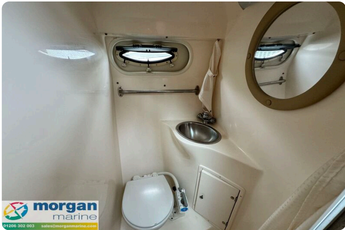
Rinker fiesta vee 250 boat - toilet compartment