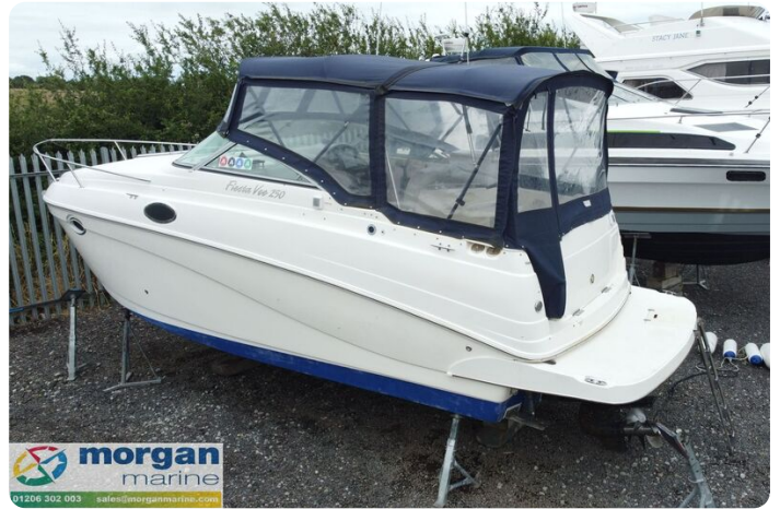
Rinker fiesta vee 250 boat - aft canopy