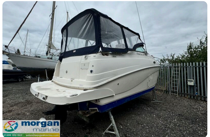
Rinker fiesta vee 250 boat - aft platform