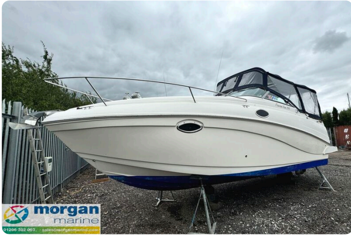
Rinker fiesta vee 250 boat