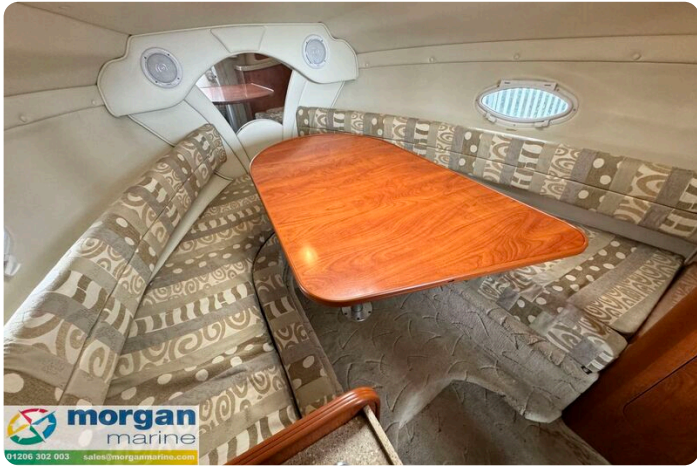
Rinker fiesta vee 250 boat - saloon table and seating