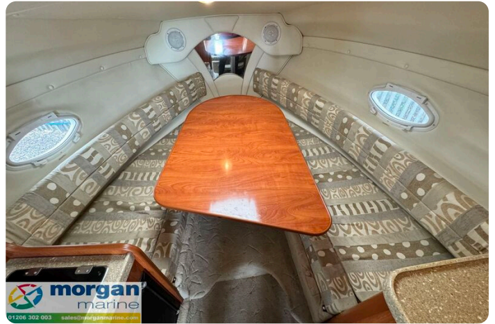
Rinker fiesta vee 250 boat - table in saloon