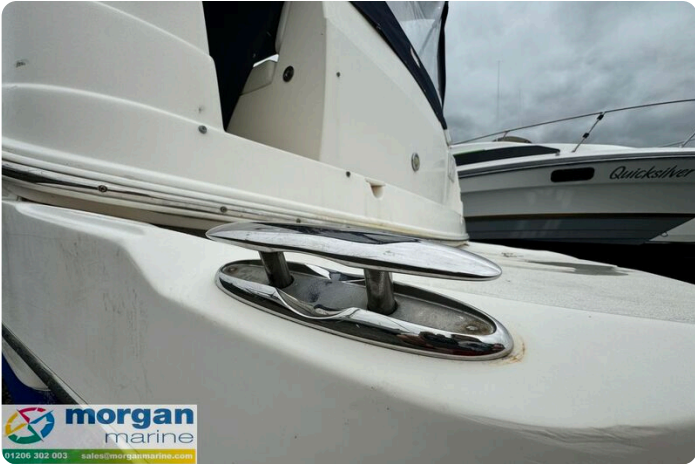
Rinker fiesta vee 250 boat - cleat