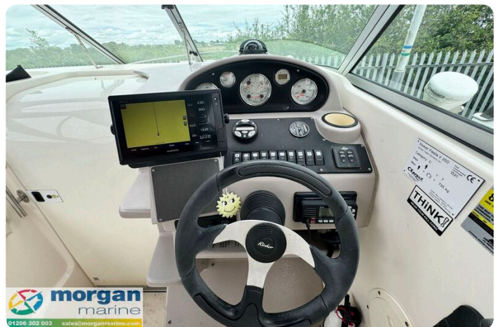
Rinker fiesta vee 250 boat - dash and engine controls