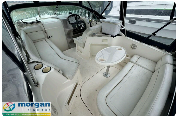
Rinker fiesta vee 250 boat - cockpit seating and table