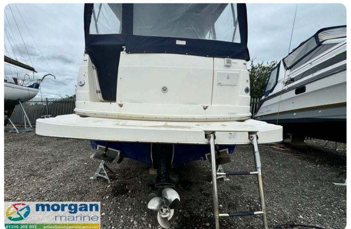
Rinker fiesta vee 250 boat - transom