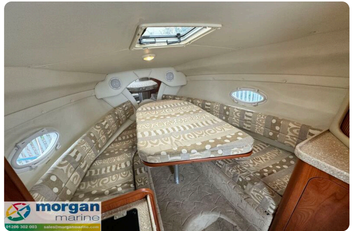
Rinker fiesta vee 250 boat - saloon infill