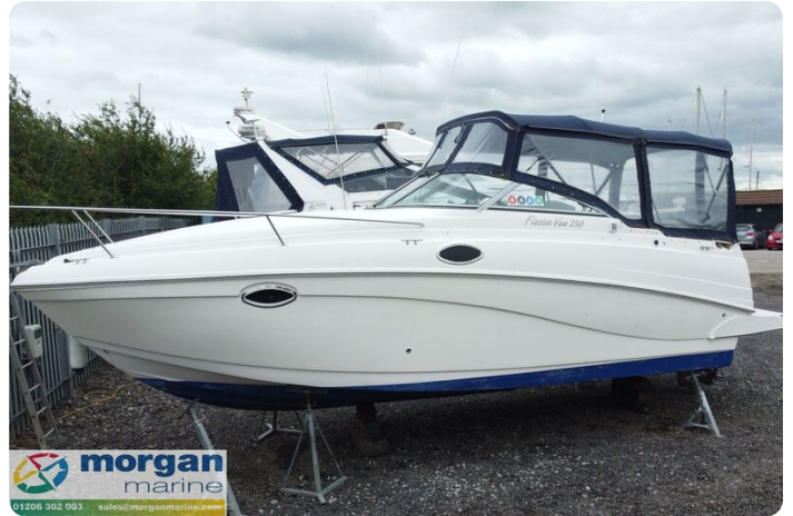
Rinker fiesta vee 250 boat - port side bow