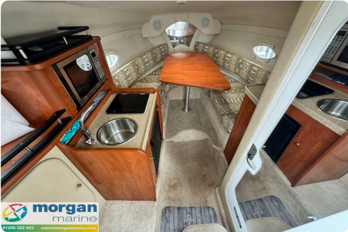
Rinker fiesta vee 250 boat - forward cabin saloon