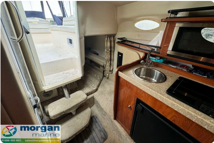
Rinker fiesta vee 250 boat - galley and steps to cockpit and quarterberth