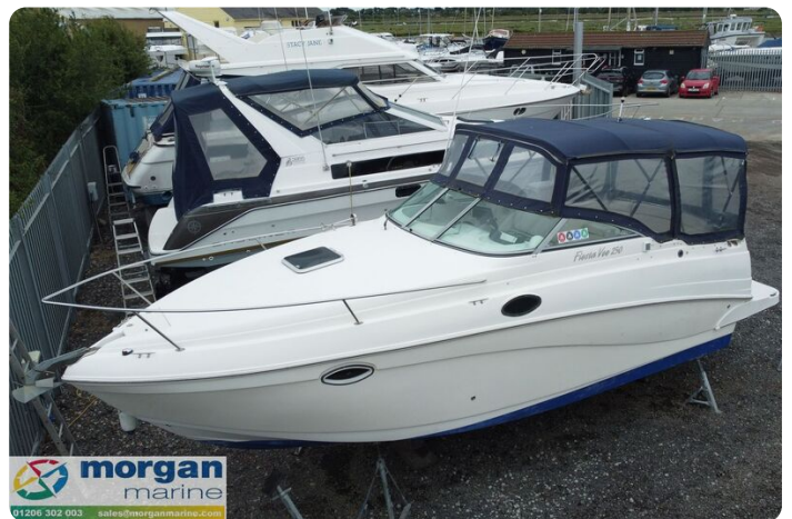
Rinker fiesta vee 250 boat - bow area