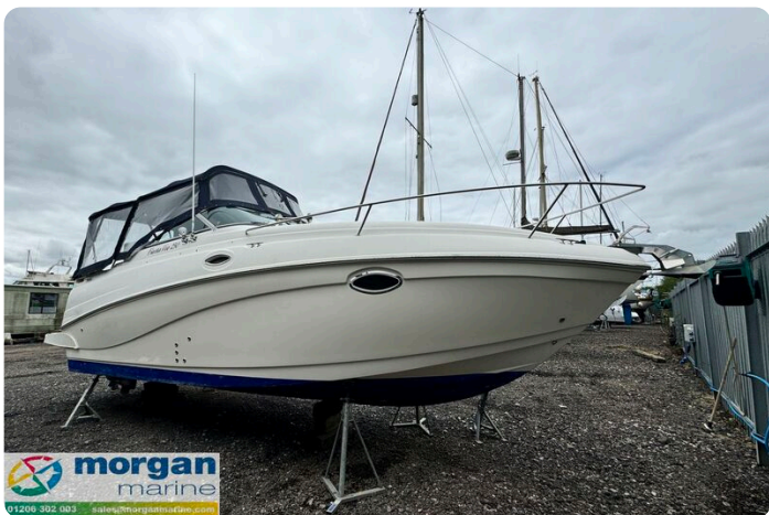
Rinker fiesta vee 250 boat - starboard side bow