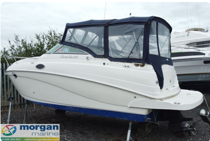
Rinker fiesta vee 250 boat - port side