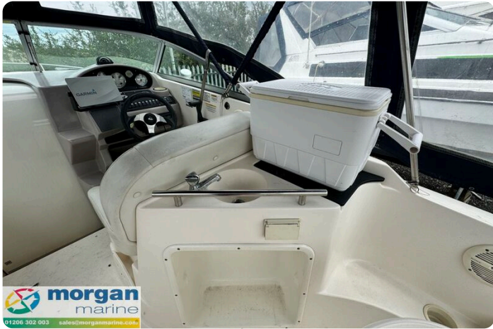
Rinker fiesta vee 250 boat - cockpit sink