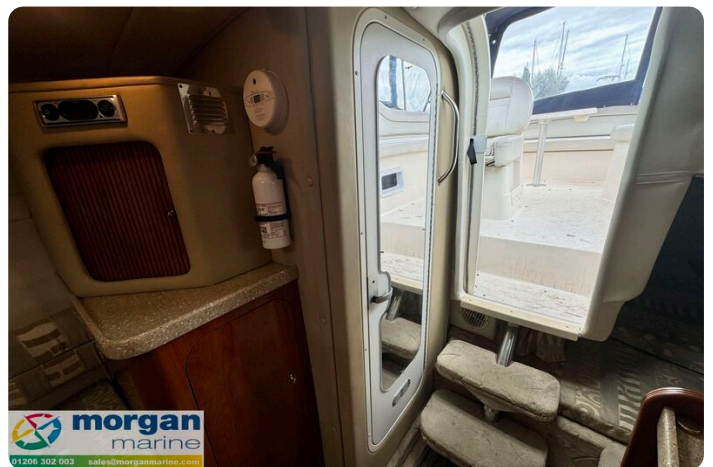
Rinker fiesta vee 250 boat - steps to cockpit