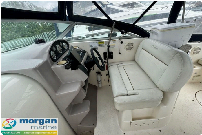
Rinker fiesta vee 250 boat - pilot and co-pilot seating