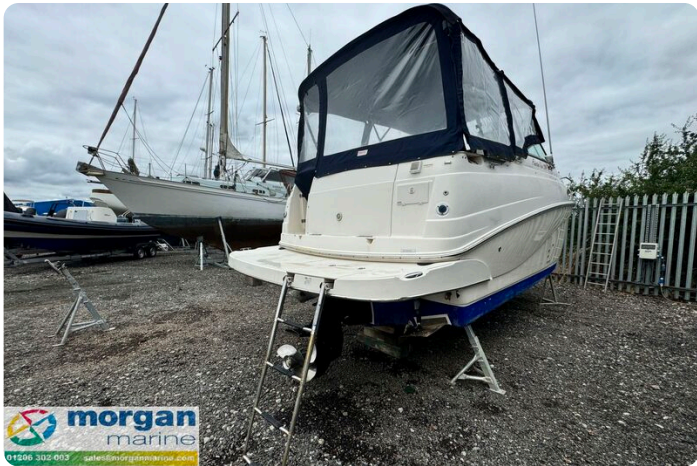
Rinker fiesta vee 250 boat - boarding ladder