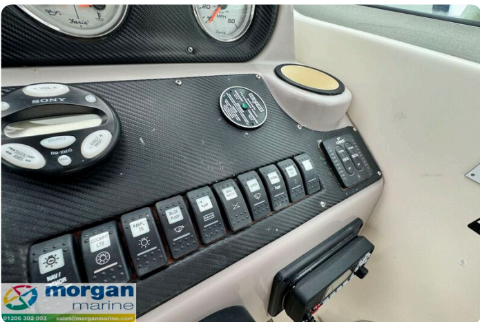
Rinker fiesta vee 250 boat - switch panel