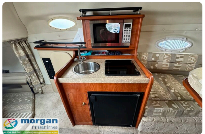
Rinker fiesta vee 250 boat - galley