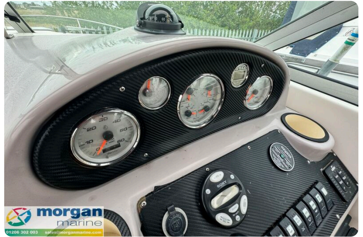
Rinker fiesta vee 250 boat - gauges on dash