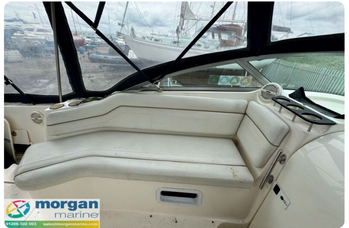
Rinker fiesta vee 250 boat - cockpit sun lounger