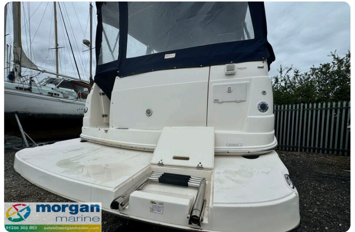
Rinker fiesta vee 250 boat - folding boarding ladder