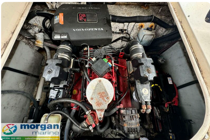
Rinker fiesta vee 250 boat - engine