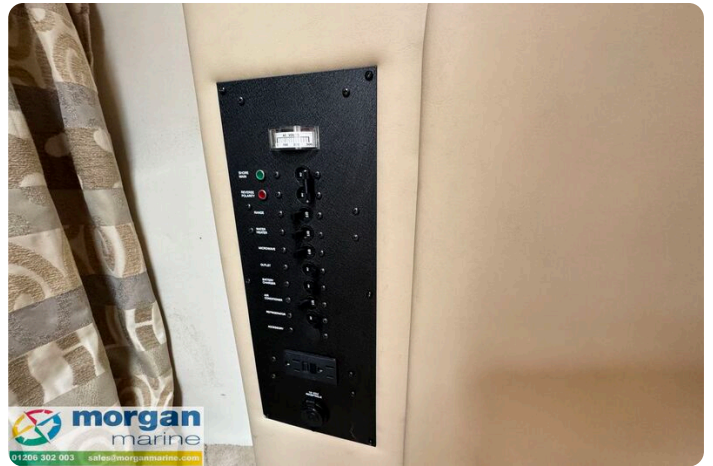
Rinker fiesta vee 250 boat - panel