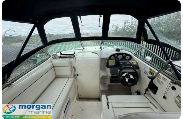
Rinker fiesta vee 250 boat - helm area