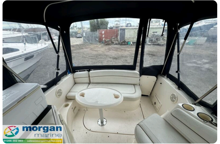
Rinker fiesta vee 250 boat - view from cockpit through aft canopy