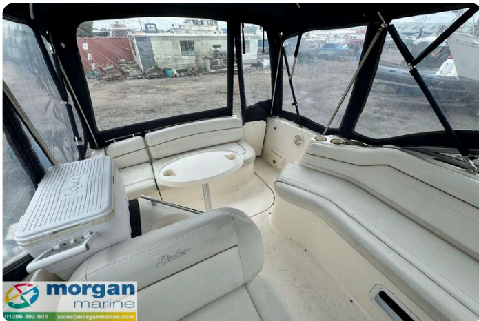
Rinker fiesta vee 250 boat - cockpit seating from helm