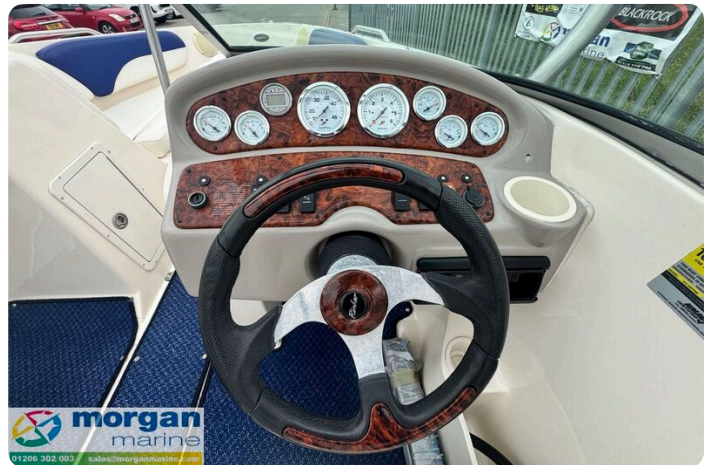
Rinker 212 bow rider - wheel 2