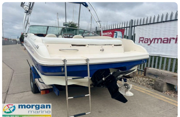
Rinker 212 bow rider - ladder