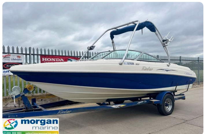
Rinker 212 bow rider - main