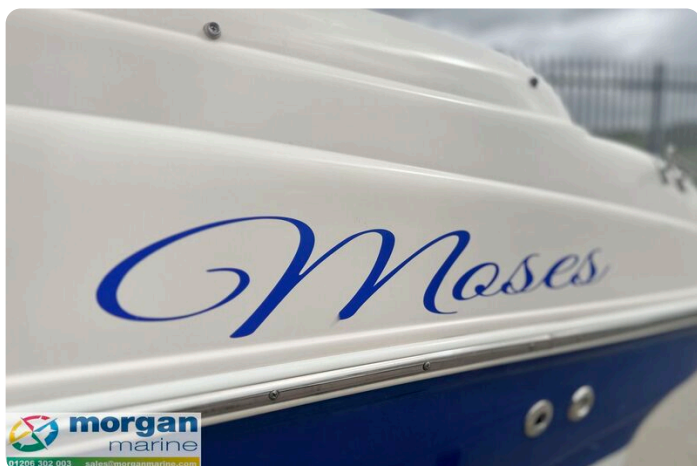
Rinker 212 bow rider - name