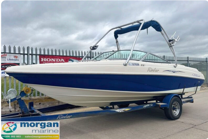
Rinker 212 bow rider - side