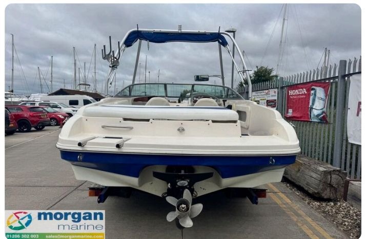
Rinker 212 bow rider - engine