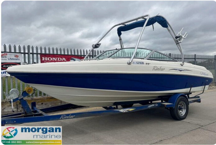
Rinker 212 bow rider - rails