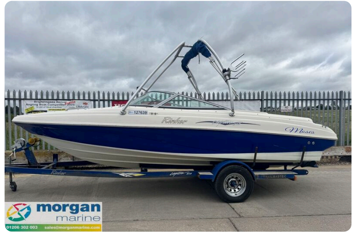
Rinker 212 bow rider - side view