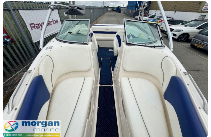
Rinker 212 bow rider - bow walk through