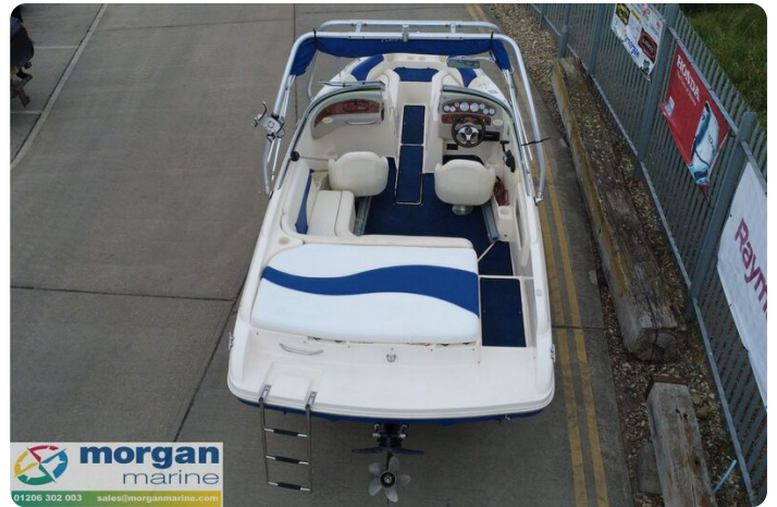
Rinker 212 bow rider - back view