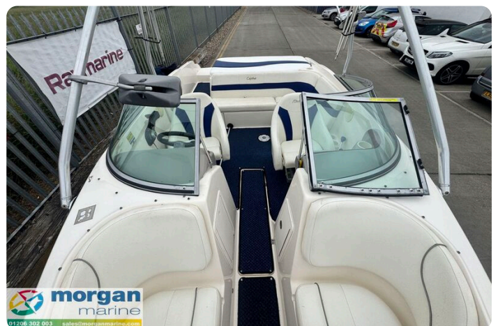
Rinker 212 bow rider - walk through window 1