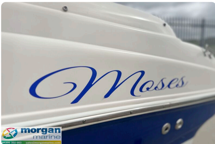
Rinker 212 bow rider - name