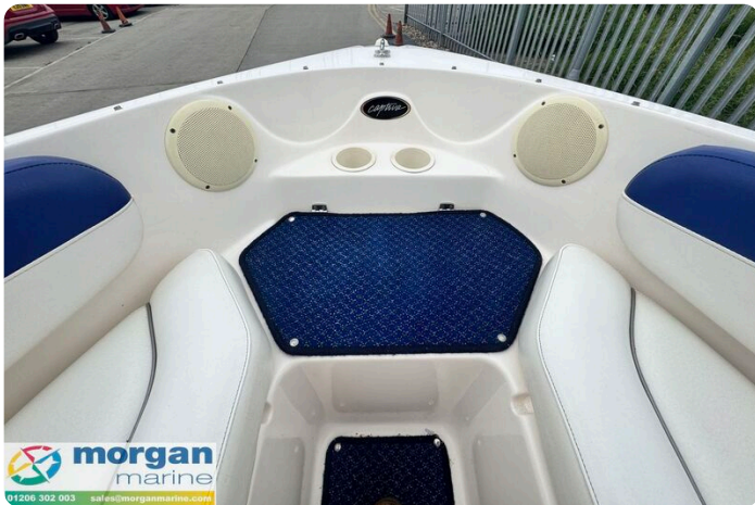
Rinker 212 bow rider - bow locker