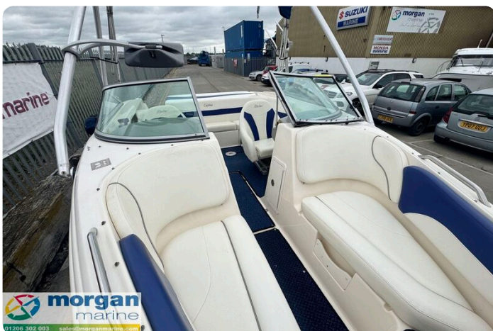
Rinker 212 bow rider - walk through