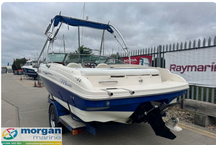
Rinker 212 bow rider - prop