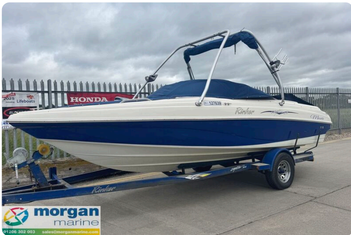
Rinker 212 bow rider - cover