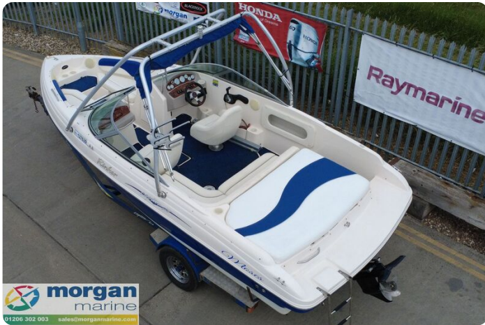
Rinker 212 bow rider - overview