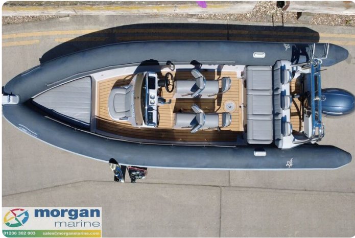
Ribeye S650 - top view