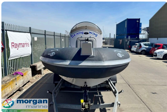
Ribeye S650 - bow