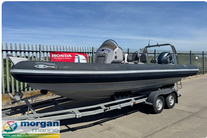
Ribeye S650 - side