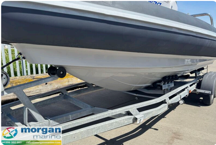
Ribeye S650 - hull