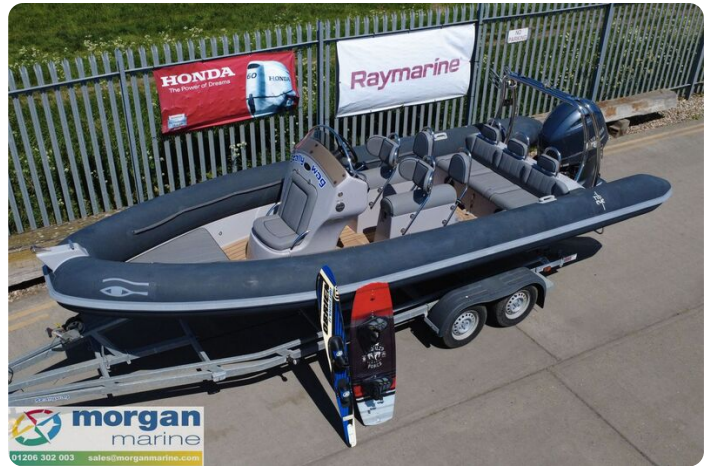
Ribeye S650 - overview