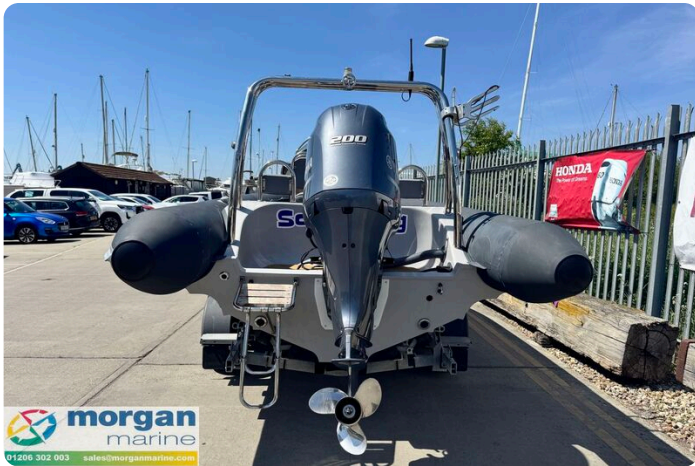
Ribeye S650 - engine