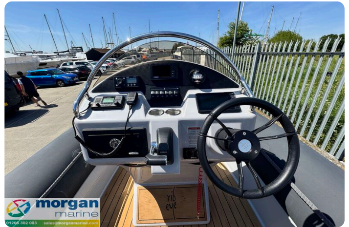
Ribeye S650 - console