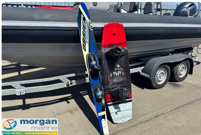
Ribeye S650 - wakeboard 1