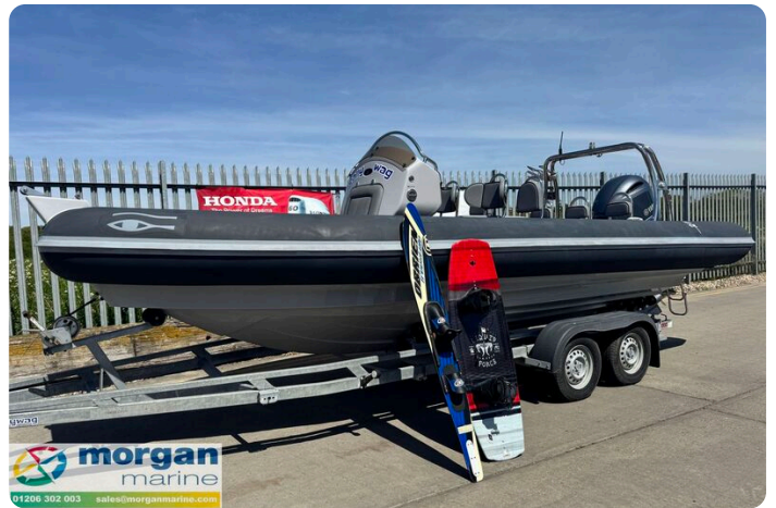
Ribeye S650 - wakeboard