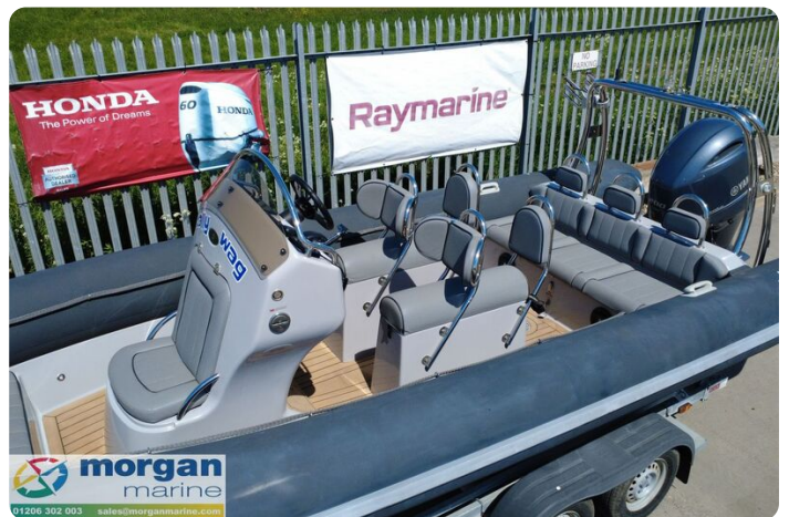
Ribeye S650 - backrests