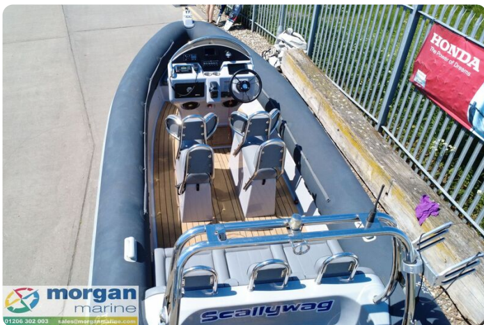
Ribeye S650 - overview