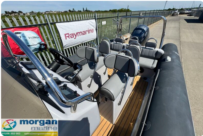
Ribeye S650 - jockeys