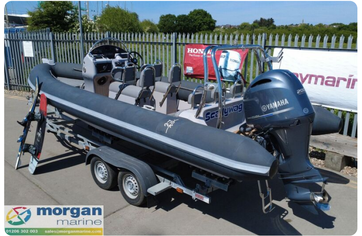
Ribeye S650 - aframe