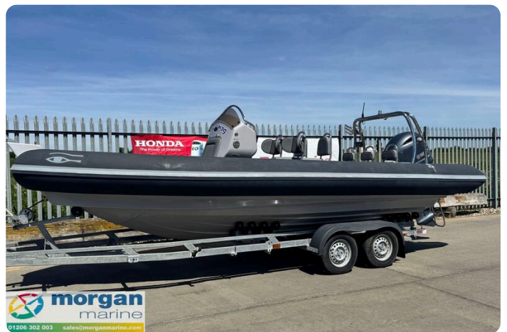
Ribeye S650 - trailer