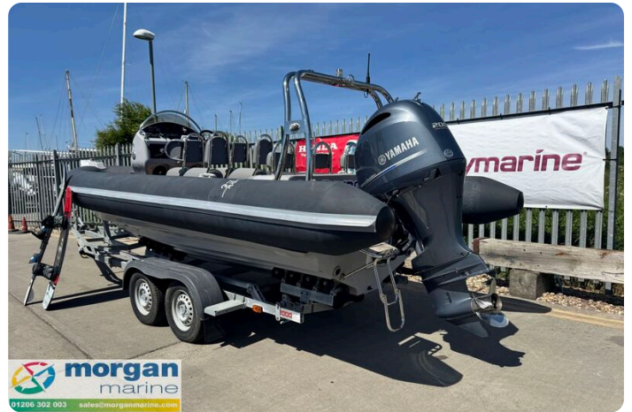
Ribeye S650 - ladder