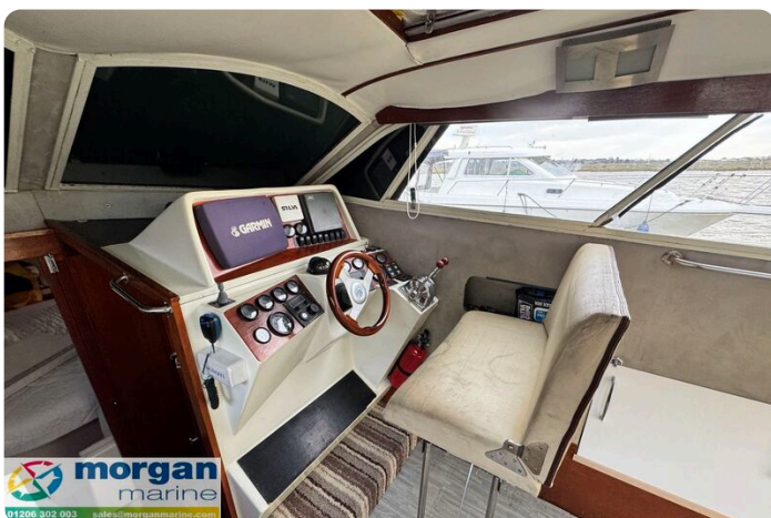
Relcraft Diamond Sedan 30 - pilot