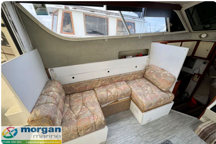
Relcraft Diamond Sedan 30 - saloon seating