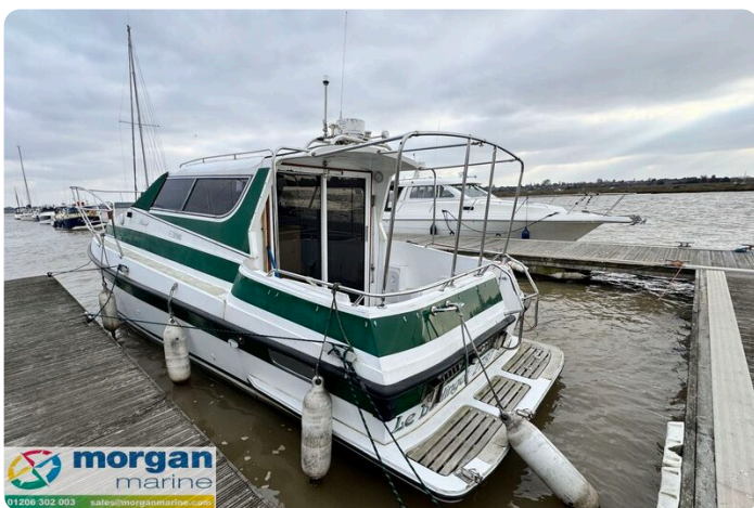
Relcraft Diamond Sedan 30 - bathing