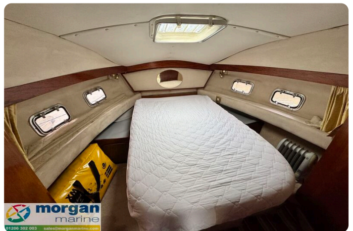
Relcraft Diamond Sedan 30 - berth