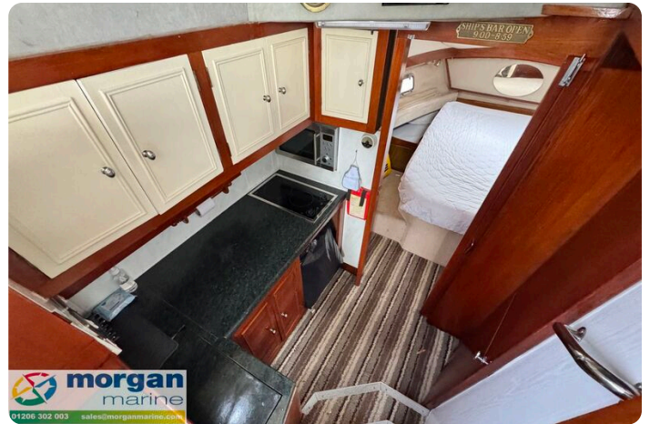
Relcraft Diamond Sedan 30 - galley