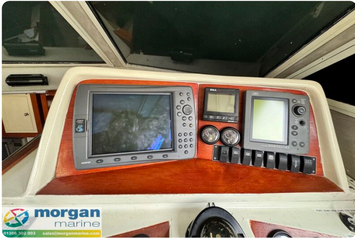
Relcraft Diamond Sedan 30 - plotters