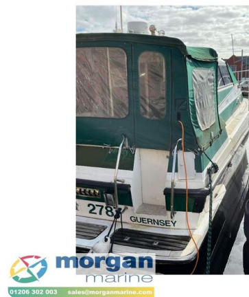
Relcraft Sedan 30 - Canopy