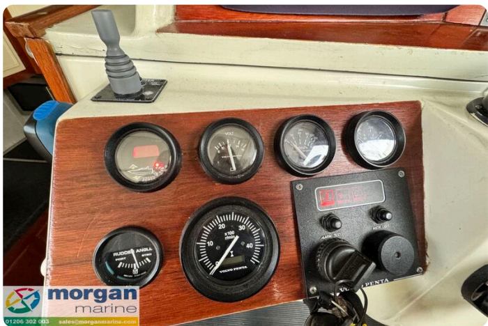
Relcraft Diamond Sedan 30 - thruster