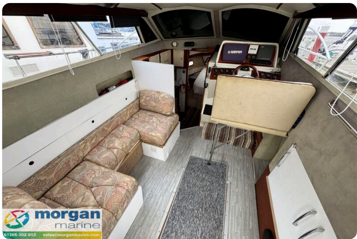
Relcraft Diamond Sedan 30 - saloon