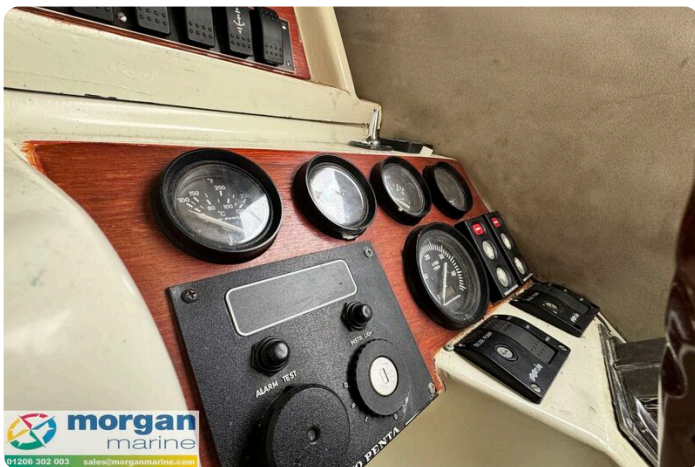
Relcraft Diamond Sedan 30 - gauges