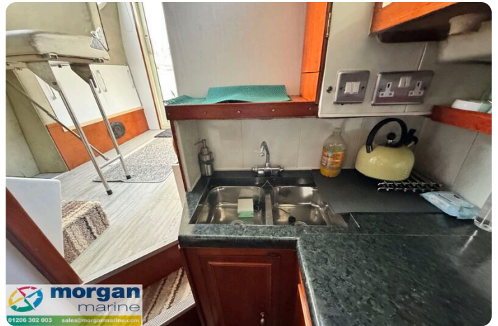
Relcraft Diamond Sedan 30 - sink