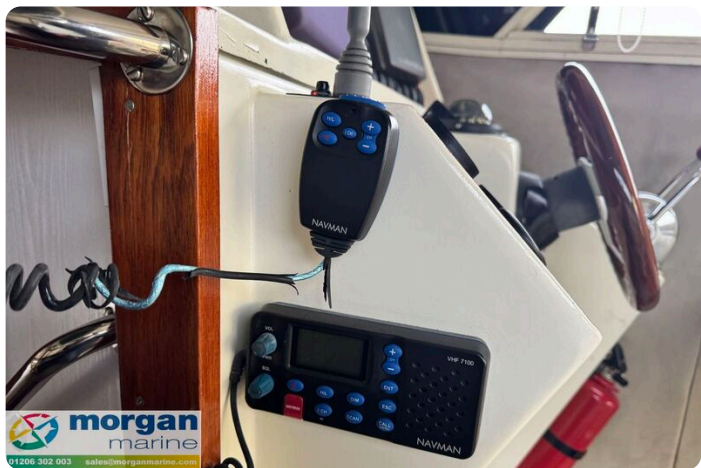
Relcraft Diamond Sedan 30 - vhf radio