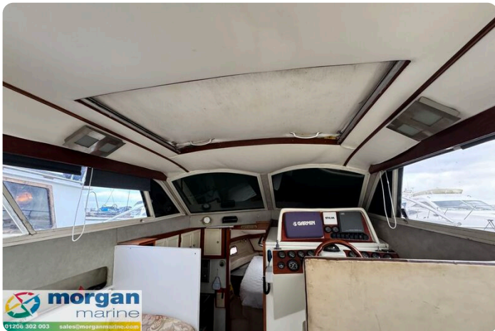
Relcraft Diamond Sedan 30 - hatch