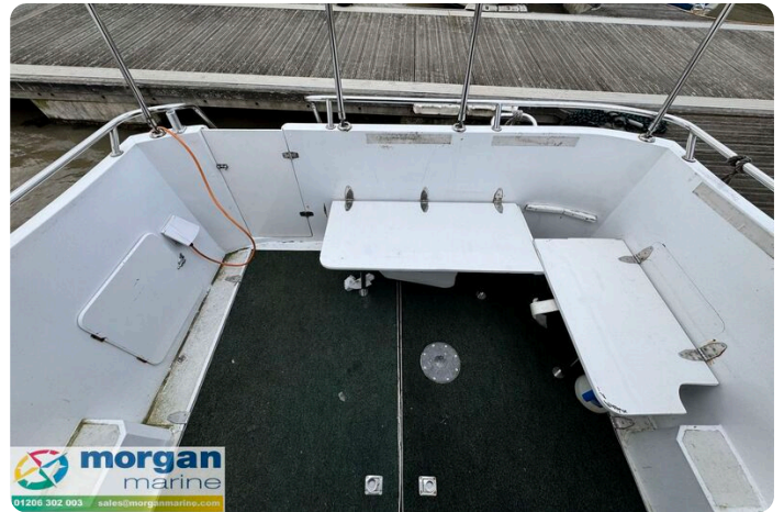
Relcraft Diamond Sedan 30 - cockpit