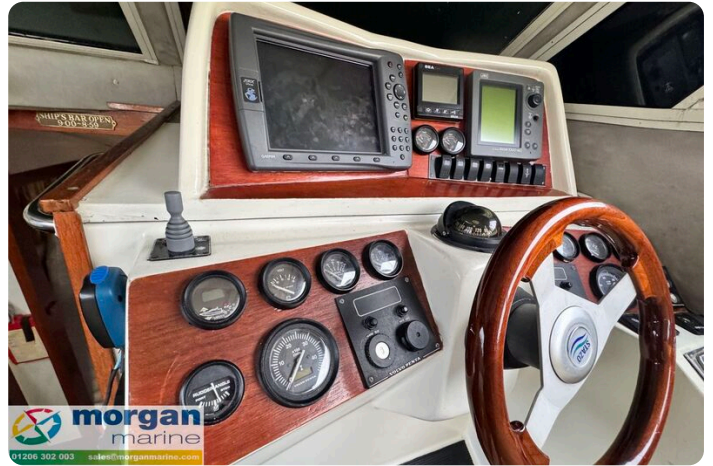
Relcraft Diamond Sedan 30 - bow thruster