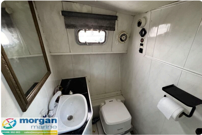
Relcraft Diamond Sedan 30 - toilet