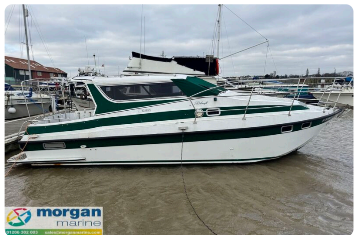
Relcraft Diamond Sedan 30 - side