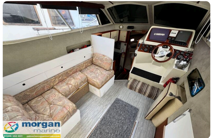
Relcraft Diamond Sedan 30 - saloon 1