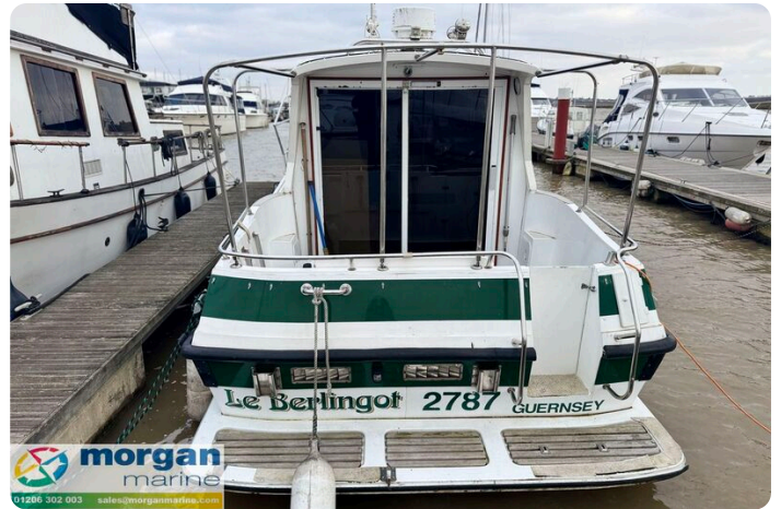
Relcraft Diamond Sedan 30 - bathing platform