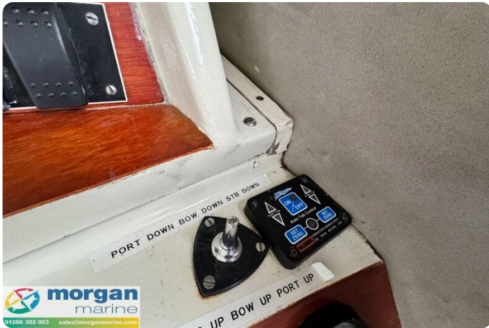
Relcraft Diamond Sedan 30 - trim tab controls