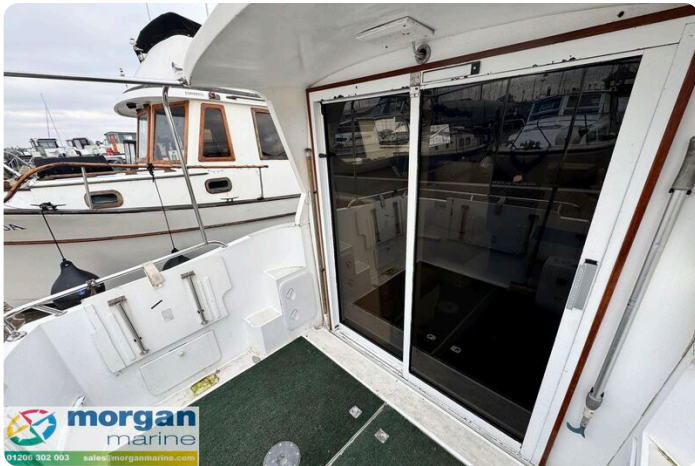
Relcraft Diamond Sedan 30 - cockpit doors