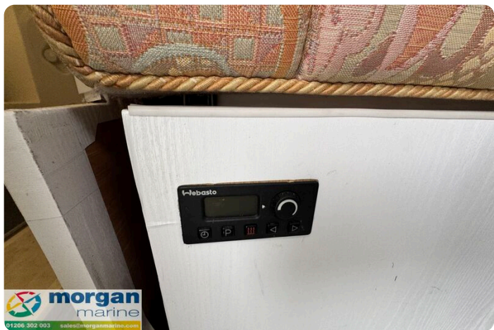
Relcraft Diamond Sedan 30 - heating