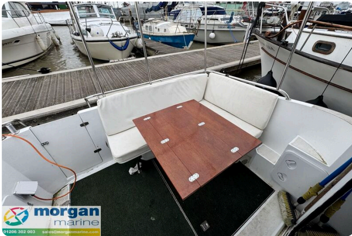
Relcraft Diamond Sedan 30 - cockpit seating