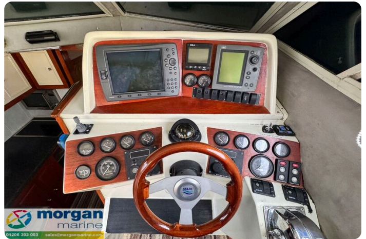
Relcraft Diamond Sedan 30 - wheel