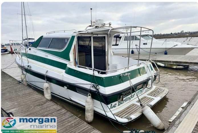
Relcraft Diamond Sedan 30 - fenders