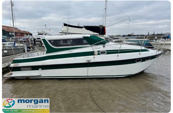
Relcraft Diamond Sedan 30 - side