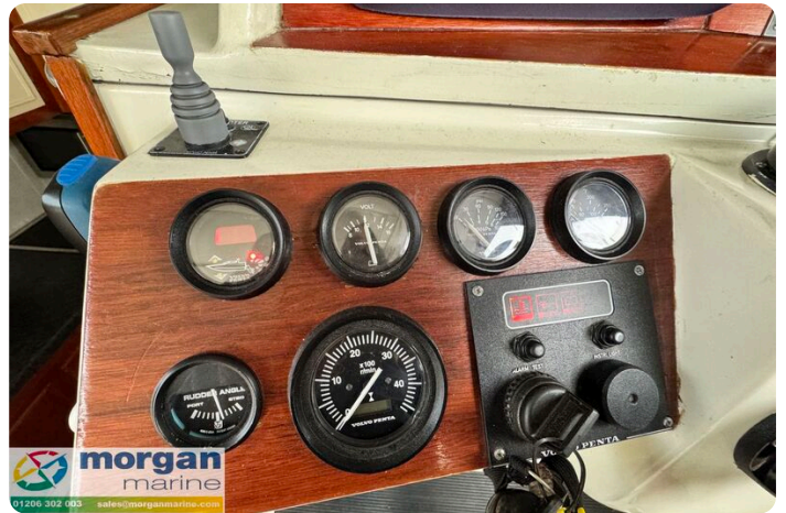
Relcraft Diamond Sedan 30 - thruster