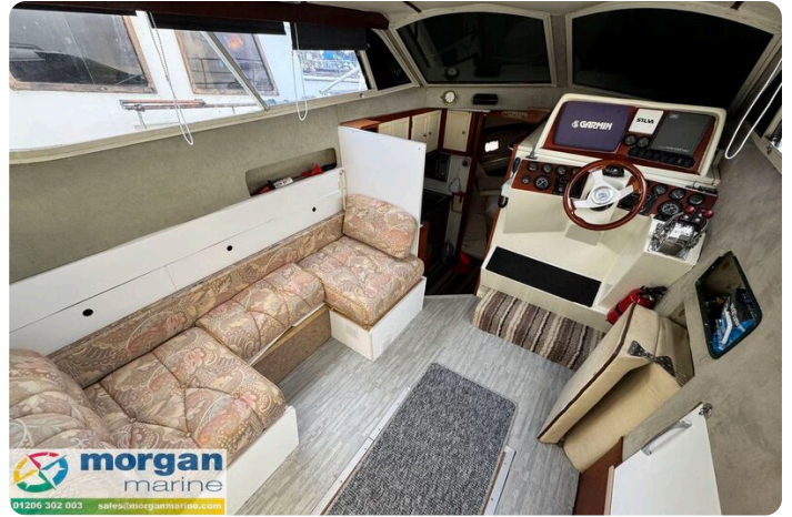
Relcraft Diamond Sedan 30 - saloon 1