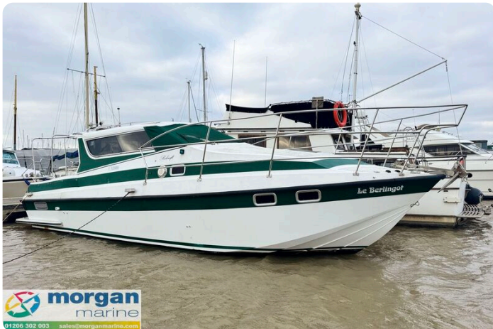
Relcraft Diamond Sedan 30 - main