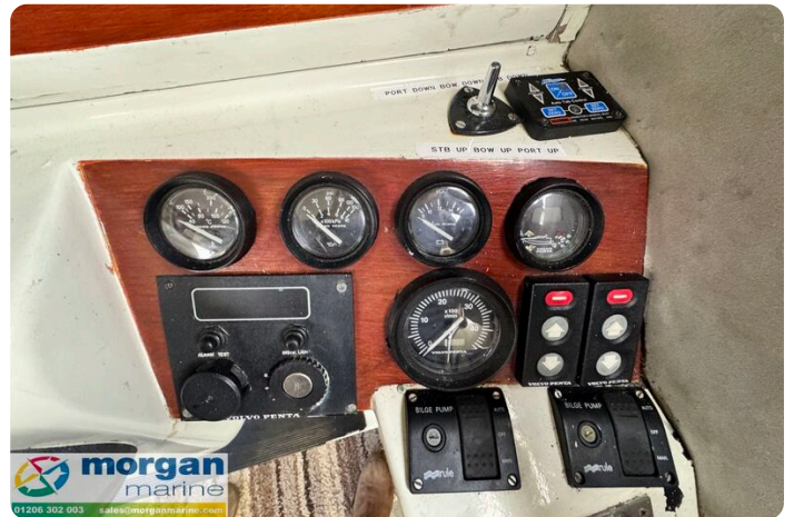
Relcraft Diamond Sedan 30 - trim tabs