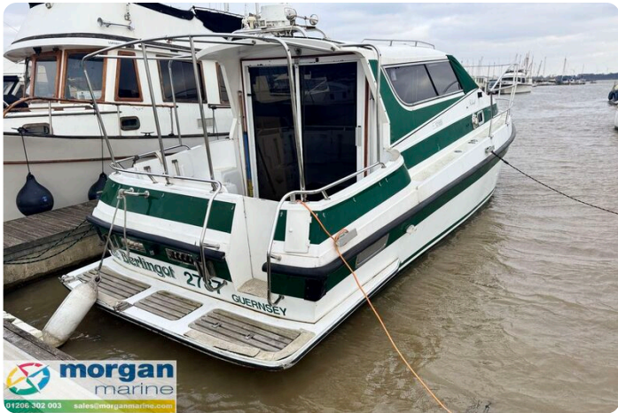
Relcraft Diamond Sedan 30 - back