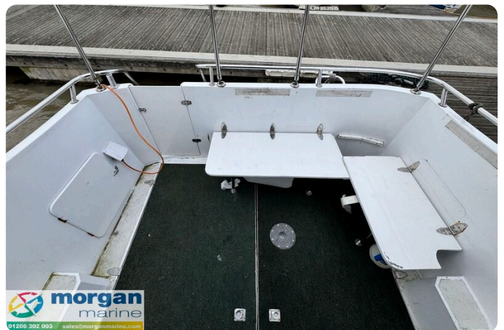
Relcraft Diamond Sedan 30 - cockpit