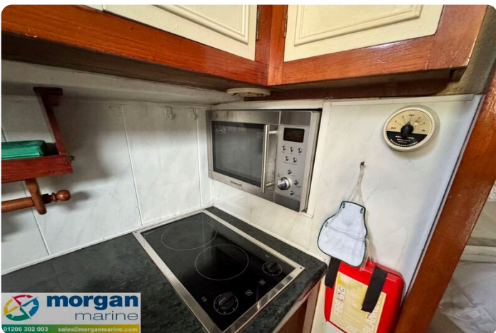
Relcraft Diamond Sedan 30 - cooker