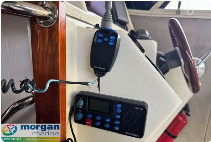
Relcraft Diamond Sedan 30 - vhf radio