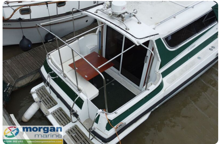
Relcraft Diamond Sedan 30 - canopy