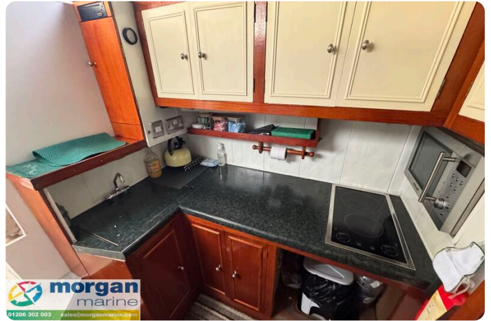
Relcraft Diamond Sedan 30 - kitchen