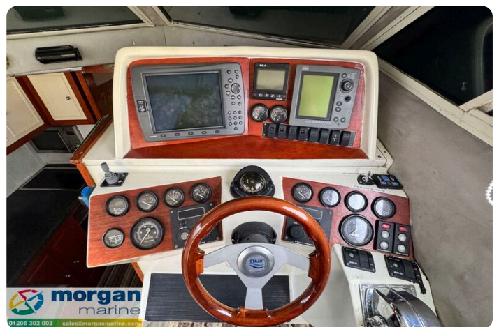
Relcraft Diamond Sedan 30 - wheel