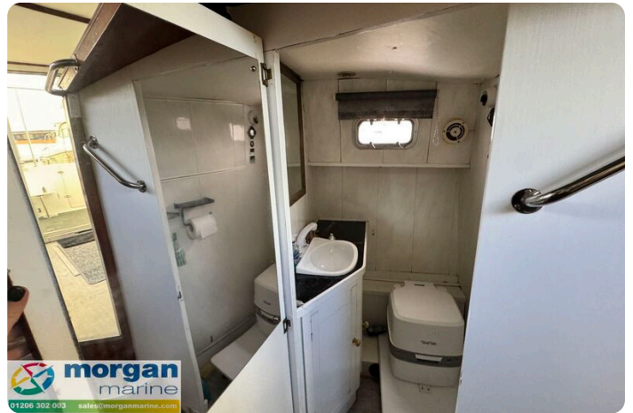
Relcraft Diamond Sedan 30 - mirror