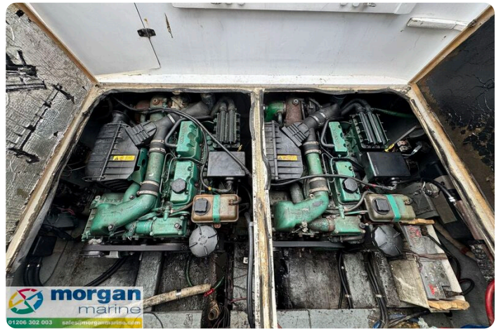
Relcraft Diamond Sedan 30 - engine