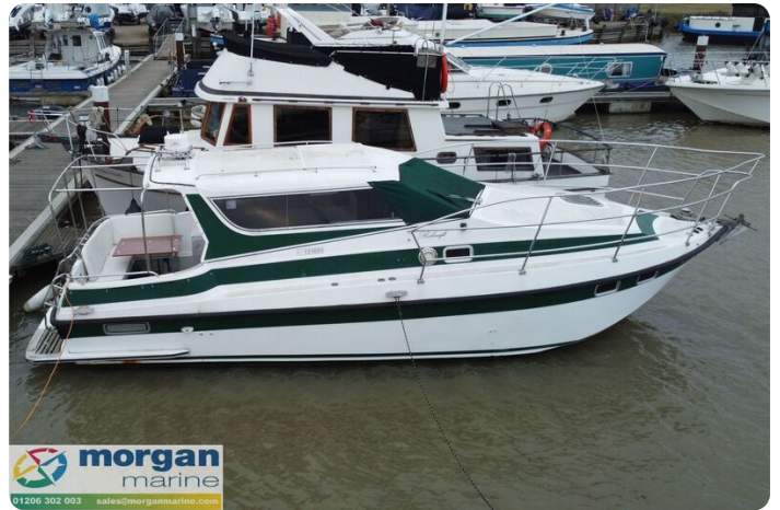
Relcraft Diamond Sedan 30 - side