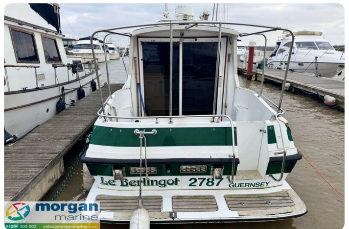
Relcraft Diamond Sedan 30 - bathing platform