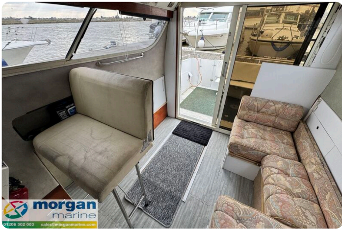
Relcraft Diamond Sedan 30 - pilot seat