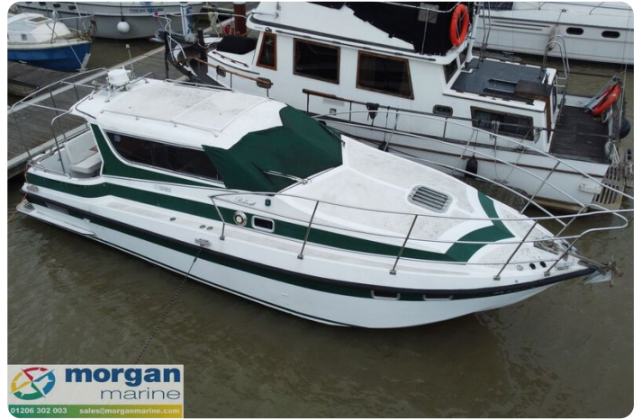
Relcraft Diamond Sedan 30 - bow