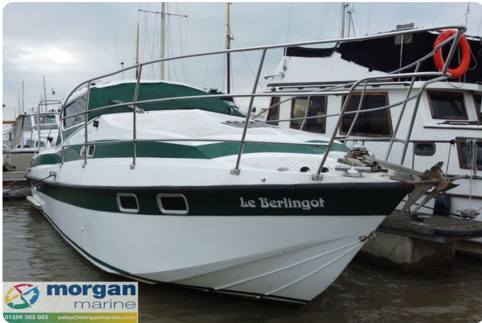
Relcraft Diamond Sedan 30 - bow view