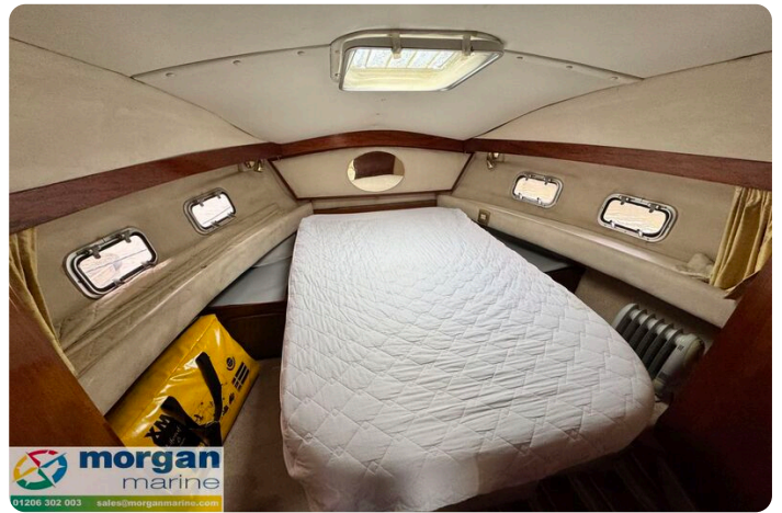
Relcraft Diamond Sedan 30 - berth