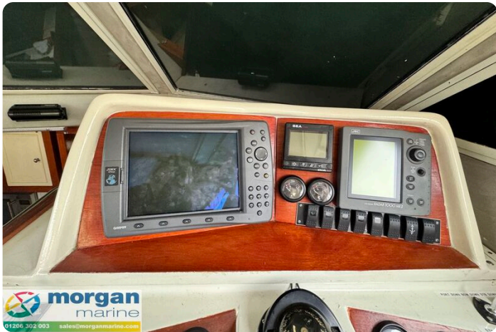
Relcraft Diamond Sedan 30 - plotters