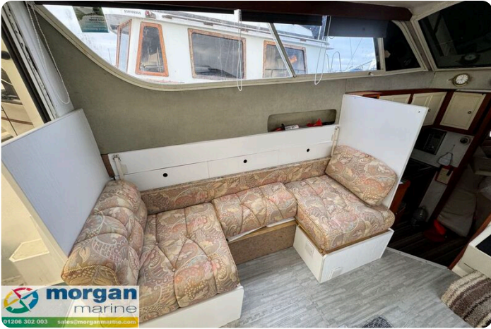
Relcraft Diamond Sedan 30 - saloon seating