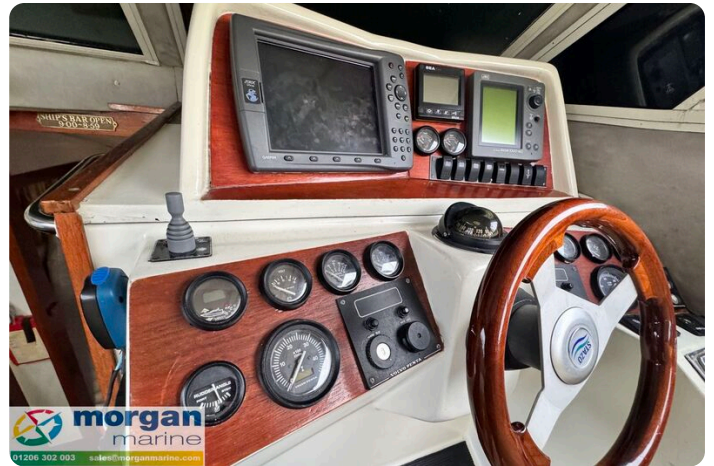
Relcraft Diamond Sedan 30 - bow thruster