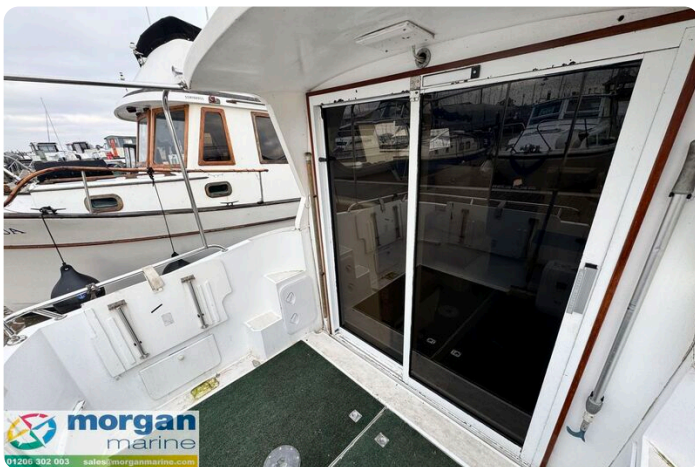
Relcraft Diamond Sedan 30 - cockpit doors