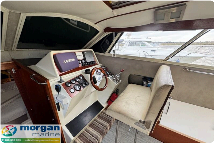
Relcraft Diamond Sedan 30 - pilot