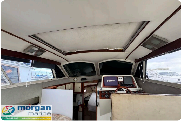
Relcraft Diamond Sedan 30 - hatch