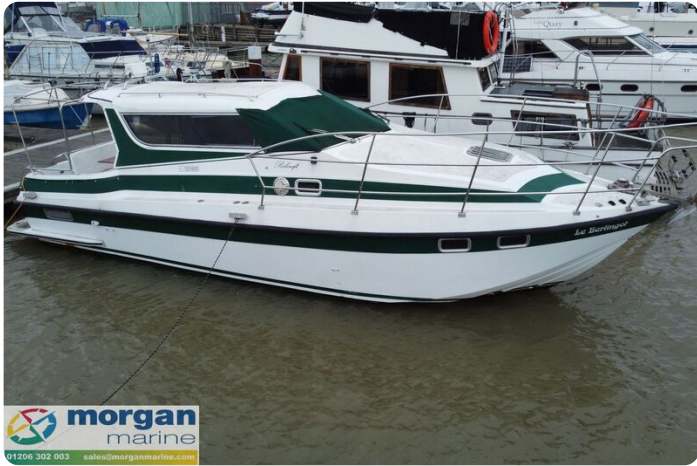
Relcraft Diamond Sedan 30 - rails