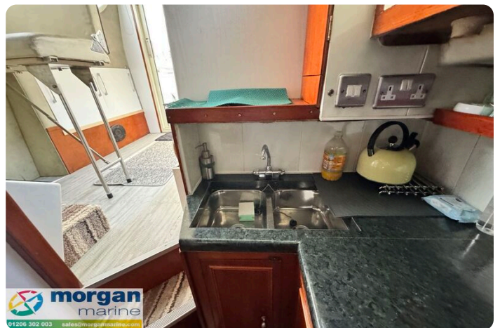
Relcraft Diamond Sedan 30 - sink