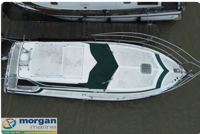
Relcraft Diamond Sedan 30 - top -view