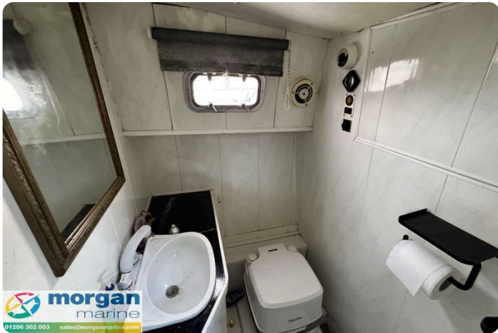
Relcraft Diamond Sedan 30 - toilet