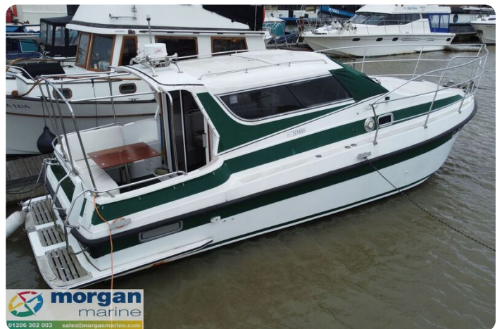
Relcraft Diamond Sedan 30 - back view