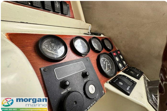
Relcraft Diamond Sedan 30 - gauges