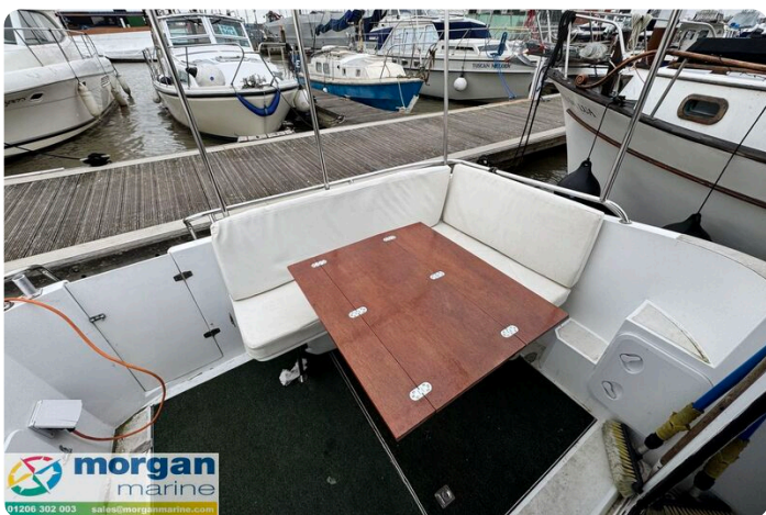
Relcraft Diamond Sedan 30 - cockpit seating