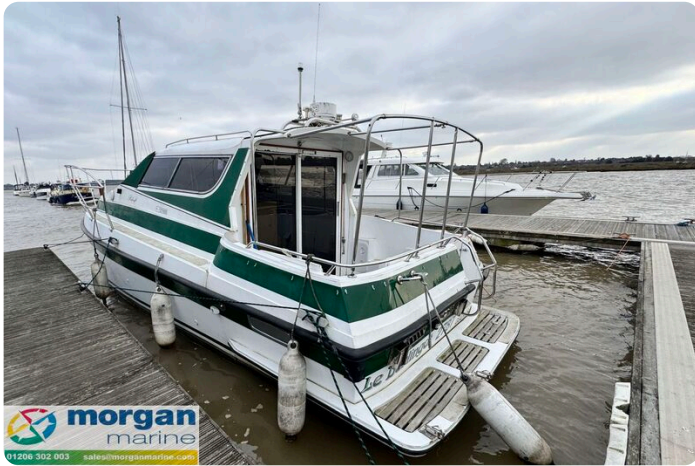
Relcraft Diamond Sedan 30 - bathing