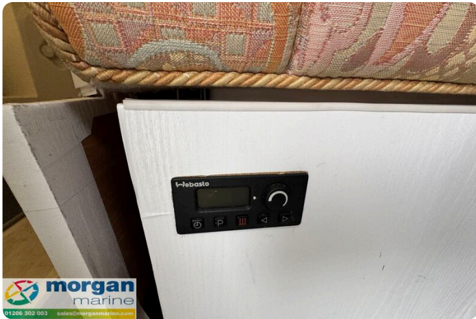
Relcraft Diamond Sedan 30 - heating