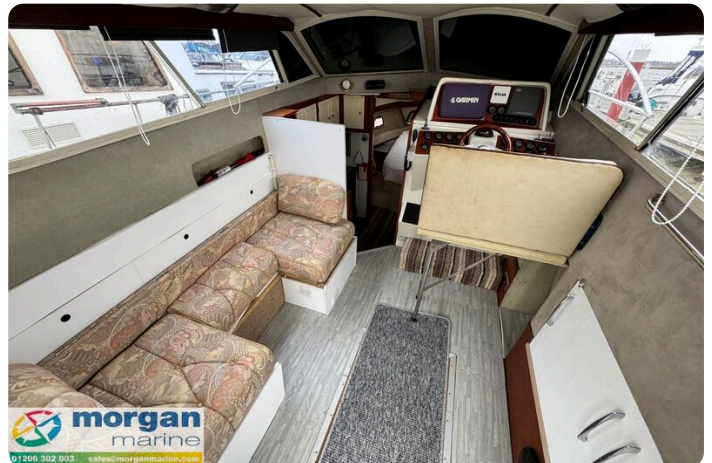
Relcraft Diamond Sedan 30 - saloon