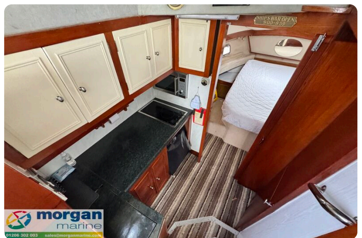
Relcraft Diamond Sedan 30 - galley