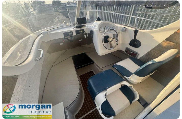
Quicksliver 640 - seating