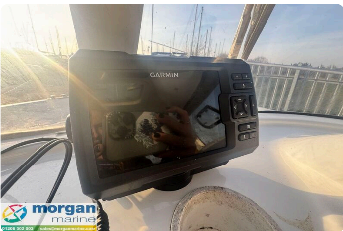
Quicksilver 640 - plotter