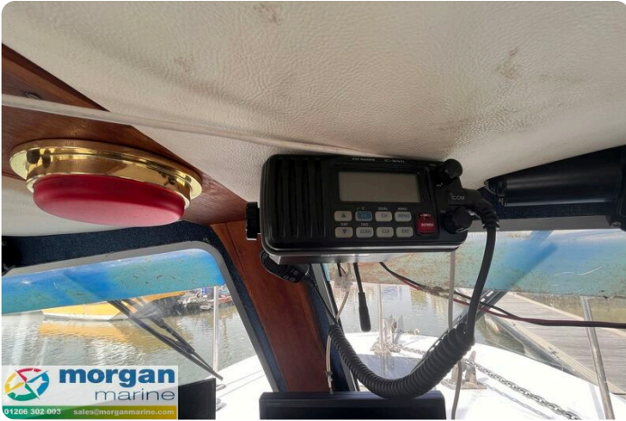
Procharter 36 GRP charter fishing boat - VHF radio