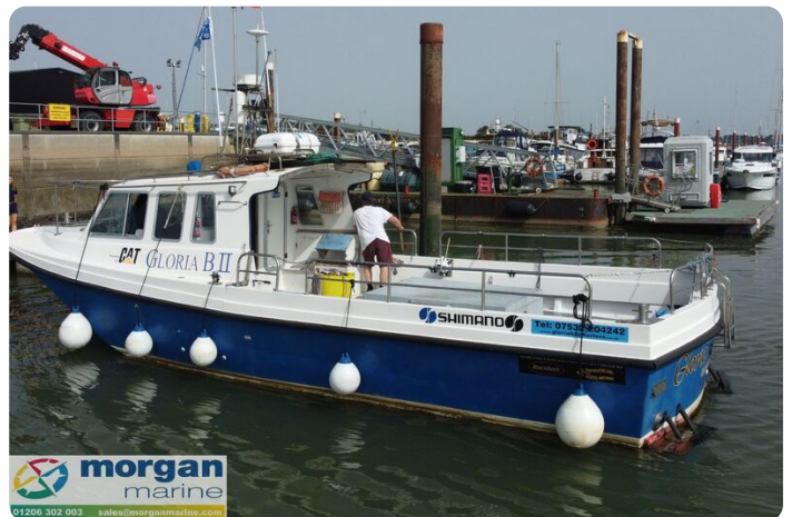
Procharter 36 GRP charter fishing boat - in the cockpit