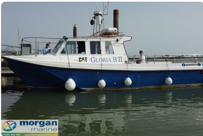
Procharter 36 GRP charter fishing boat - port side view of wheelhouse