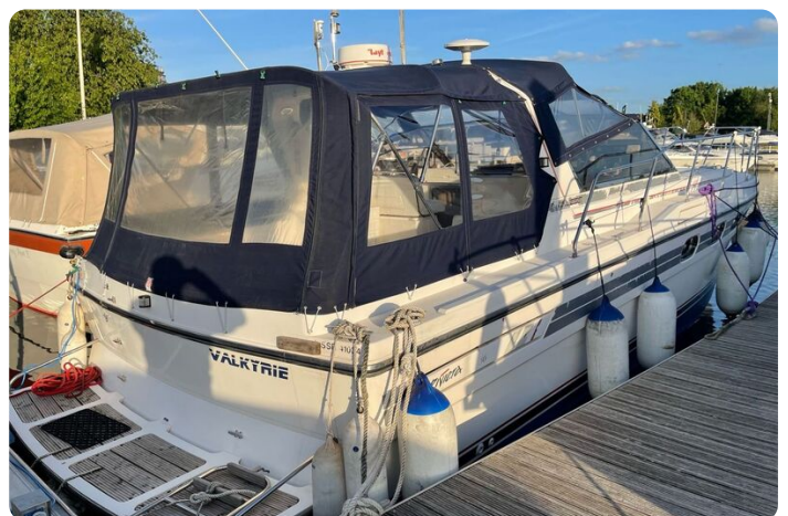
Princess 36 Riviera-back