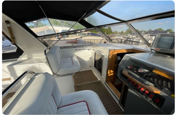
Princess 36 Riviera-co-pilot-seating