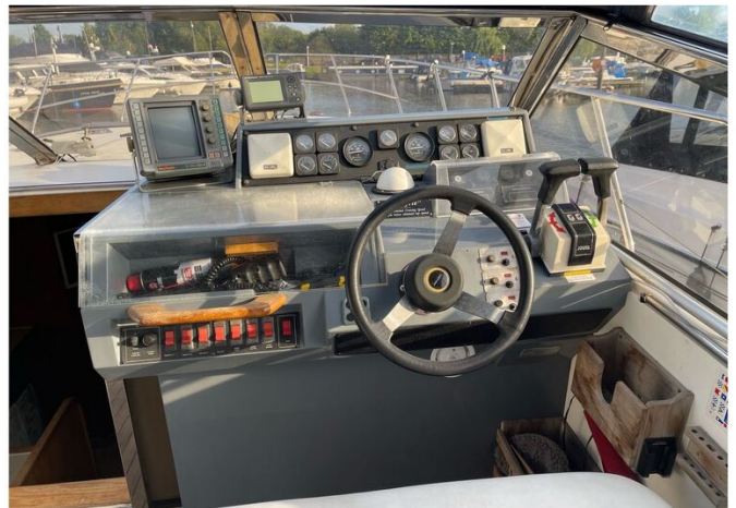
Princess 36 Riviera-dash