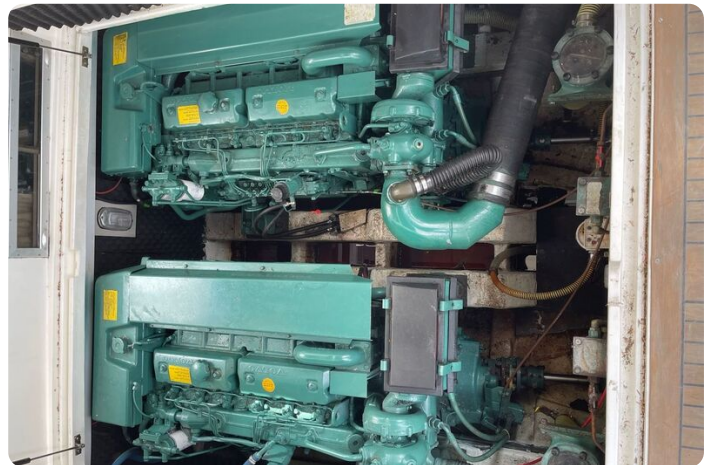
Princess 36 Riviera-engine