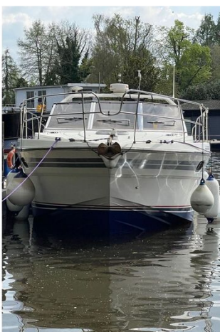
Princess 36 Riviera-front