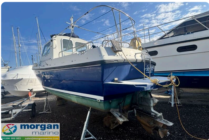
Orkney Day Angler 24 - bracket