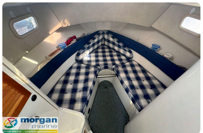
Orkney Day Angler 24 - cabin