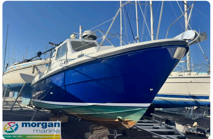
Orkney Day Angler 24 - Main