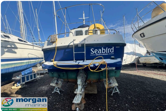
Orkney Day Angler 24 - prop