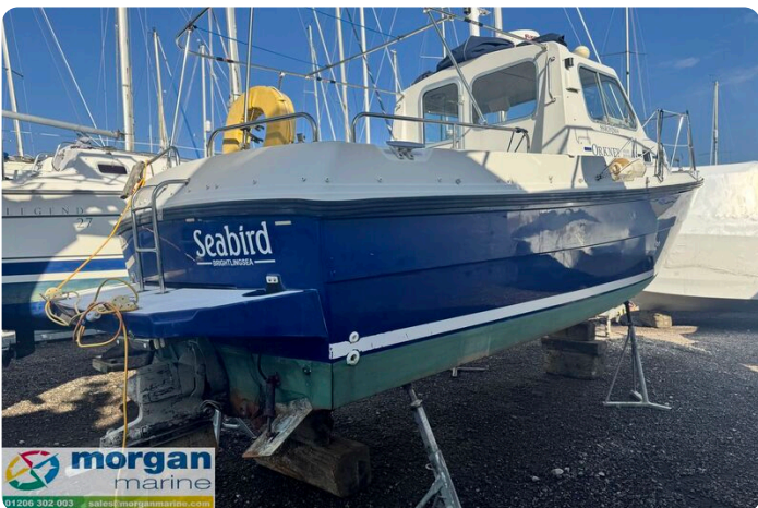
Orkney Day Angler 24 - trim tabs