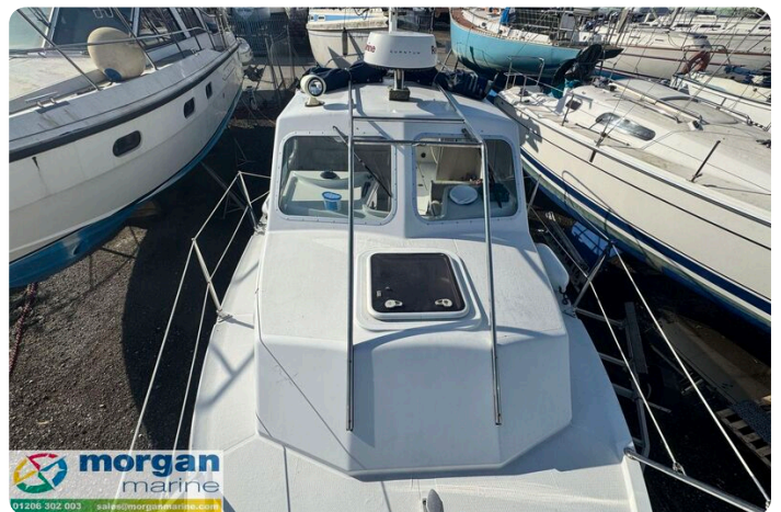
Orkney Day Angler 24 - hatch