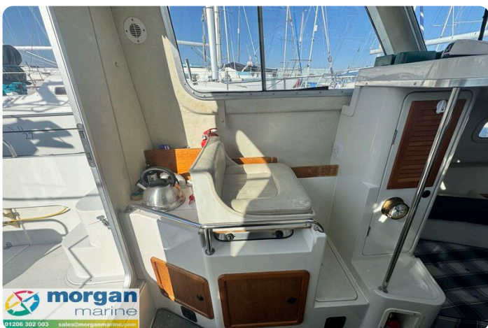
Orkney Day Angler 24 - co pilot seat