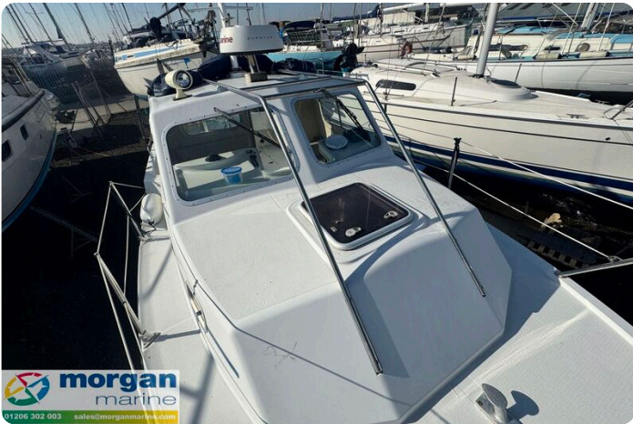
Orkney Day Angler 24 - hatch 02