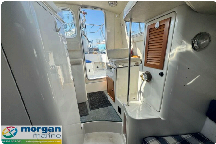
Orkney Day Angler 24 - saloon seating