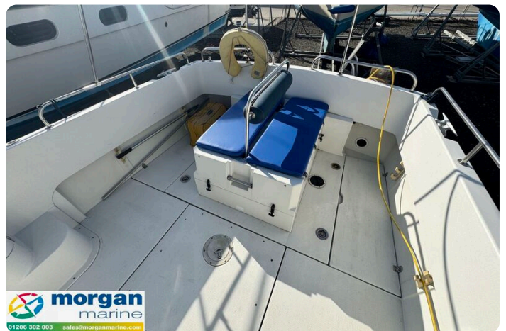
Orkney Day Angler 24 - seating