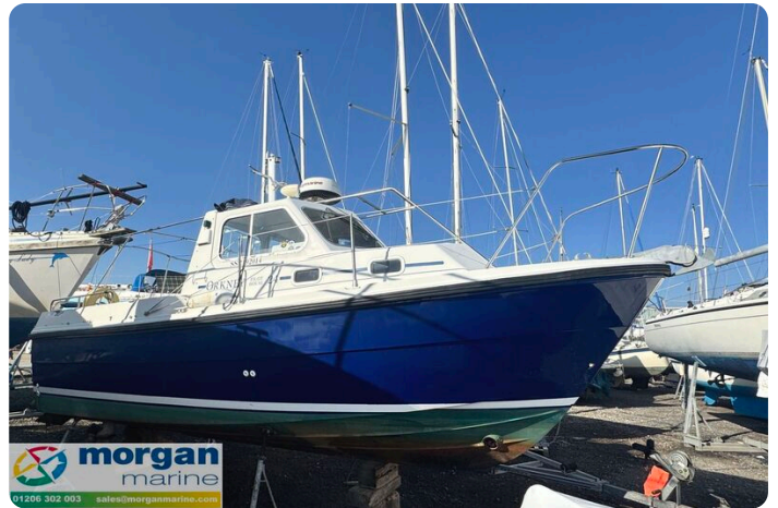
Orkney Day Angler 24 - blue