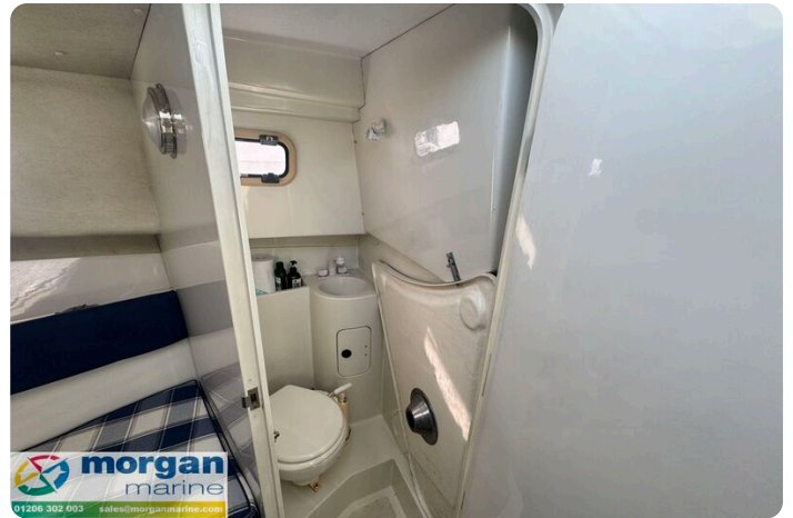
Orkney Day Angler 24 - toilet