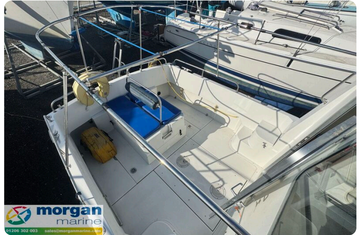
Orkney Day Angler 24 - seating cockpit