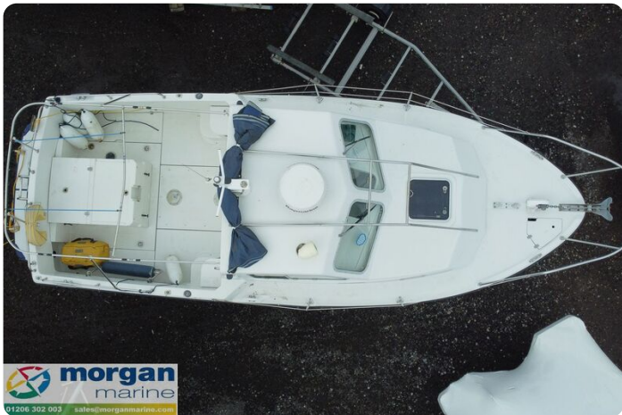
Orkney Day Angler 24 - roof