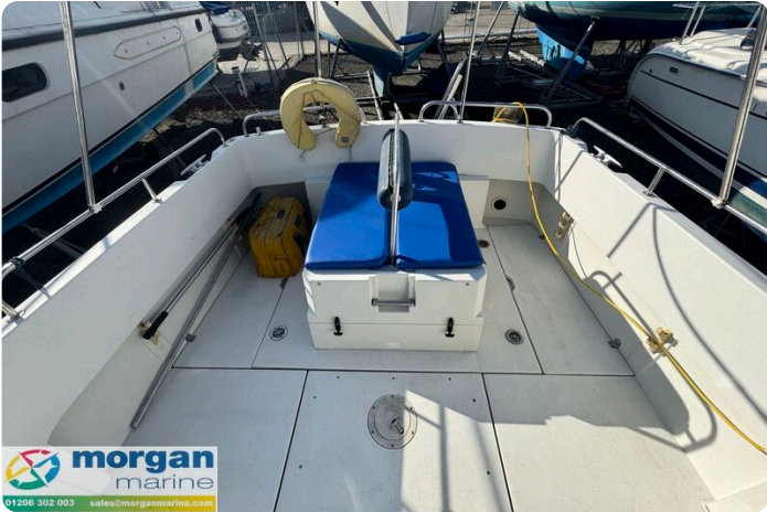
Orkney Day Angler 24 - deck