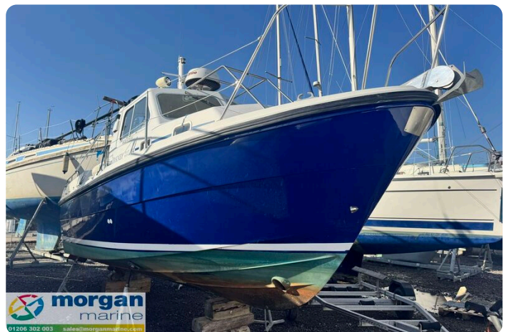
Orkney Day Angler 24 - side