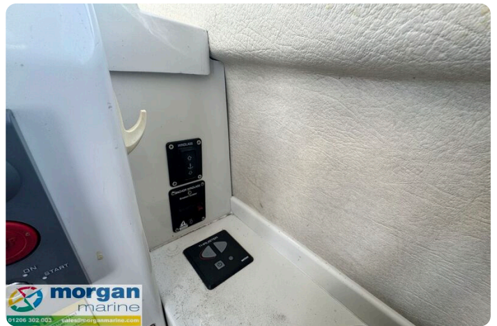
Orkney Day Angler 24 - bow thruster controls