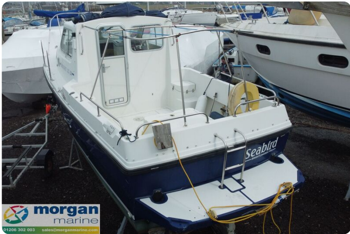
Orkney Day Angler 24 - ladder