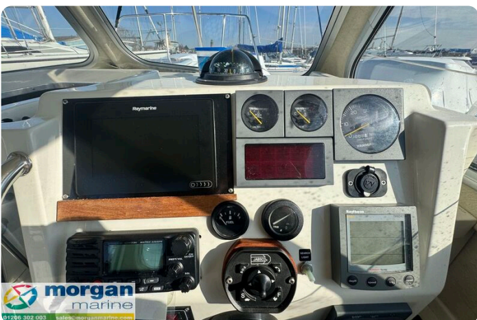
Orkney Day Angler 24 - dash