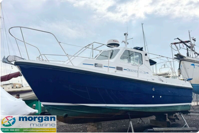
Orkney Day Angler 24 - Main