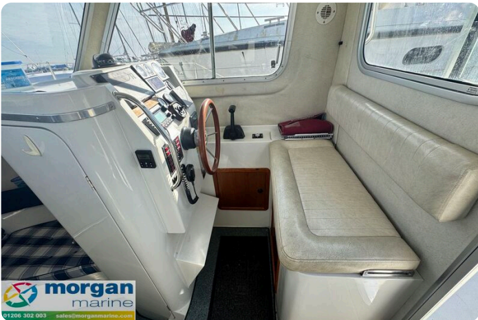
Orkney Day Angler 24 - pilot seat