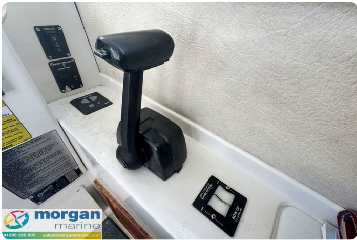
Orkney Day Angler 24 - throttle