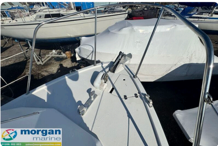
Orkney Day Angler 24 - anchor