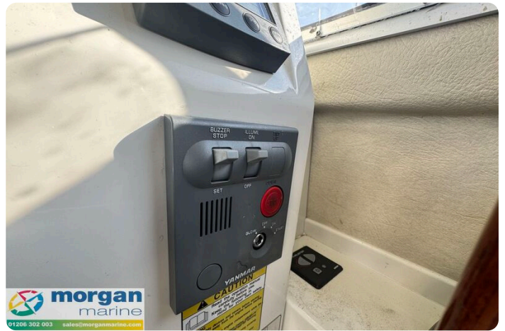
Orkney Day Angler 24 - controls