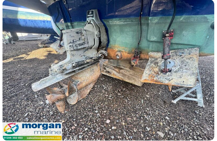
Orkney Day Angler 24 - engine prop