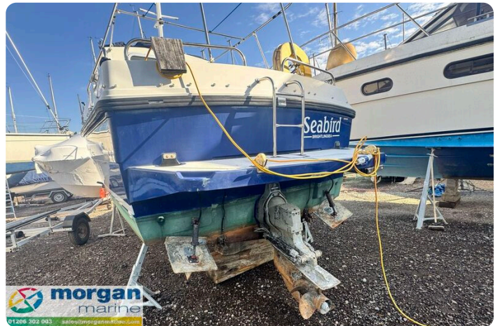
Orkney Day Angler 24 - ladder