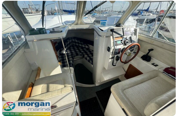
Orkney Day Angler 24 - saloon