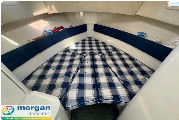
Orkney Day Angler 24 - in fill cushion