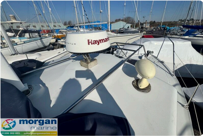
Orkney Day Angler 24 - radar