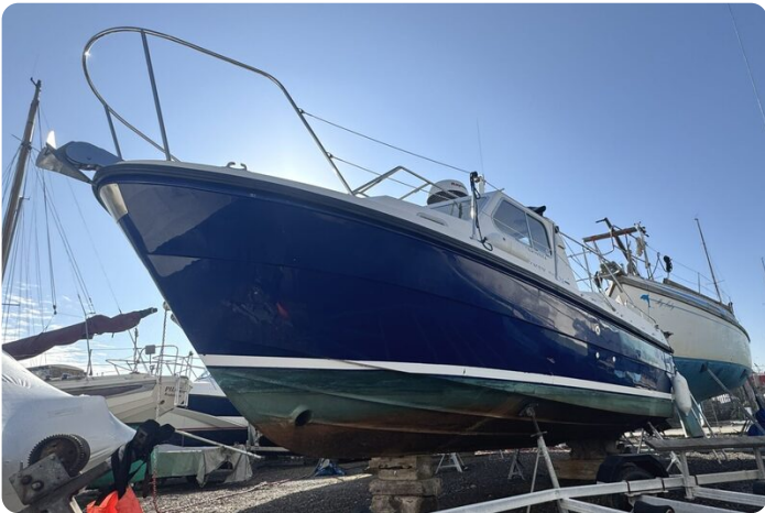
Orkney Day Angler 24 - bow