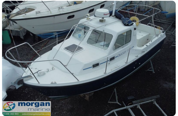
Orkney Day Angler 24 - top