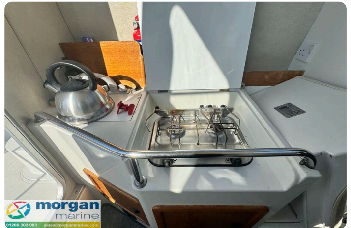
Orkney Day Angler 24 - gas stove