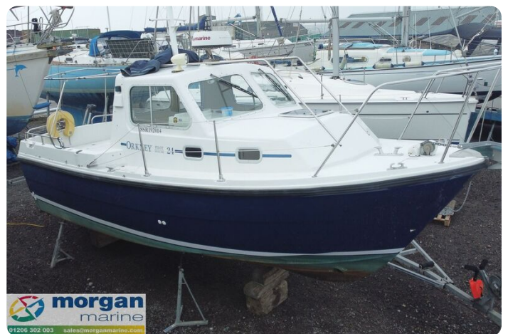
Orkney Day Angler 24 - railings