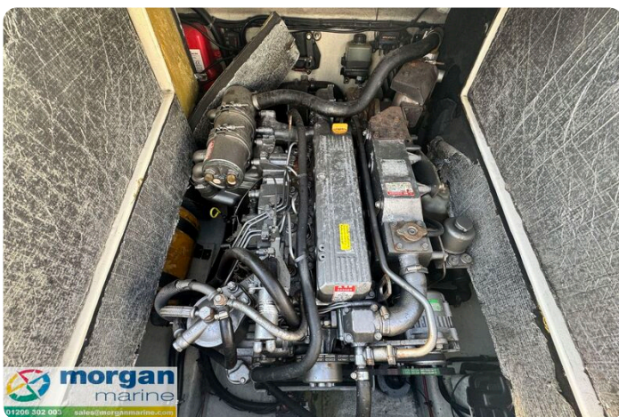
Orkney Day Angler 24 - engine