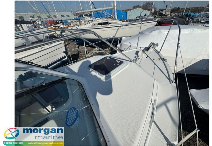
Orkney Day Angler 24 - bow