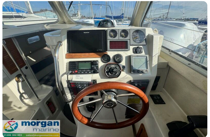
Orkney Day Angler 24 - wheel