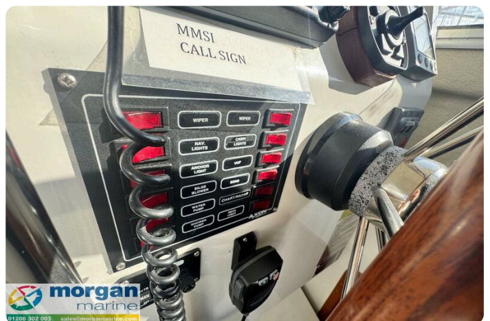
Orkney Day Angler 24 - controls