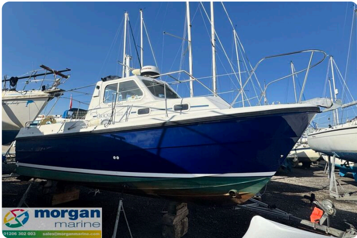
Orkney Day Angler 24 - side