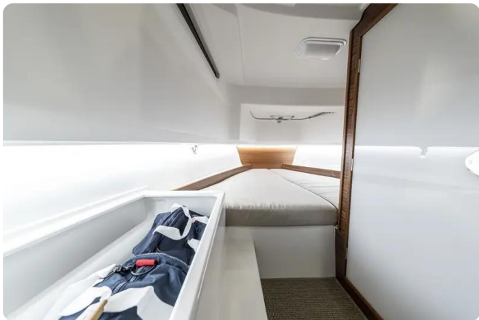
Nimbus Tender 8 (T8) Interior 1