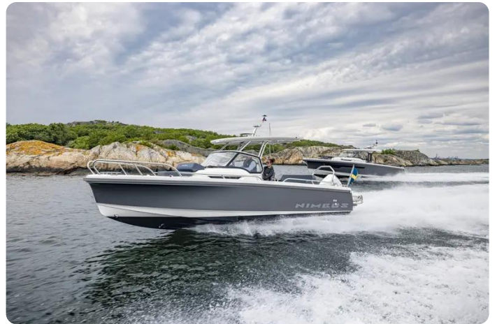
Nimbus Tender 8 (T8) Exterior 9