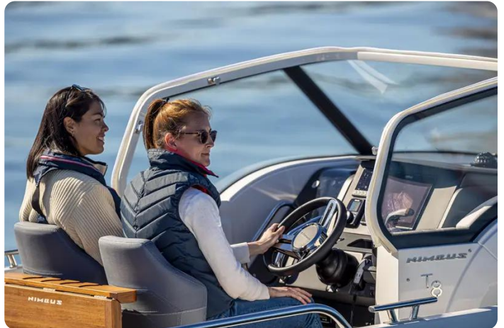
Nimbus Tender 8 (T8) Dash 4