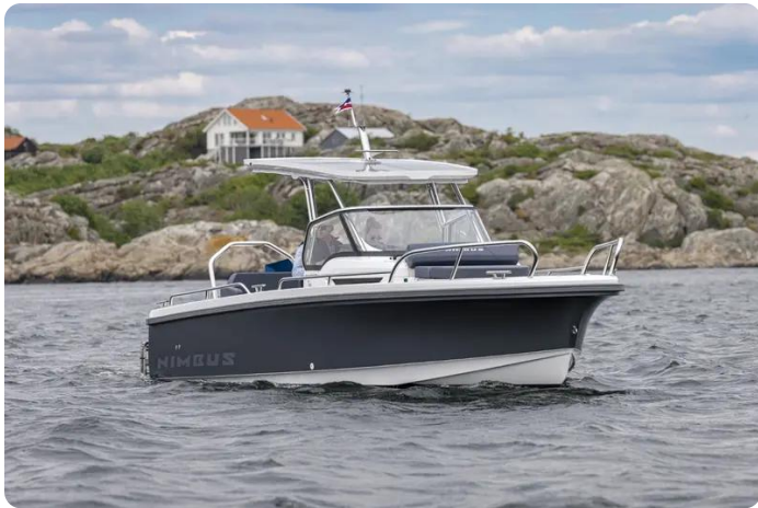
Nimbus Tender 8 (T8) Exterior 7