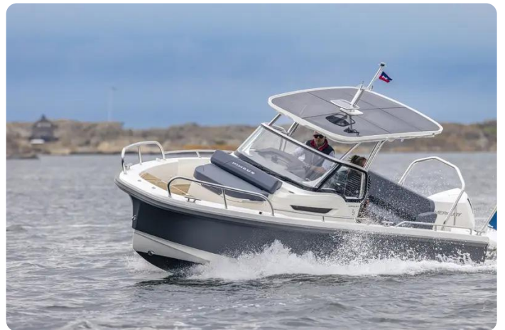
Nimbus Tender 8 (T8) Exterior 4