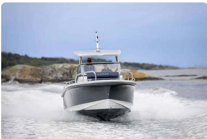
Nimbus Tender 8 (T8) Exterior 3