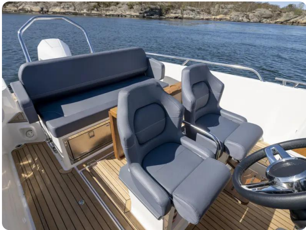
Nimbus Tender 8 (T8) Seating 2