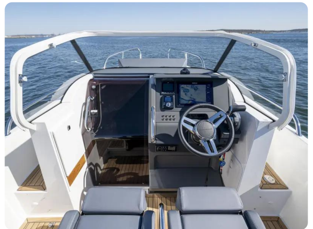
Nimbus Tender 8 (T8) Dash 1