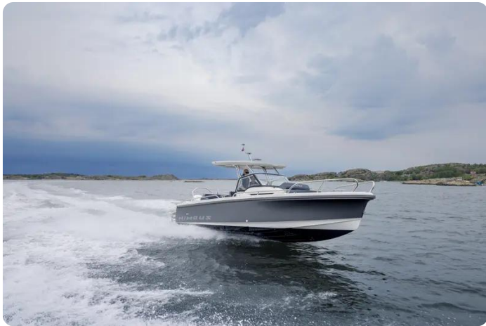
Nimbus Tender 8 (T8) Exterior 1