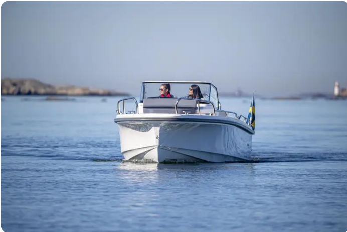
Nimbus Tender 8 (T8) Exterior 10