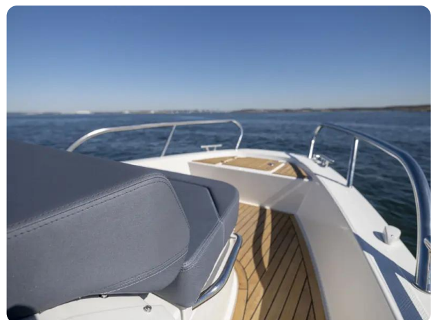
Nimbus Tender 8 (T8) Deck 1