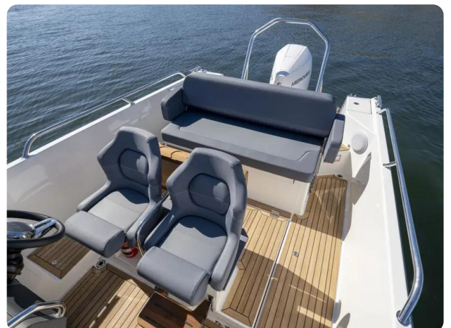
Nimbus Tender 8 (T8) Seating 3