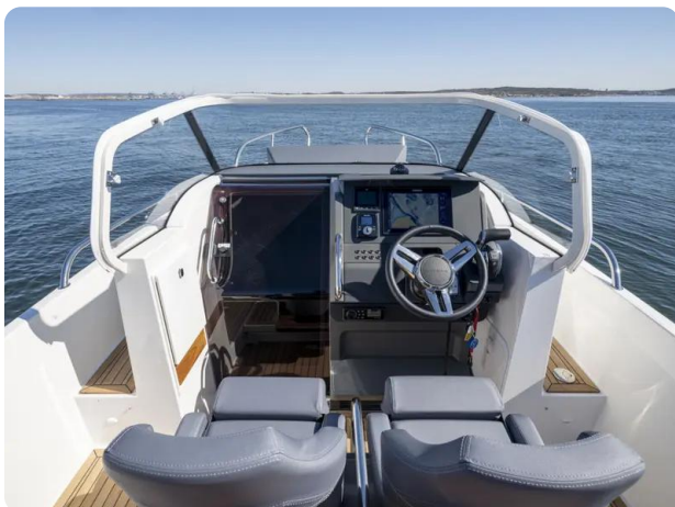
Nimbus Tender 8 (T8) Dash 3