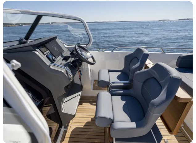
Nimbus Tender 8 (T8) Dash 2