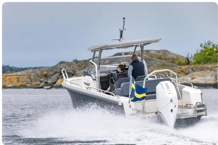
Nimbus Tender 8 (T8) Exterior 8