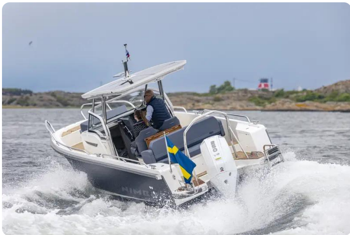
Nimbus Tender 8 (T8) Exterior 5