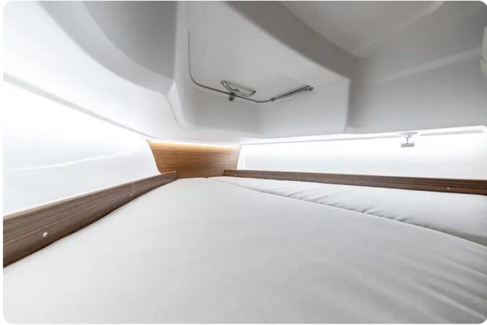
Nimbus Tender 8 (T8) Interior 3