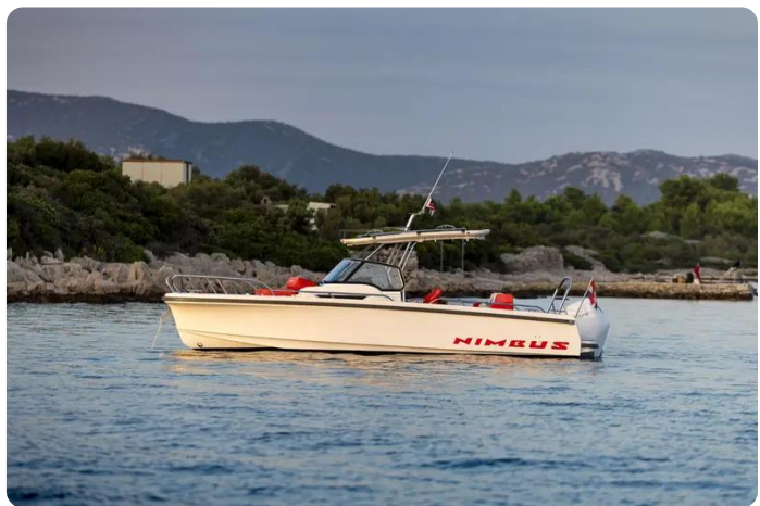
Nimbus Tender 8 (T8) Exterior 11