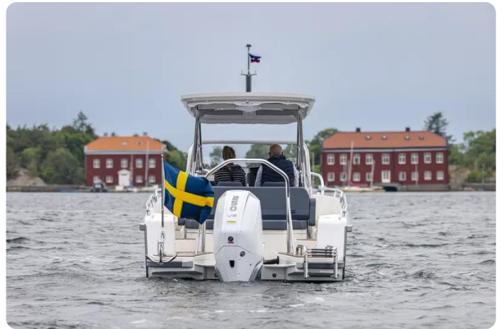
Nimbus Tender 8 (T8) Exterior 6