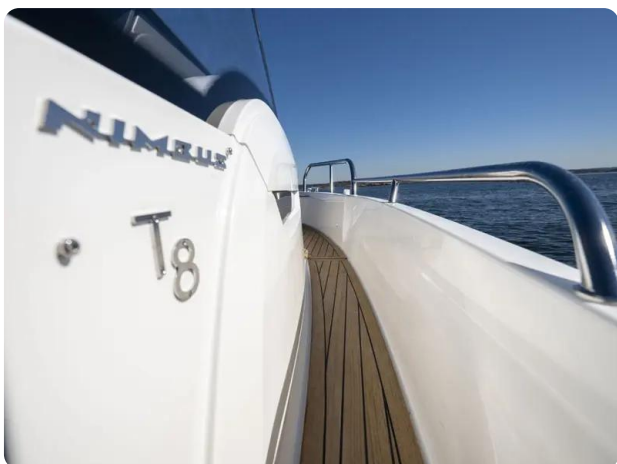
Nimbus Tender 8 (T8) Deck 2