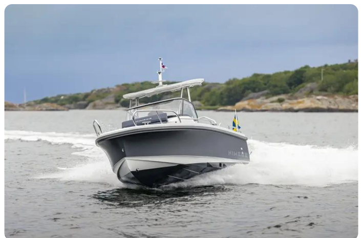
Nimbus Tender 8 (T8) Exterior 2