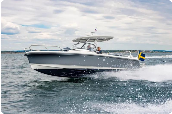
Nimbus Tender 8 Featured