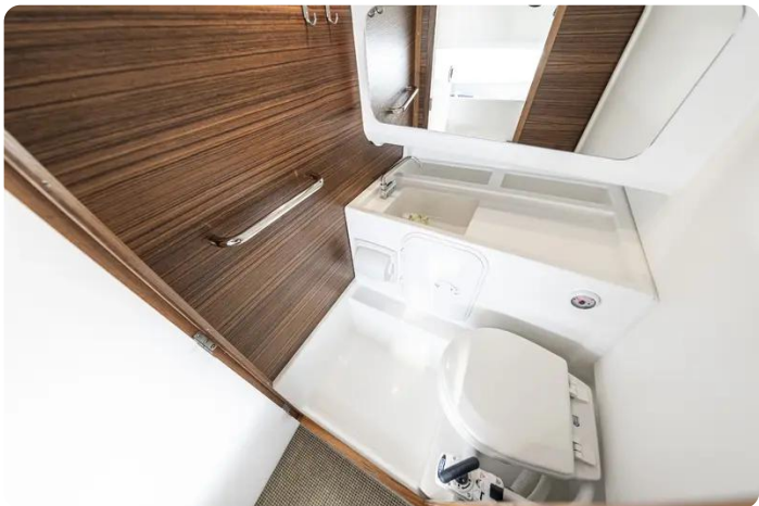
Nimbus Tender 8 (T8) Interior 2