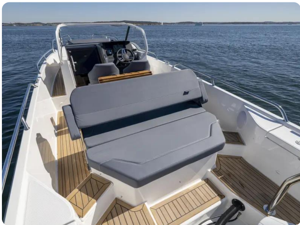
Nimbus Tender 8 (T8) Seating 1