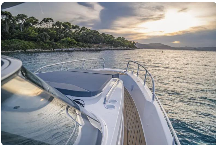
Nimbus Tender 11 (T11) Deck 2