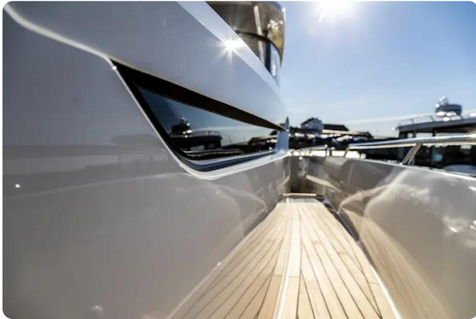
Nimbus Tender 11 (T11) Deck 3