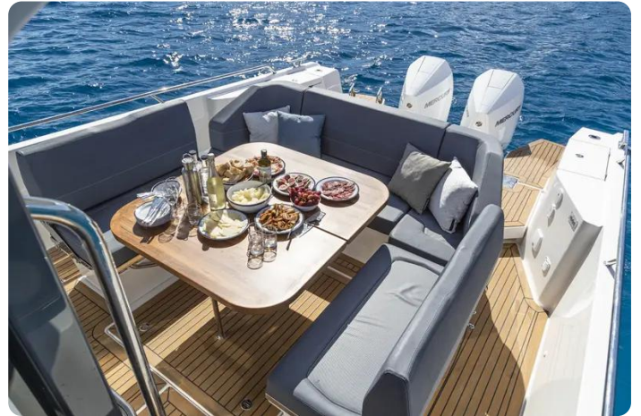
Nimbus Tender 11 (T11) Deck 5