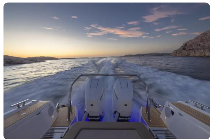
Nimbus Tender 11 (T11) Outboard