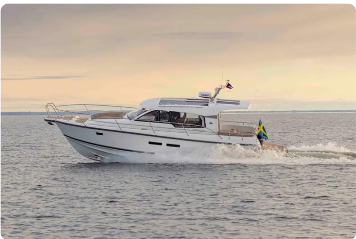
Nimbus 365 Coupe Featured