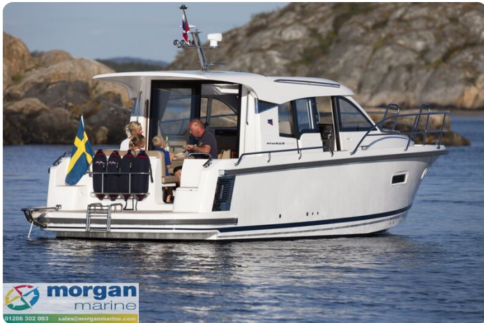
Nimbus 305 Coupe Exterior 12