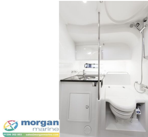
Nimbus 305 Coupe Head 2