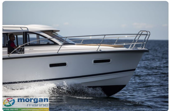
Nimbus 305 Coupe Exterior 3