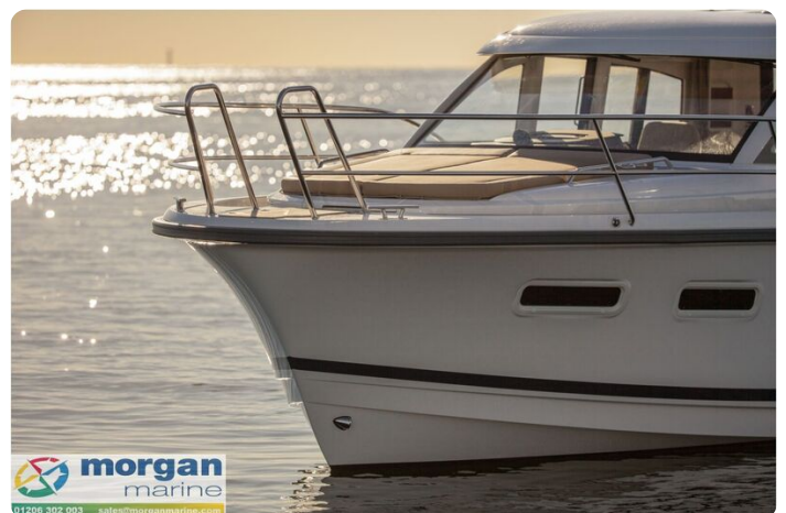
Nimbus 305 Coupe Exterior 7