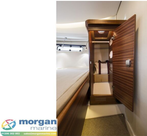
Nimbus 305 Coupe Cabin 6