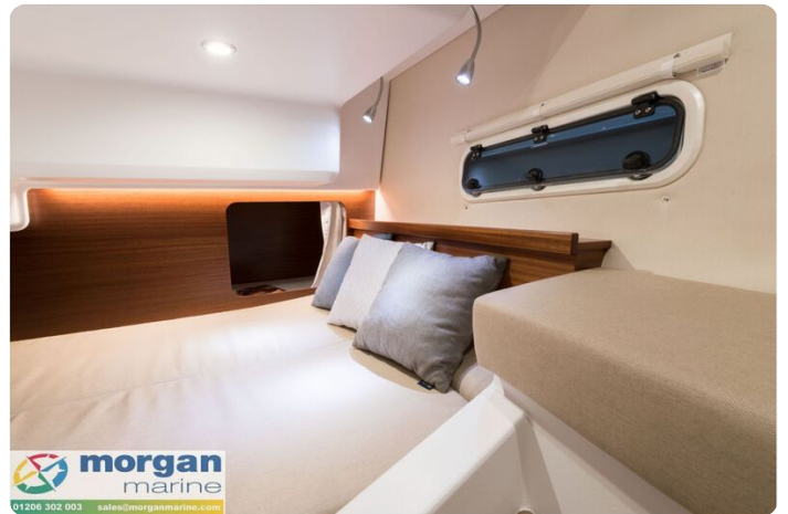
Nimbus 305 Coupe Cabin 4