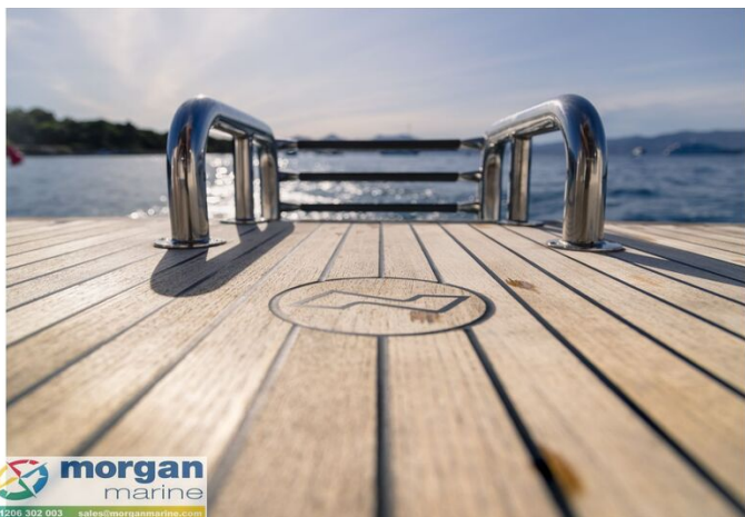
Nimbus 305 Coupe Exterior 21