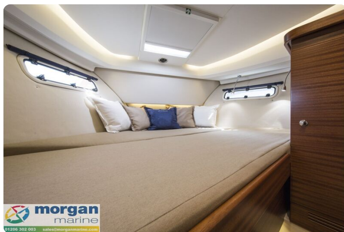
Nimbus 305 Coupe Cabin 3