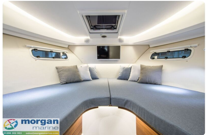
Nimbus 305 Coupe Cabin 1