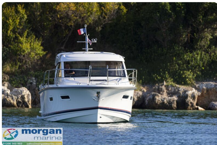
Nimbus 305 Coupe Exterior 17