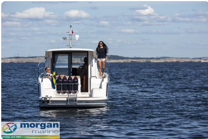
Nimbus 305 Coupe Exterior 14