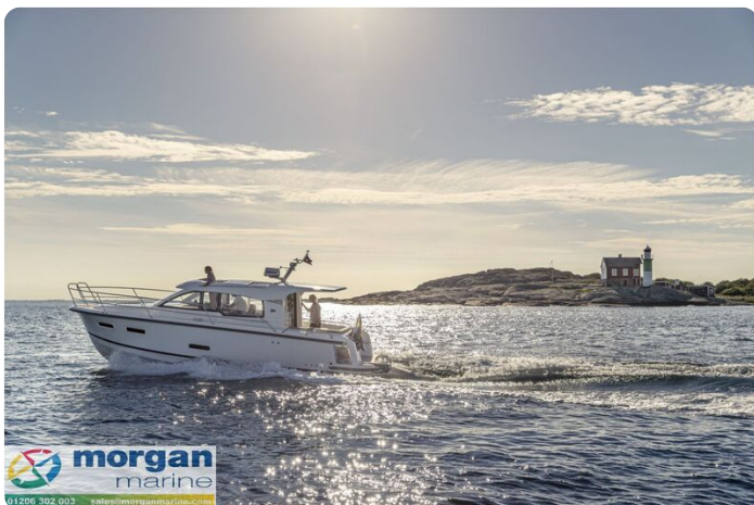
Nimbus 305 Coupe Exterior 2