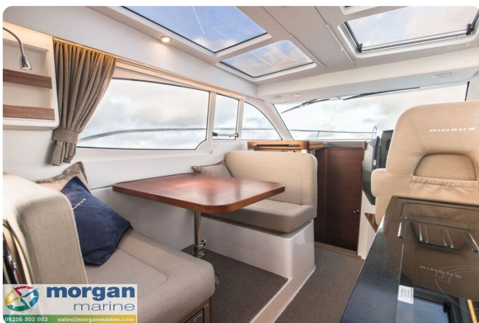
Nimbus 305 Coupe Interior 1