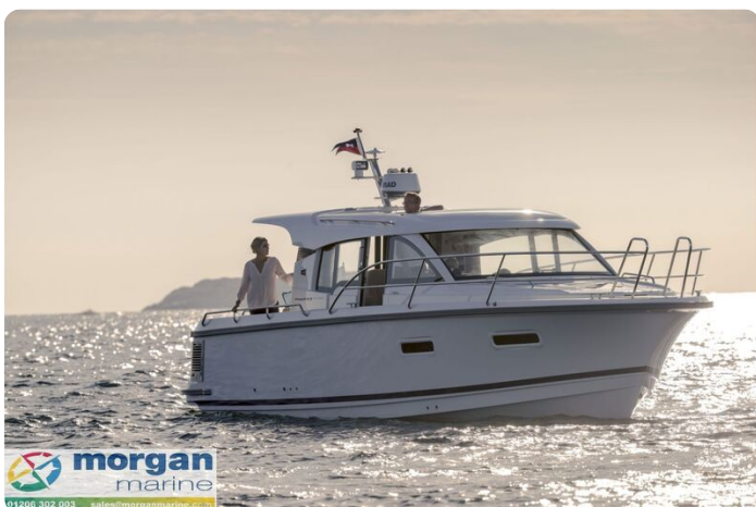
Nimbus 305 Coupe Exterior 1