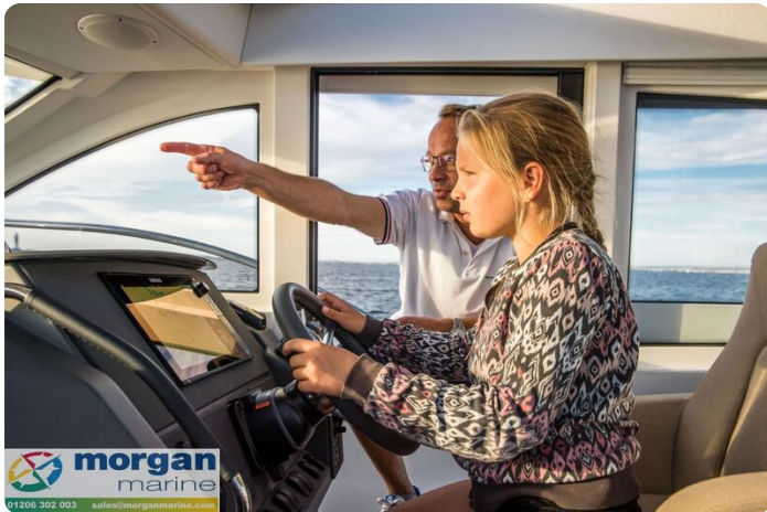
Nimbus 305 Coupe Interior 3