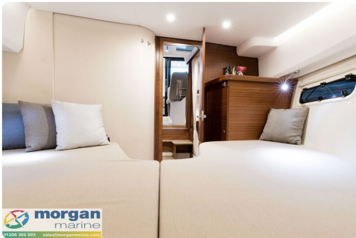
Nimbus 305 Coupe Cabin 2