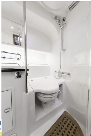
Nimbus 305 Coupe Head 1