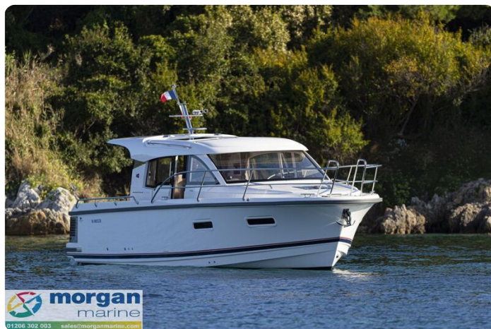
Nimbus 305 Coupe Exterior 18