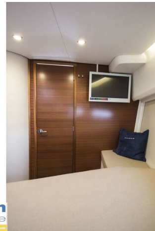
Nimbus 305 Coupe Cabin 5