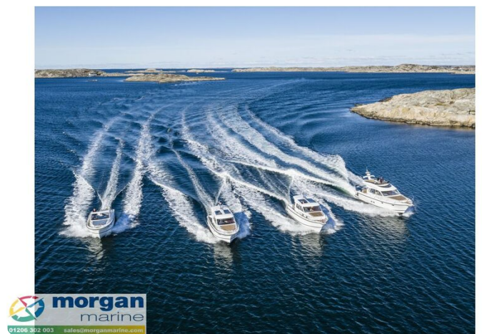
Nimbus 305 Coupe Exterior 22