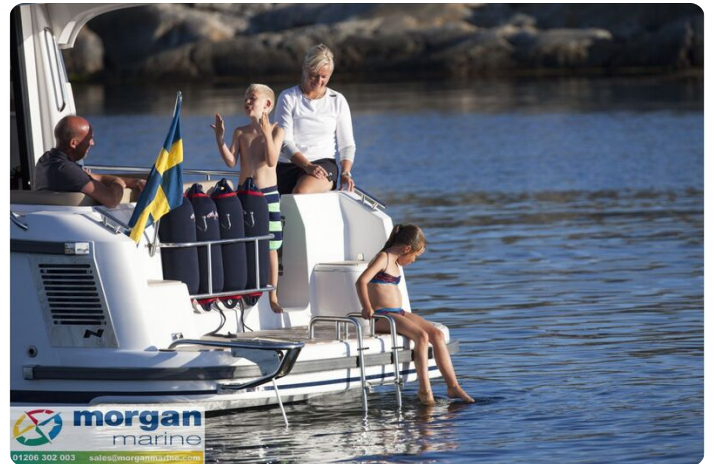
Nimbus 305 Coupe Exterior 13