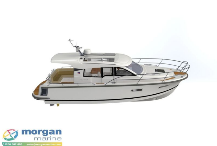
Nimbus 305 Coupe Side