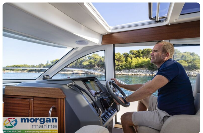
Nimbus 305 Coupe Interior 2