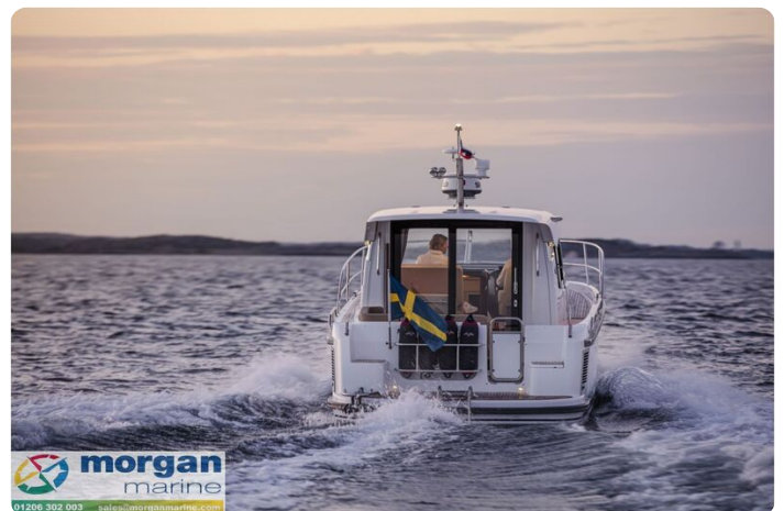
Nimbus 305 Coupe Exterior 4