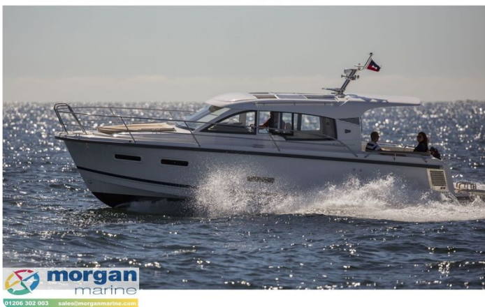
Nimbus 305 Coupe Exterior 15