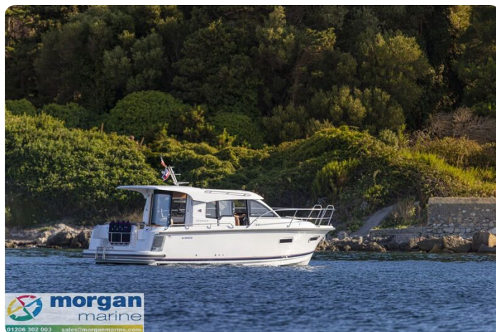
Nimbus 305 Coupe Exterior 16