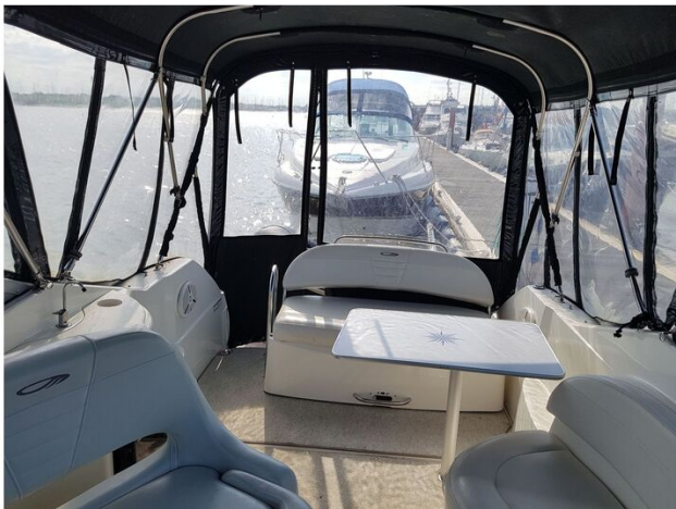
Maxum 2600 SE - looking out of cockpit