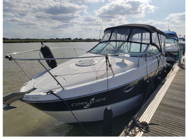
Maxum 2600 SE - port side and bow on pontoon