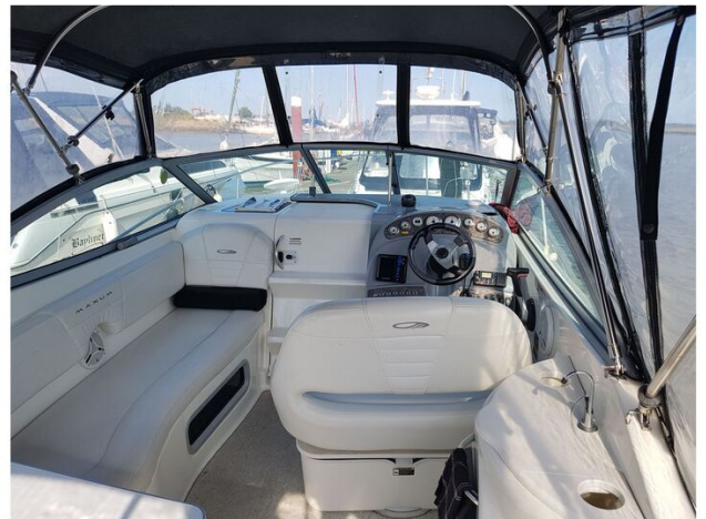
Maxum 2600 SE - cockpit under canopy