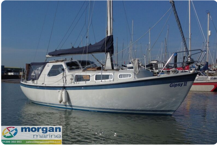
LM 27 Motor Sailer - Main