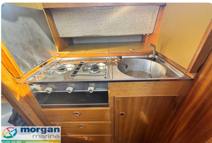
LM 27 Motor Sailer - galley