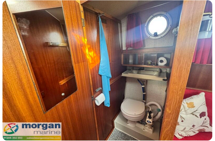
LM 27 Motor Sailer - toilet