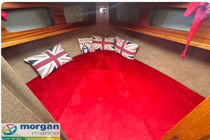
LM 27 Motor Sailer - forward berth