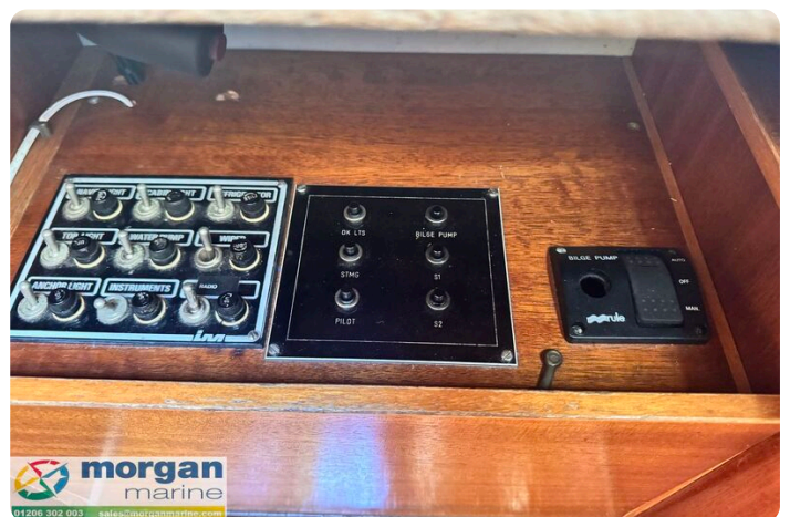
LM 27 Motor Sailer - switch panel