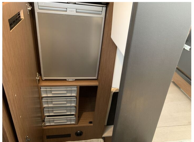
Jeanneau NC 37 twin diesel cruiser - fridge and storage