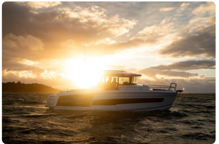
Jeanneau Merry Fisher 895 Sport - in beautiful sunset