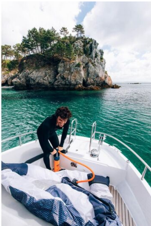
Jeanneau Merry Fisher 895 Sport - cushioned seating in bow