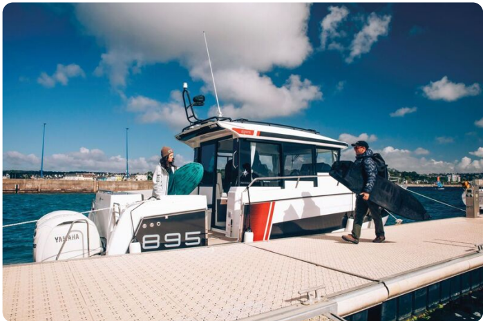
Jeanneau Merry Fisher 895 Sport - easy access to pontoons through cockpit side gate