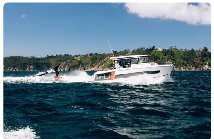
Jeanneau Merry Fisher 895 Sport - moving through the water