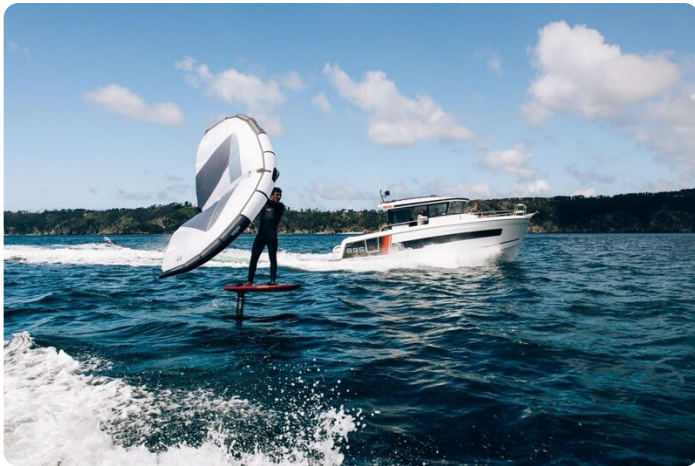
Jeanneau Merry Fisher 895 Sport - fun on the water