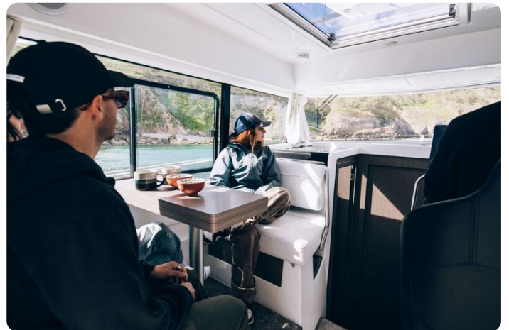
Jeanneau Merry Fisher 895 Sport - port side wheelhouse saloon