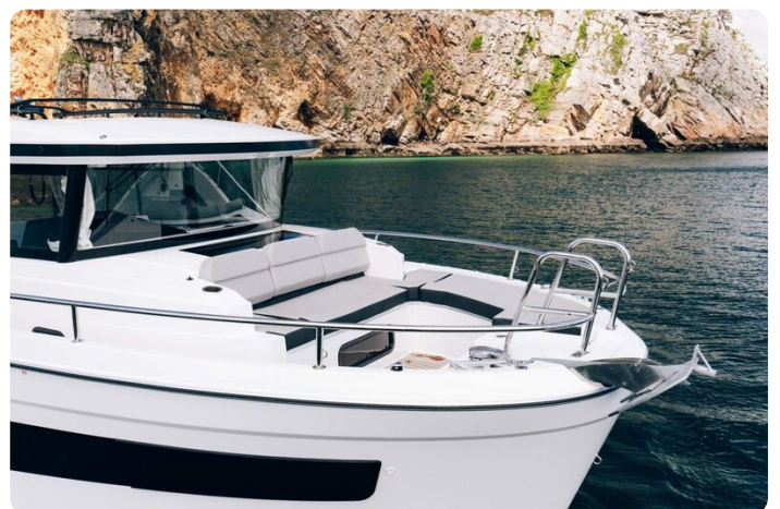
Jeanneau Merry Fisher 895 Sport - bow and pulpits rails