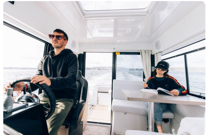
Jeanneau Merry Fisher 895 Sport - view from cabin steps through wheelhouse to aft