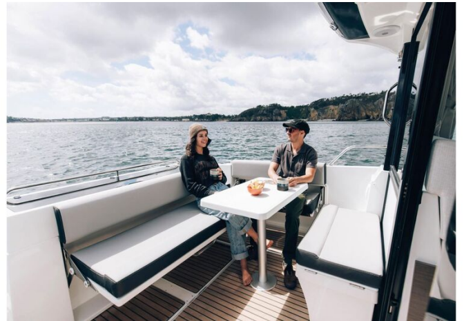
Jeanneau Merry Fisher 895 Sport - U shape cockpit saloon