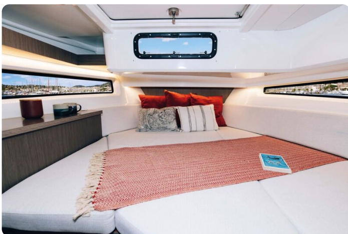
Jeanneau Merry Fisher 895 Sport - forward cabin