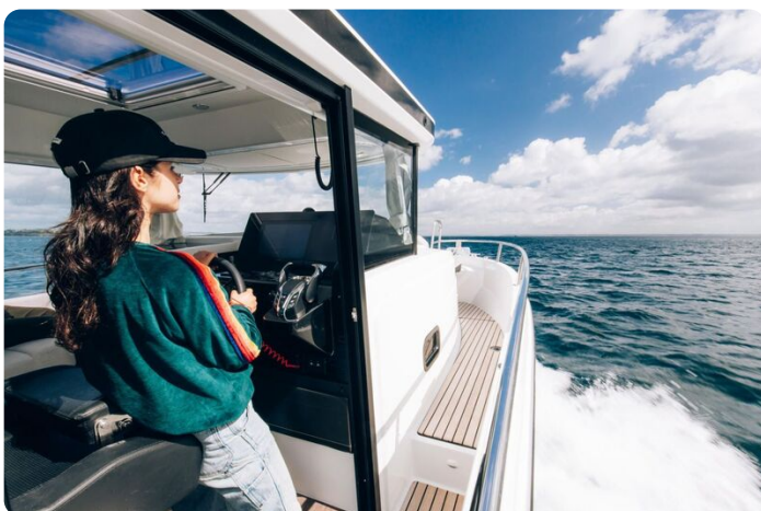
Jeanneau Merry Fisher 895 Sport - starboard side helm door and side deck