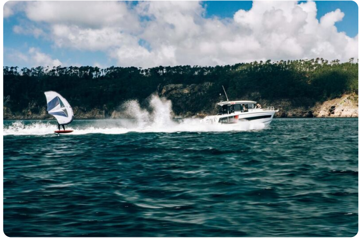
Jeanneau Merry Fisher 895 Sport - moving through the water