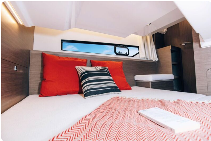
Jeanneau Merry Fisher 895 Sport - aft cabin