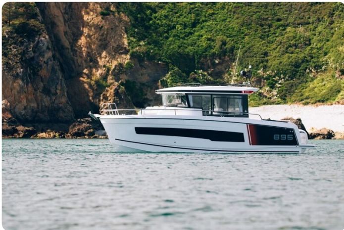
Jeanneau Merry Fisher 895 Sport - port side view on the water