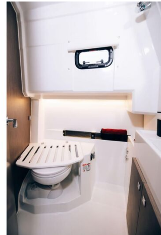
Jeanneau Merry Fisher 895 Sport - toilet and shower compartment