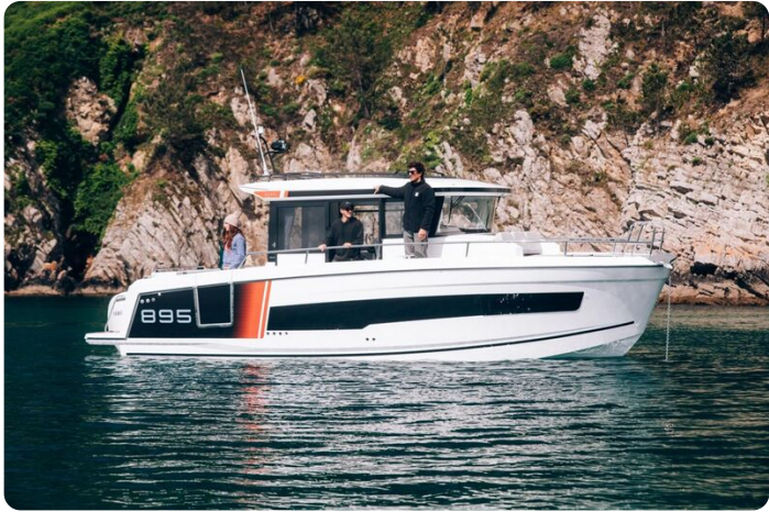
Jeanneau Merry Fisher 895 Sport