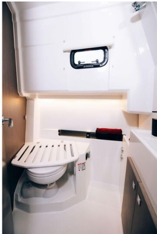
Jeanneau Merry Fisher 895 Sport - Series 2 - toilet and shower compartment