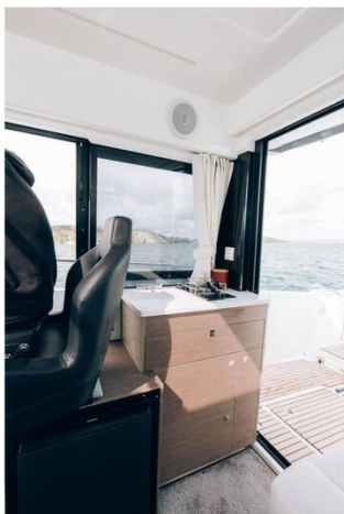
Jeanneau Merry Fisher 895 Sport - Series 2 - wheelhouse galley