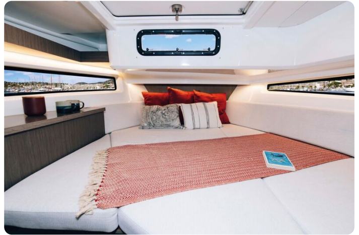
Jeanneau Merry Fisher 895 Sport - Series 2 - forward cabin