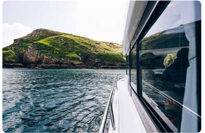
Jeanneau Merry Fisher 895 Sport - Series 2 - port side