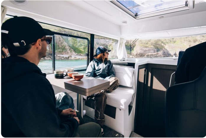
Jeanneau Merry Fisher 895 Sport - Series 2 - co-pilot seat converts to seating at table