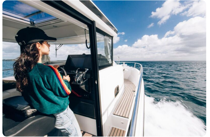
Jeanneau Merry Fisher 895 Sport - Series 2 - helm side door and wide side deck