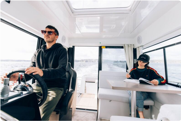
Jeanneau Merry Fisher 895 Sport - Series 2 - helm position and saloon