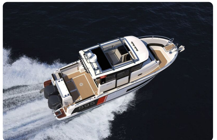
Jeanneau Merry Fisher 895 Sport - overhead view