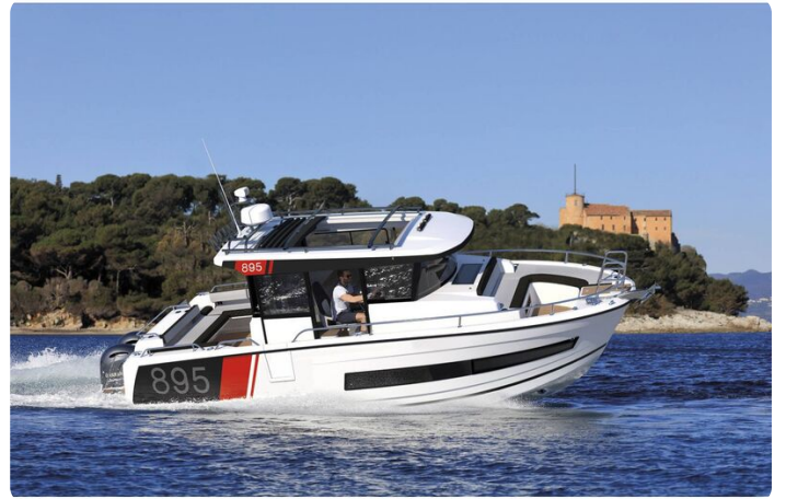
Jeanneau Merry Fisher 895 Sport - planing on the water