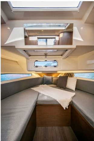
Jeanneau Merry Fisher 895 Sport - entrance to forward cabin