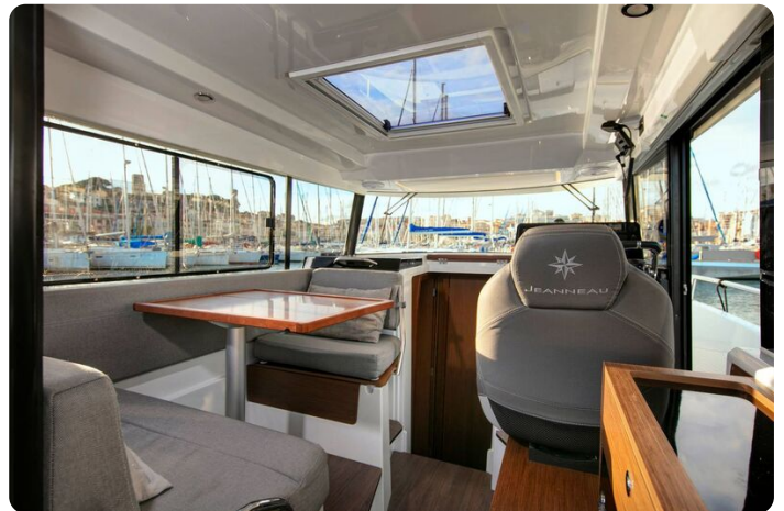
Jeanneau Merry Fisher 895 Sport - wheelhouse with port side seating + table and starboard side helm position