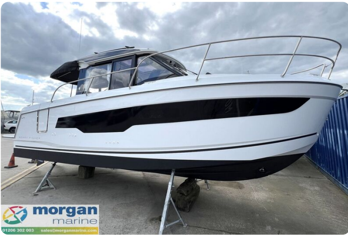
Jeanneau Merry Fisher 895 Series 2 - starboard side