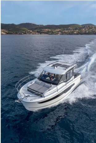
Jeanneau Merry Fisher 895 - on the water