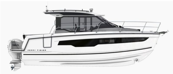
Jeanneau Merry Fisher 895 - diagram of starboard side