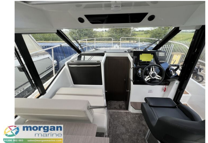
Jeanneau Merry Fisher 895 Series 2 - view from wheelhouse aft to cabin