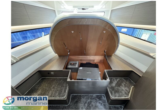
Jeanneau Merry Fisher 895 Series 2 - storage under berth