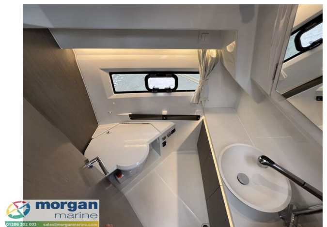
Jeanneau Merry Fisher 895 Series 2 - toilet and shower compartment