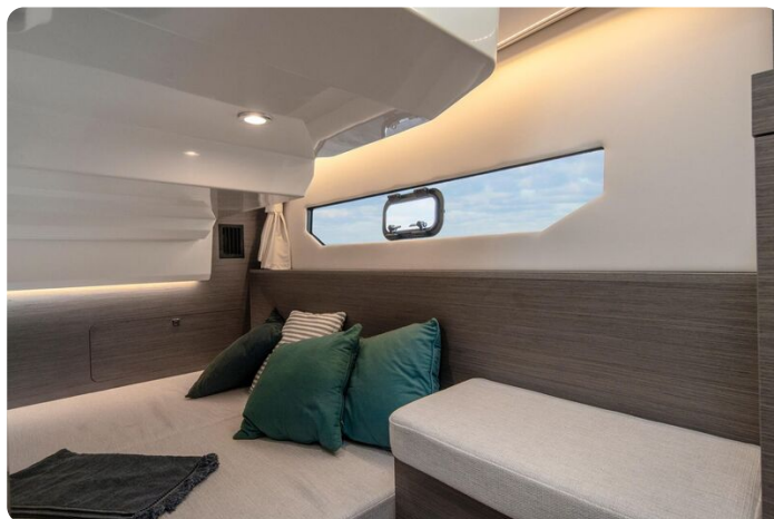
Jeanneau Merry Fisher 895 - aft cabin