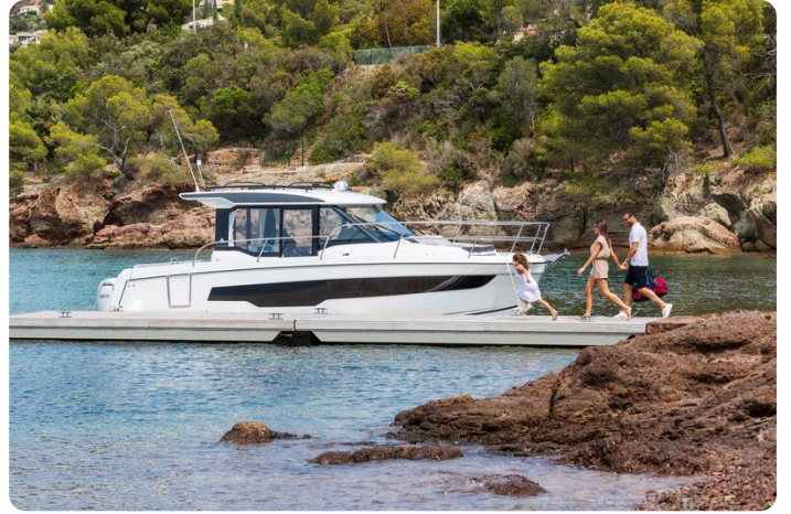
Jeanneau Merry Fisher 895 - walking along the pontoon