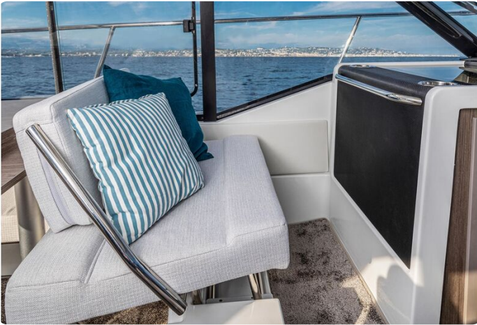
Jeanneau Merry Fisher 895 - co-pilot seat