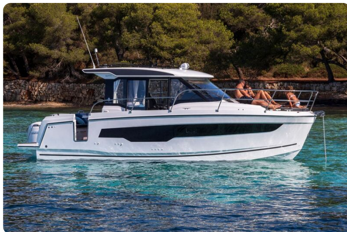
Jeanneau Merry Fisher 895 Series 2 - starboard side view on the water