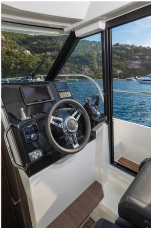
Jeanneau Merry Fisher 895 - helm position