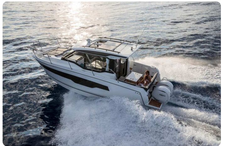
Jeanneau Merry Fisher 895 - port side