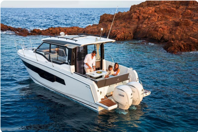
Jeanneau Merry Fisher 895 - view of aft cockpit from port side