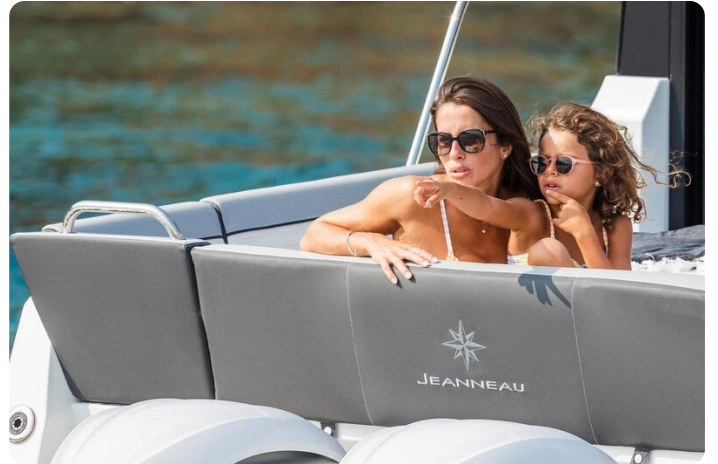
Jeanneau Merry Fisher 895 - people looking out over the aft cockpit bench seat