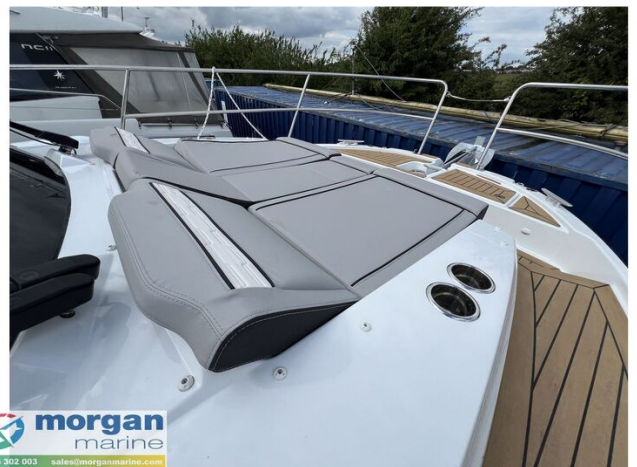
Jeanneau Merry Fisher 895 Series 2 - view from bow seating to pulpits rails