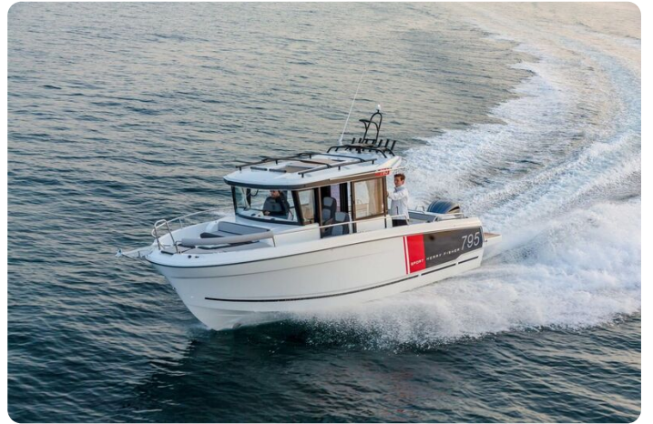
Jeanneau Merry Fisher 795 Sport - Series 2 - on the water