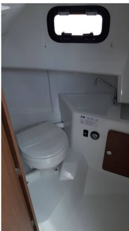
Jeanneau Merry Fisher 795 Sport - Series 2 - toilet compartment