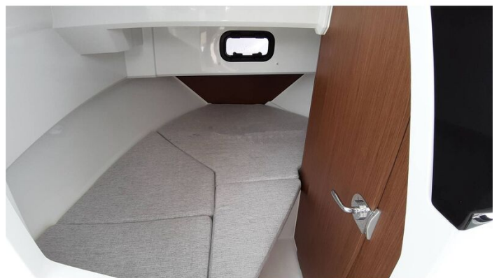
Jeanneau Merry Fisher 795 Sport - Series 2 - forward cuddy with cushions