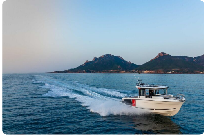
Jeanneau Merry Fisher 795 Sport - Series 2 - moving through the water