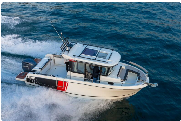
Jeanneau Merry Fisher 795 Sport - Series 2 - overhead view of starboard on the water