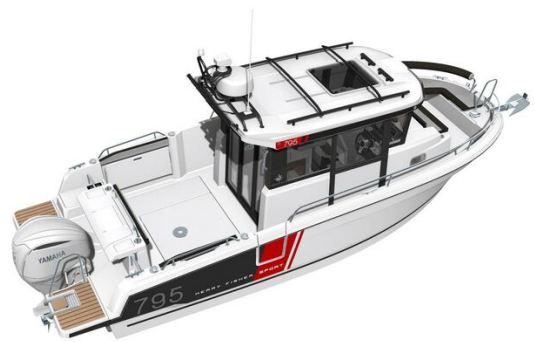
Jeanneau Merry Fisher 795 Sport - Series 2 - render of overhead view