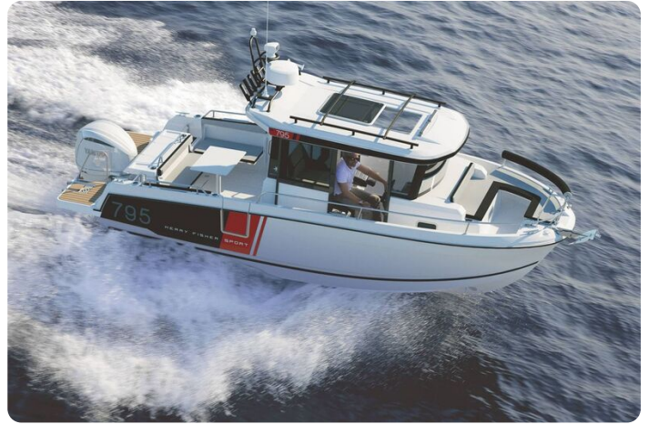
Jeanneau Merry Fisher 795 Sport - Series 2