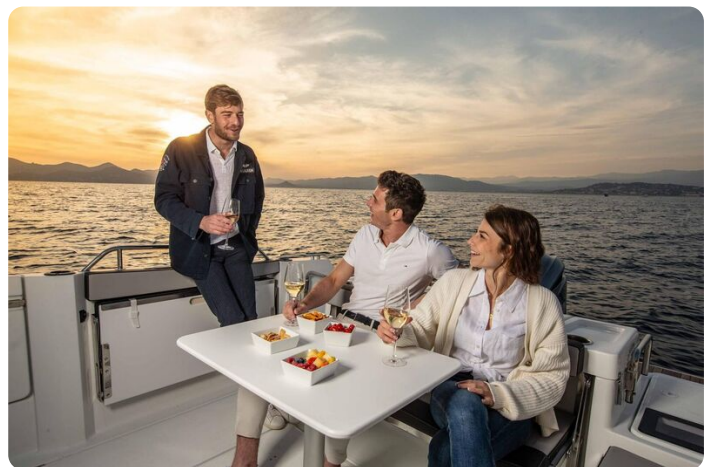
Jeanneau Merry Fisher 795 Sport - Series 2 - aft cockpit table and seating