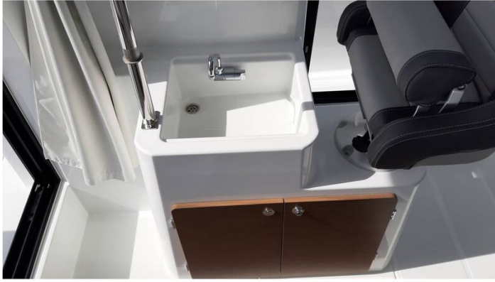
Jeanneau Merry Fisher 795 Sport - Series 2 - galley behind helm seat