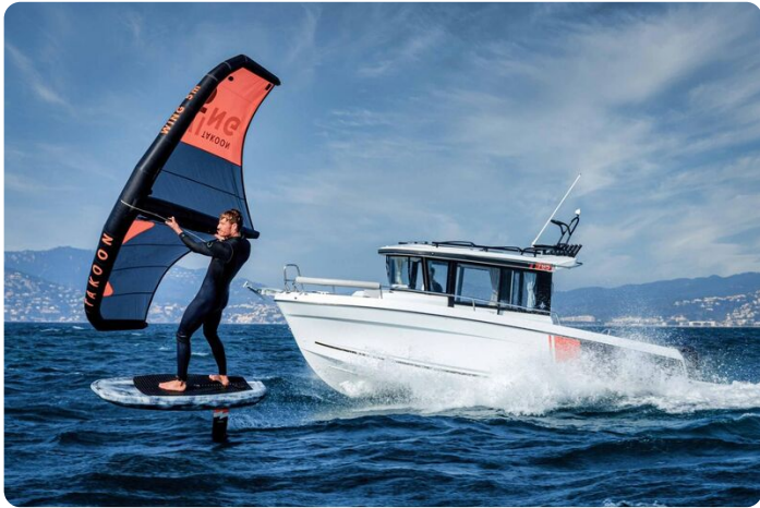
Jeanneau Merry Fisher 795 Sport - Series 2 - great for paddleboards and fun on the water