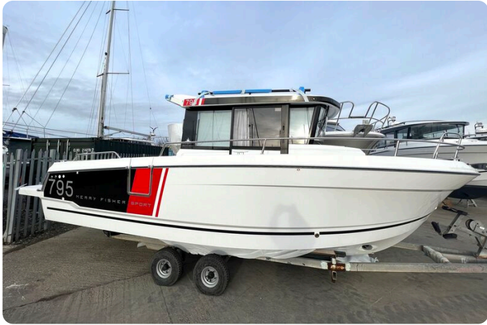
Jeanneau Merry Fisher 795 Sport - Series 2 - at Morgan Marine