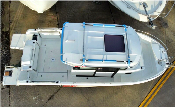
Jeanneau Merry Fisher 795 Sport - Series 2 - overhead view