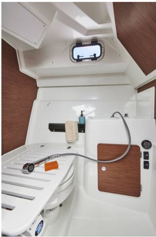
Jeanneau Merry Fisher 795 - toilet and shower compartment