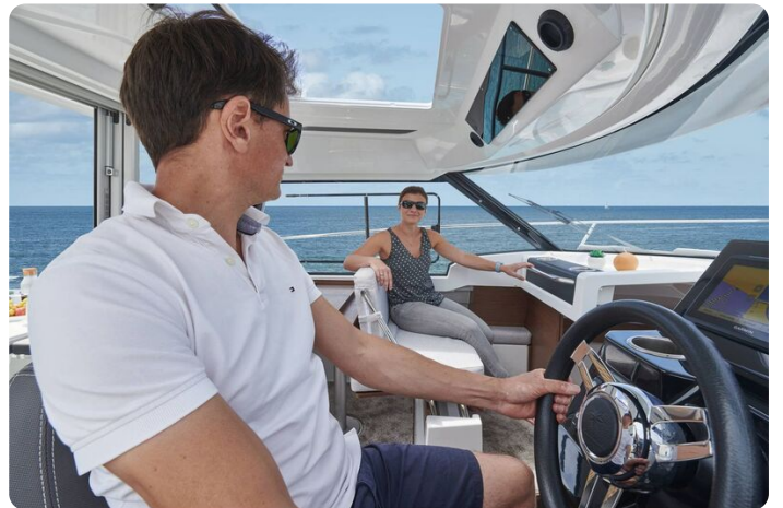
Jeanneau Merry Fisher 795 Series 2 - helm and co-pilot seats