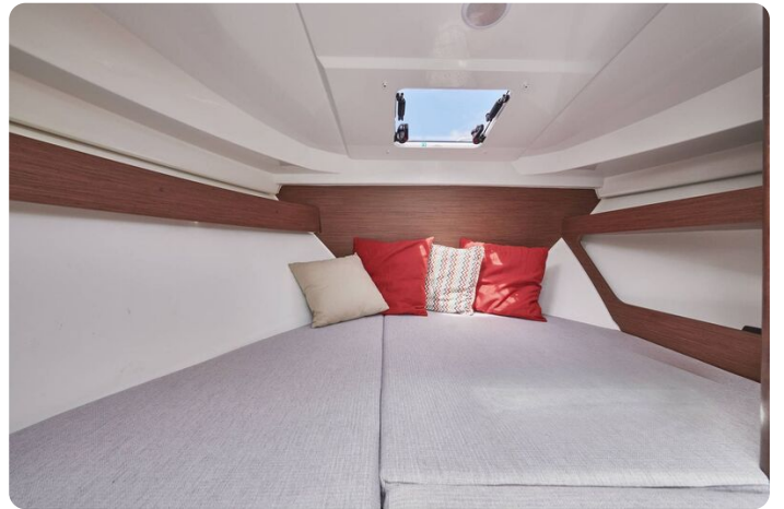
Jeanneau Merry Fisher 795 Series 2 - forward cabin with double berth