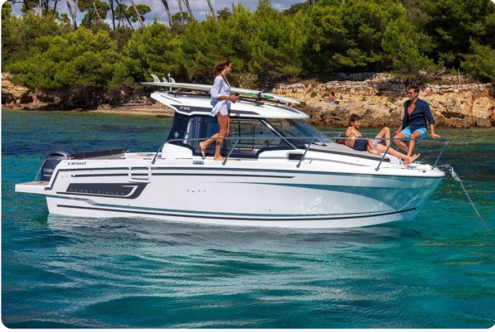
Jeanneau Merry Fisher 795 Series 2