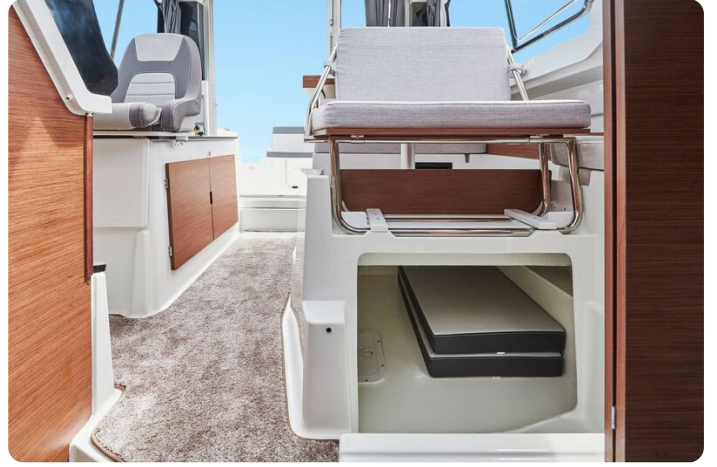
Jeanneau Merry Fisher 795 Series 2 - storage under co-pilot seat