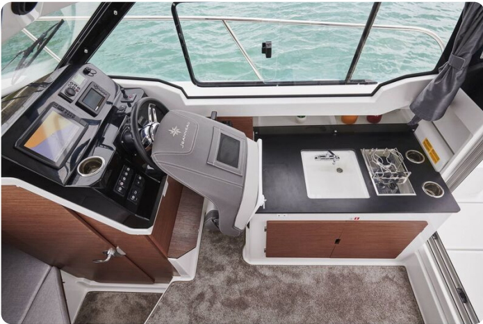
Jeanneau Merry Fisher 795 Series 2 - helm seat folds forward for easy access to galley