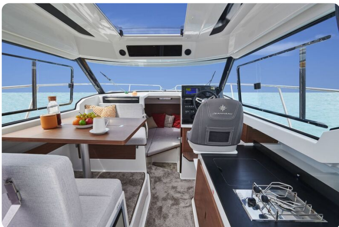
Jeanneau Merry Fisher 795 Series 2 - wheelhouse with port side saloon seating and starboard side helm position and galley