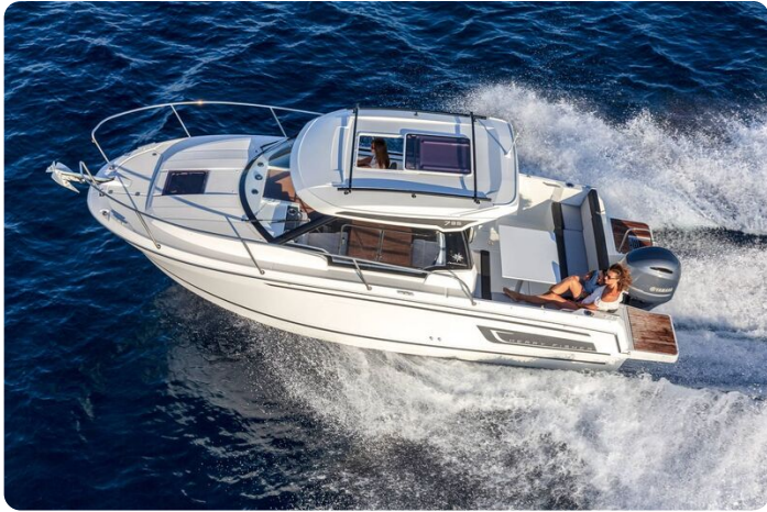
Jeanneau Merry Fisher 795 Series 2 - overhead view of port side and wheelhouse roof hatch