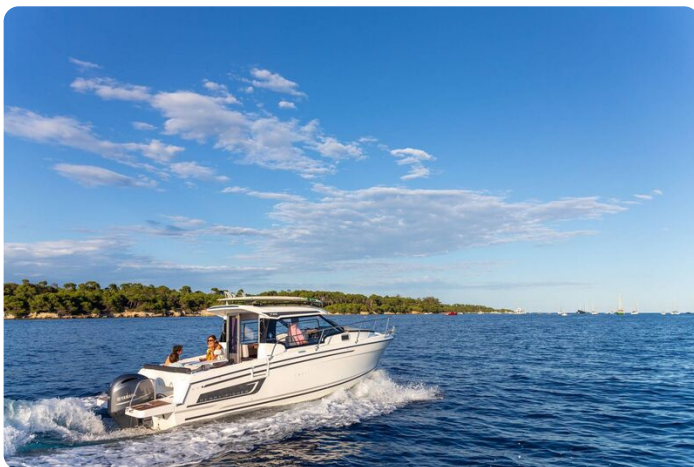
Jeanneau Merry Fisher 795 Series 2 - a beautiful day on the water