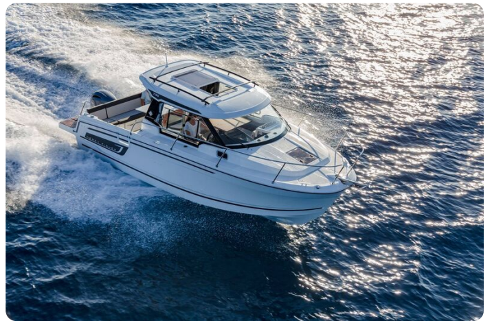
Jeanneau Merry Fisher 795 Series 2 - overhead view towards bow with cabin deck hatch and wheelhouse roof hatch