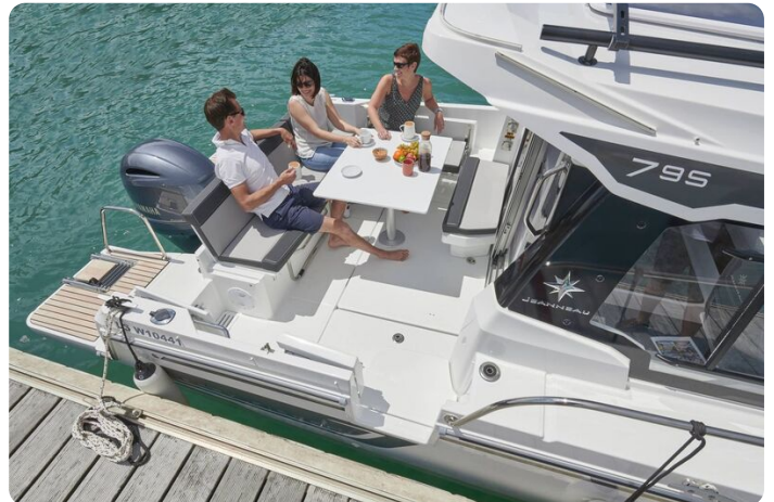
Jeanneau Merry Fisher 795 Series 2 - aft cockpit saloon with table and side gate