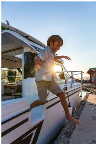
Jeanneau Merry Fisher 795 Series 2 - side gate for easy access to pontoons