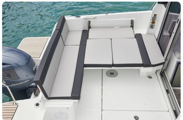
Jeanneau Merry Fisher 795 Series 2 - U-shape cockpit saloon seating with infill for sun lounger