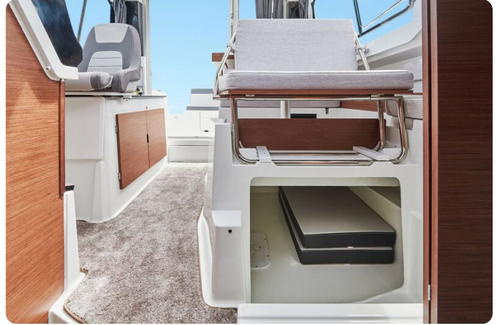
Jeanneau Merry Fisher 795 Series 2 - storage under seat