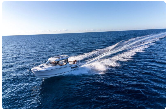
Jeanneau Merry Fisher 795 Series 2 - speeding through the water with a large wake