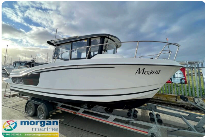
Jeanneau Merry Fisher 795 Marlin - starboard side