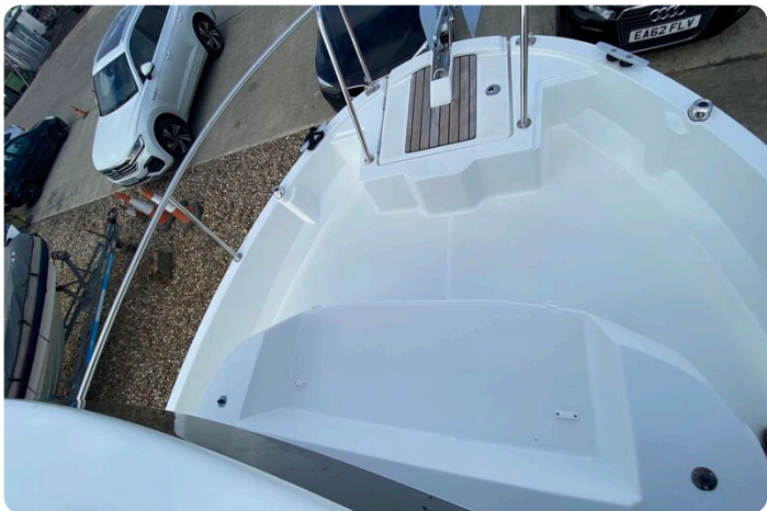
Jeanneau Merry Fisher 795 Marlin-Front