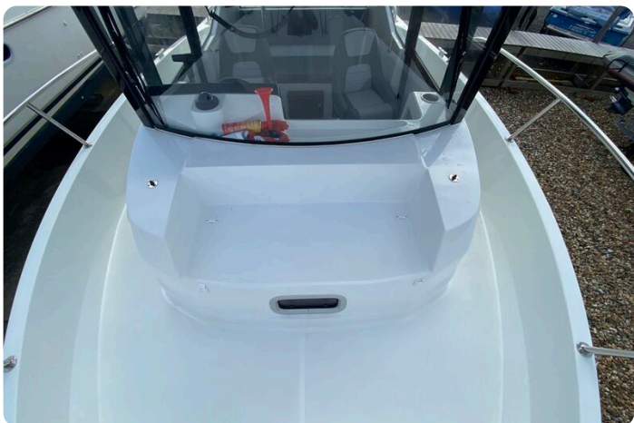
Jeanneau Merry Fisher 795 Marlin-front-seating