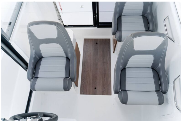
Jeanneau Merry Fisher 695 Sport - render of wheelhouse seating