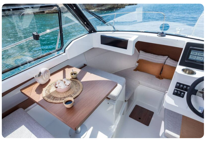
Jeanneau Merry Fisher 605 - port side saloon table and forward berth