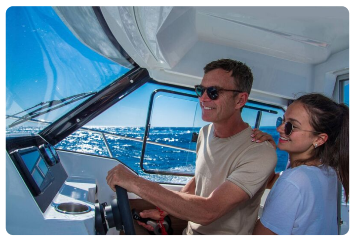
Jeanneau Merry Fisher 605 - starboard side window at helm