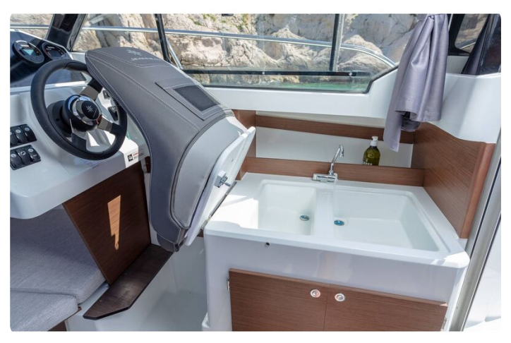
Jeanneau Merry Fisher 605 - helm seat folds forward for access to galley