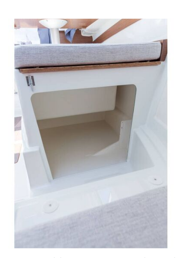
Jeanneau Merry Fisher 605 - storage under co-pilot seat