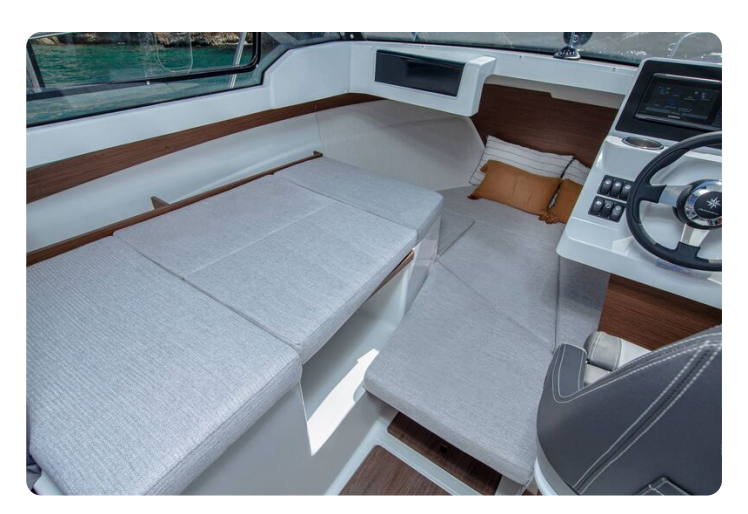
Jeanneau Merry Fisher 605 - all cushions in wheelhouse for two double berths