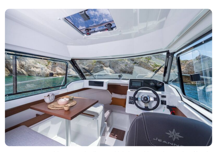
Jeanneau Merry Fisher 605 - wheelhouse with helm position, saloon and roof hatch