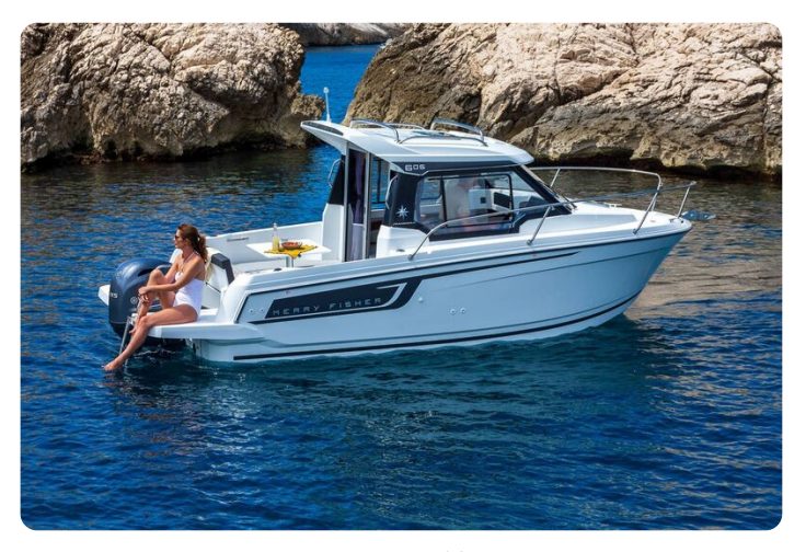
Jeanneau Merry Fisher 605