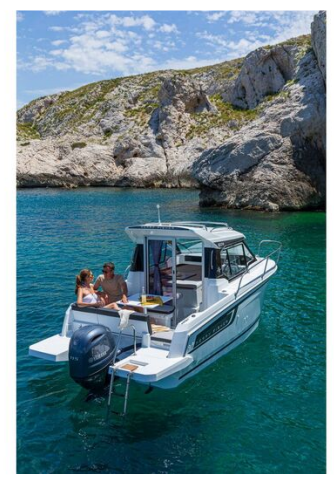
Jeanneau Merry Fisher 605 - in beautiful surroundings