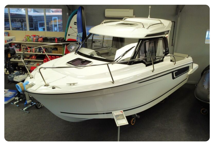
Jeanneau Merry Fisher 605 - in stock at Morgan Marine - view towards bow