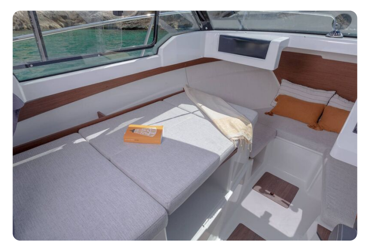
Jeanneau Merry Fisher 605 - saloon table converts to berth