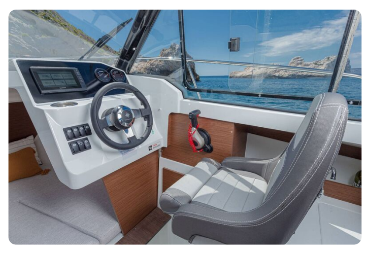
Jeanneau Merry Fisher 605 - helm position