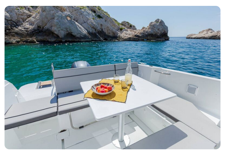
Jeanneau Merry Fisher 605 - view towards aft