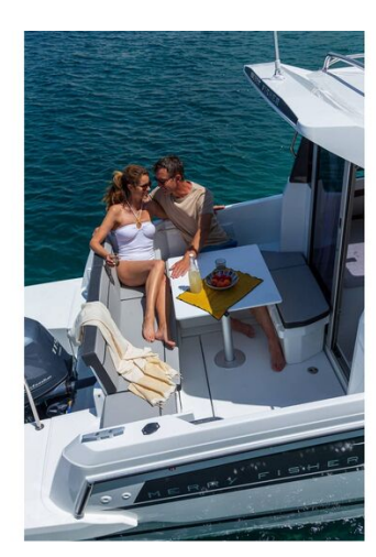
Jeanneau Merry Fisher 605 - relaxing in the U-shaped cockpit saloon