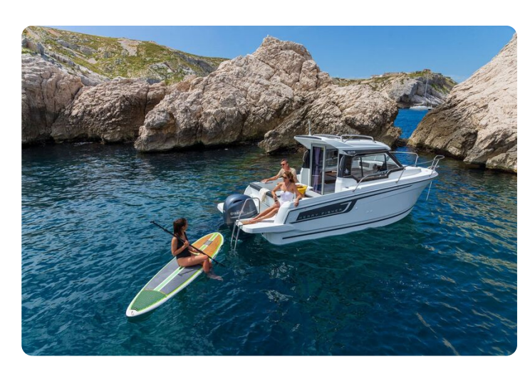
Jeanneau Merry Fisher 605 - fun on the water with a paddleboard