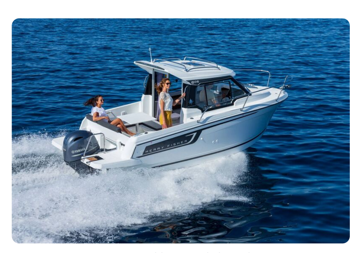
Jeanneau Merry Fisher 605 - relaxing on the water