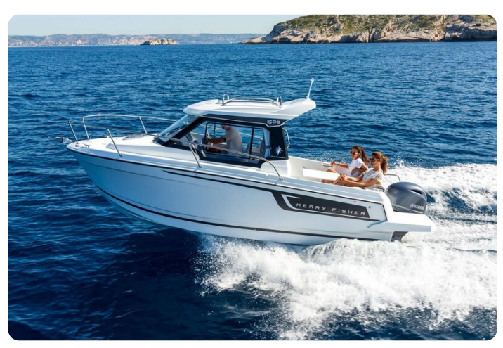
Jeanneau Merry Fisher 605 - port side view on the water