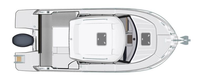
Jeanneau Merry Fisher 605 - diagram of overhead view