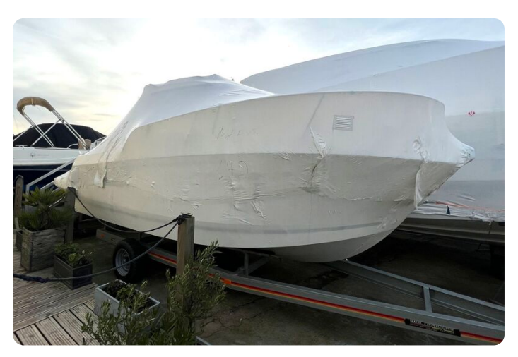
Jeanneau Merry Fisher 605 - still wrapped up