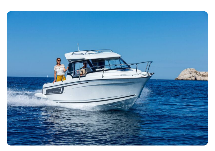
Jeanneau Merry Fisher 605 - on the water