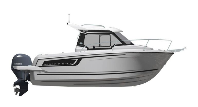
Jeanneau Merry Fisher 605 - diagram of side view