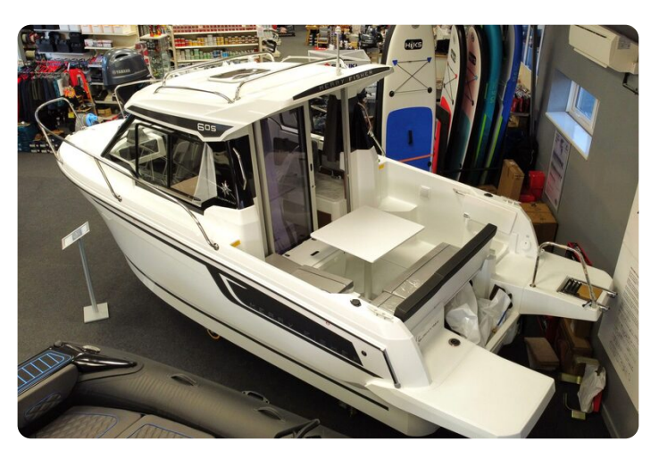
Jeanneau Merry Fisher 605 - in stock at Morgan Marine - view towards cockpit