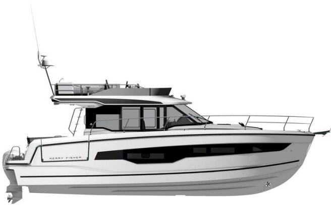
Jeanneau Merry Fisher 1295 Flybridge - diagram of side view