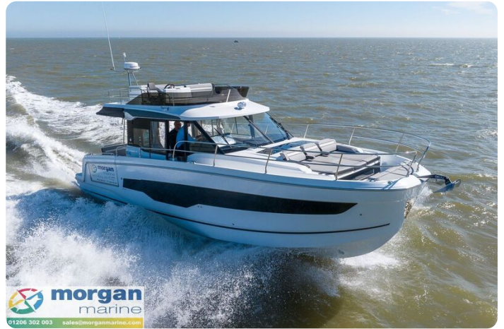
Jeanneau Merry Fisher 1295 Flybridge - overhead view from starboard side