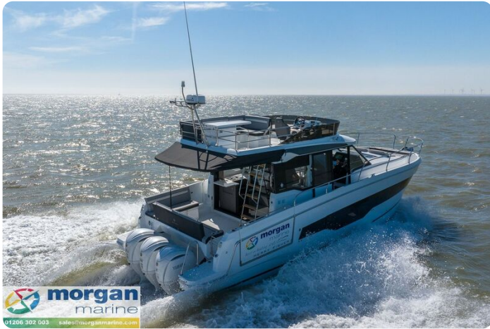
Jeanneau Merry Fisher 1295 Flybridge - overhead view from starboard side aft