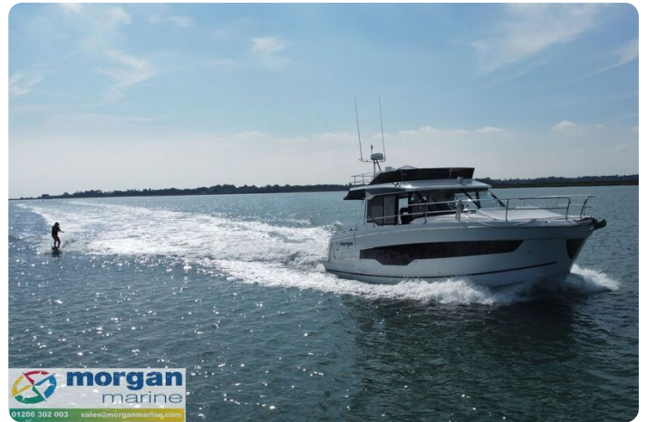
Jeanneau Merry Fisher 1295 Flybridge - wakeboarding - starboard side view