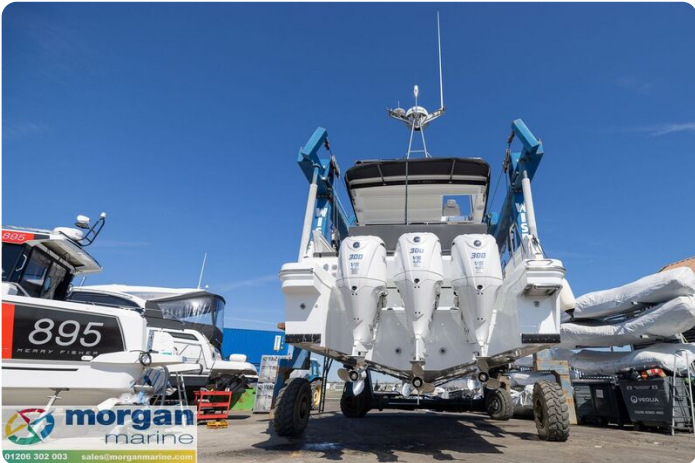
Jeanneau Merry Fisher 1295 Fly - triple Yamaha engines