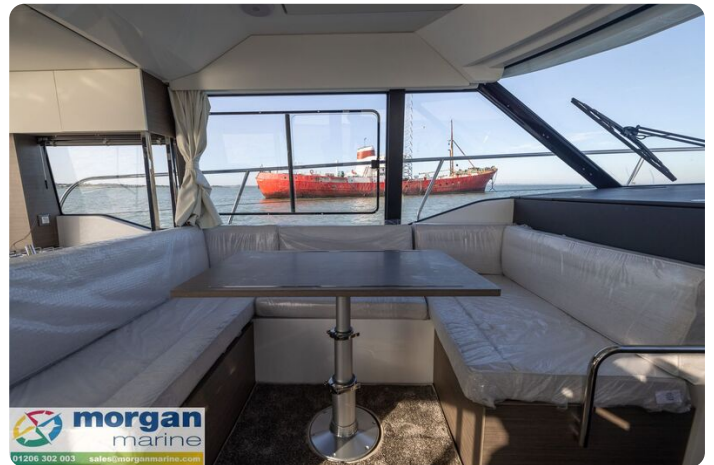
Jeanneau Merry Fisher 1295 Flybridge - saloon seating and table