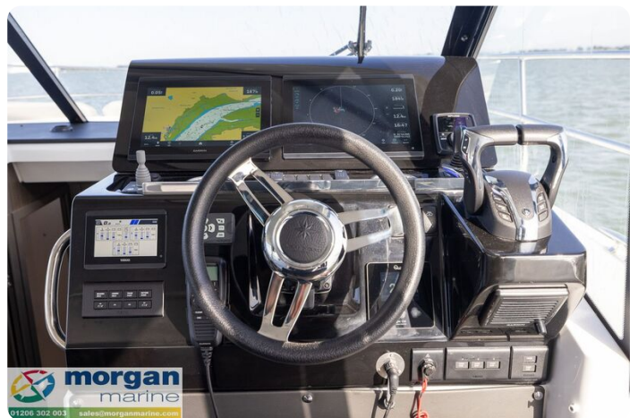
Jeanneau Merry Fisher 1295 Flybridge - dash and engine controls