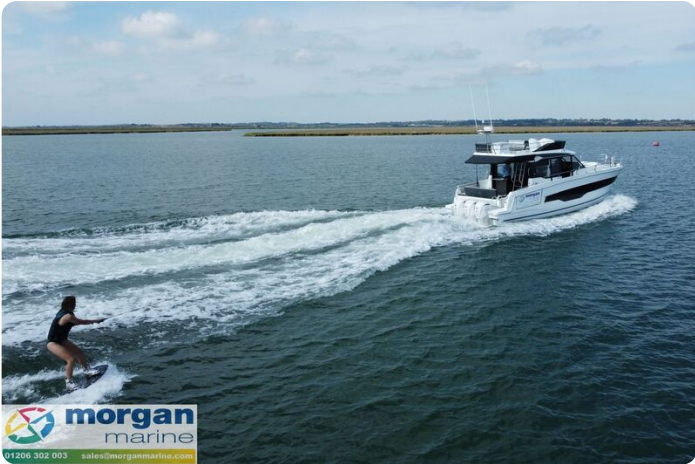
Jeanneau Merry Fisher 1295 Fly - wakeboarding - view towards aft