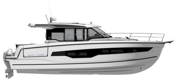
Jeanneau Merry Fisher 1295 Coupe - diagram of side view