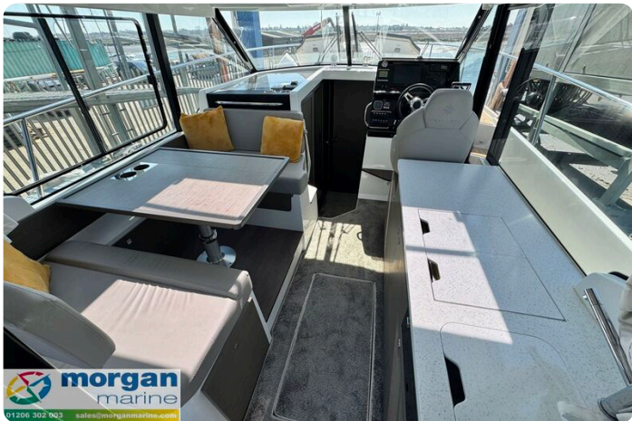
Merry Fisher 1095 - salon