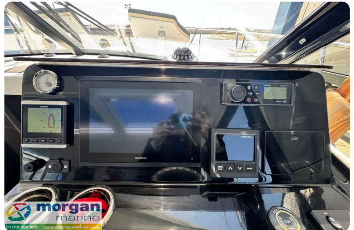
Merry Fisher 1095 - Garmin