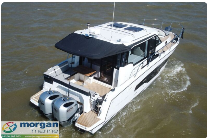
Merry Fisher 1095 - canopy