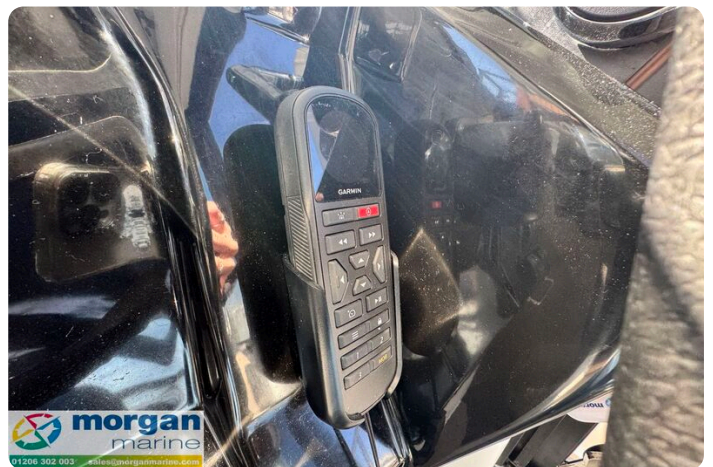
Merry Fisher 1095 - radio