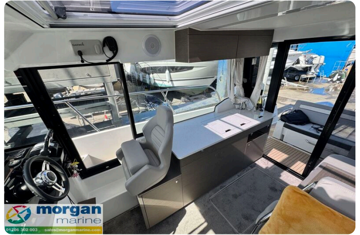
Merry Fisher 1095 - pilot seat