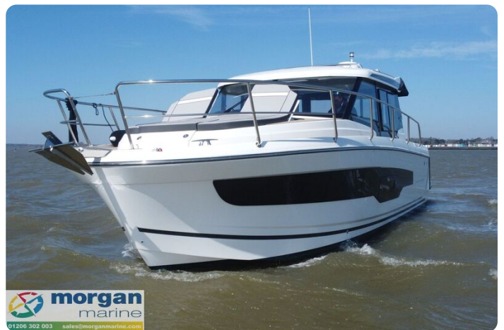
Merry Fisher 1095 - cleats