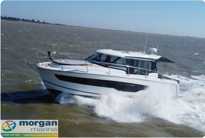
Merry Fisher 1095 - railings