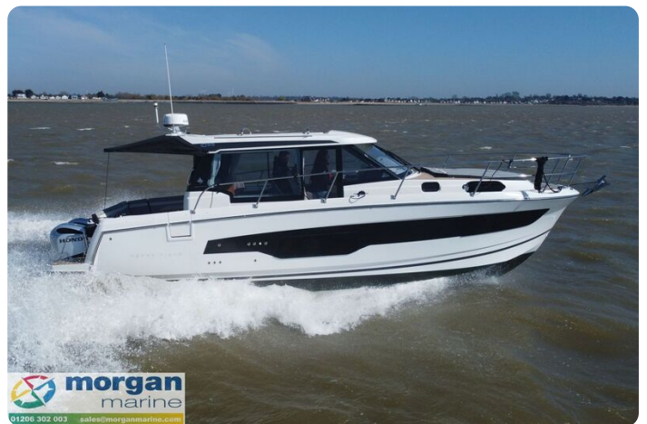
Merry Fisher 1095 - action