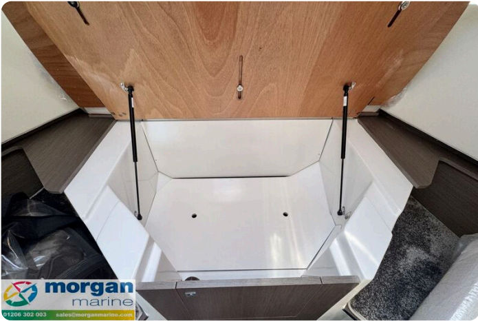
Merry Fisher 1095 - storage