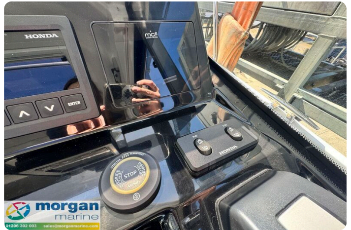
Merry Fisher 1095 - MOB