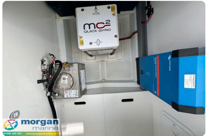
Merry Fisher 1095 - stabilizer