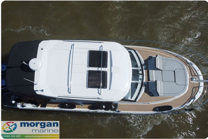
Merry Fisher 1095 - roof bars