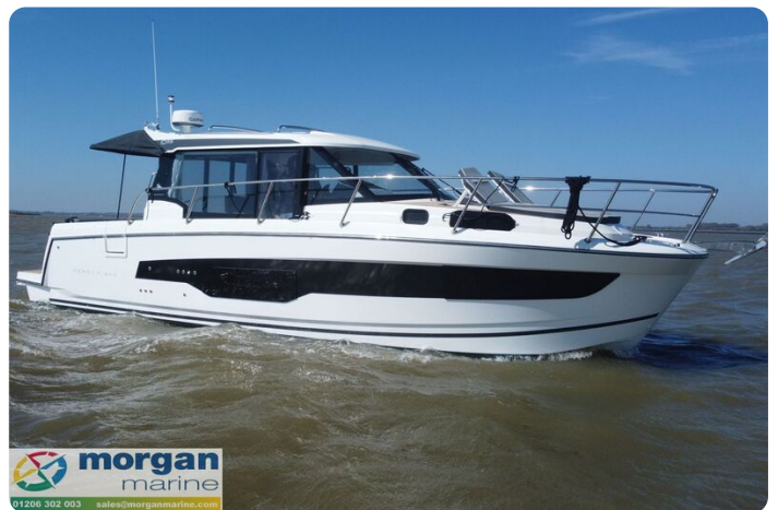
Merry Fisher 1095 - bow view