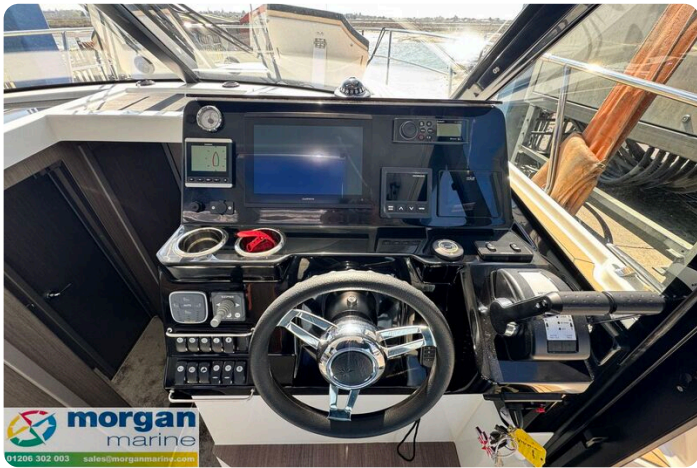
Merry Fisher 1095 - wheel