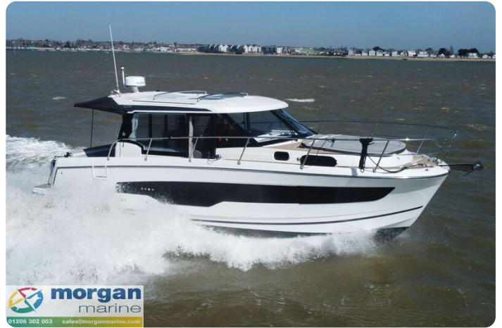
Merry Fisher 1095 - fenders