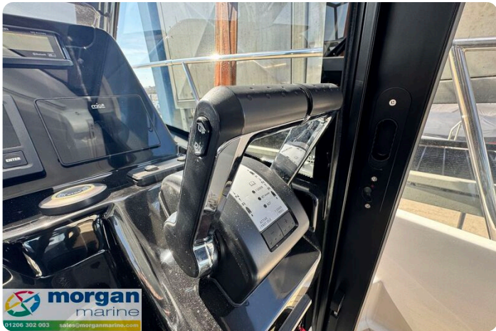
Merry Fisher 1095 - Throttle control