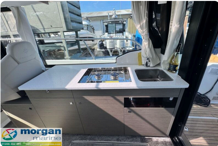
Merry Fisher 1095 - cooker