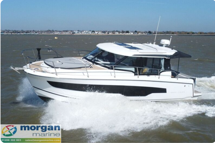
Merry Fisher 1095 - main