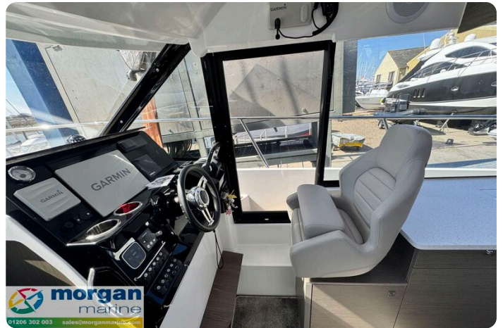
Merry Fisher 1095 - pilot seating