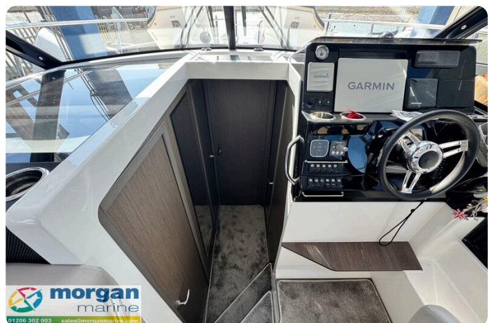
Merry Fisher 1095 - stairs