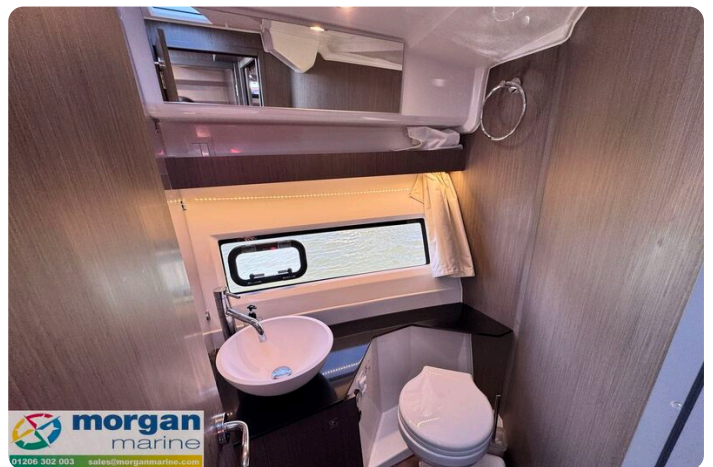
Merry Fisher 1095 - toilet