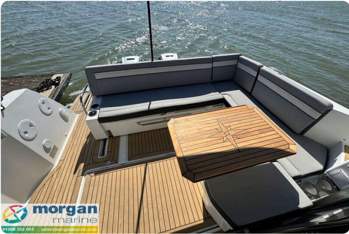
Merry Fisher 1095 - cockpit