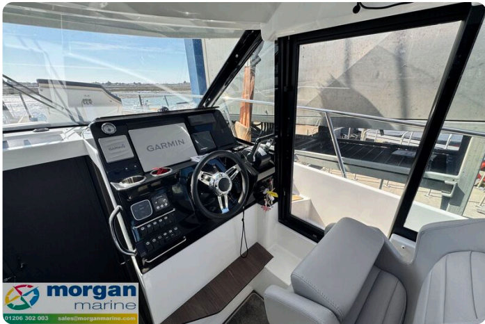
Merry Fisher 1095 - covers