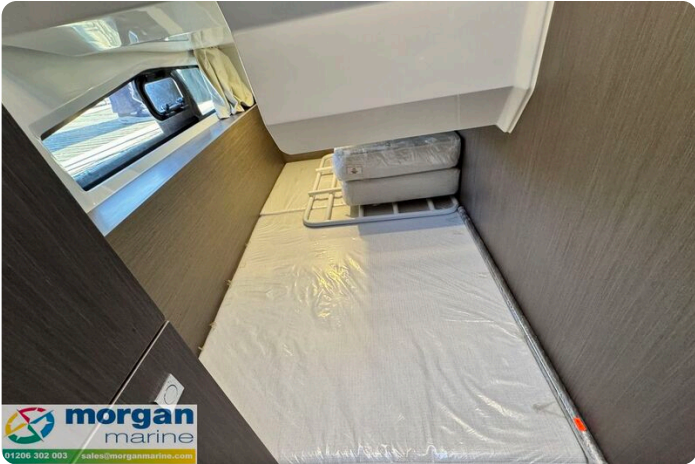
Merry Fisher 1095 - third berth