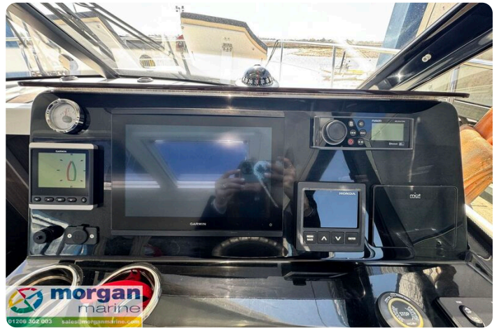
Merry Fisher 1095 - Garmin