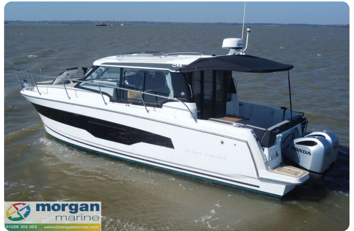
Merry Fisher 1095 - stern