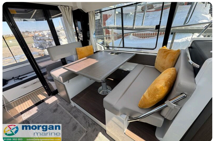
Merry Fisher 1095 - table view