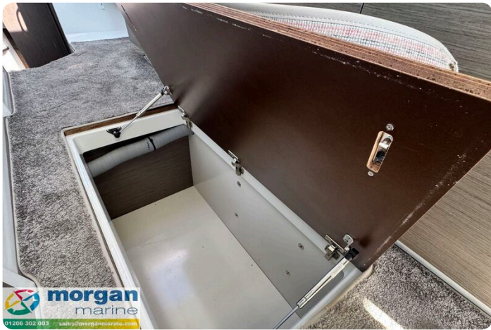
Merry Fisher 1095 - storage