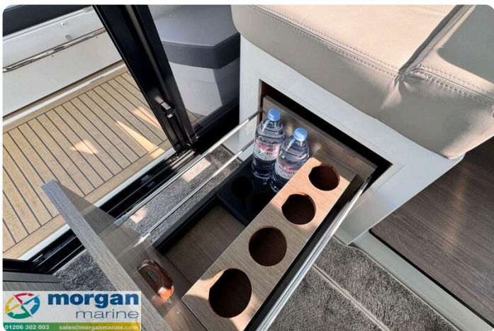
Merry Fisher 1095 - wine draw