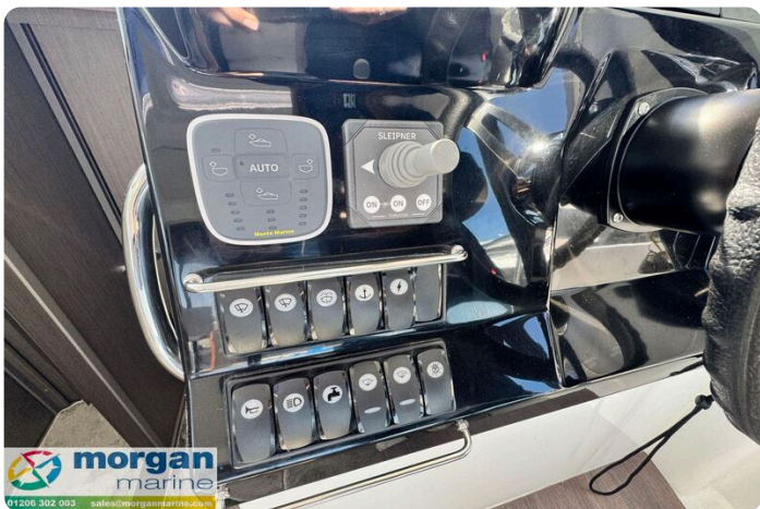
Merry Fisher 1095 - bow thruster