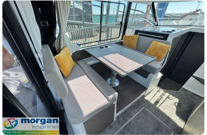
Merry Fisher 1095 - table