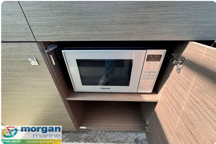
Merry Fisher 1095 - microwave