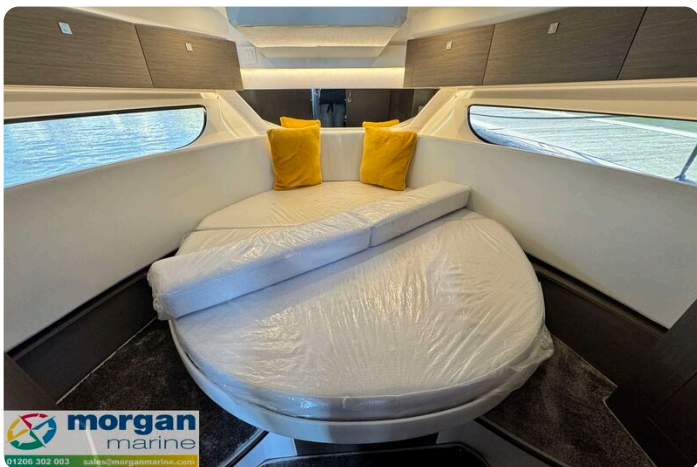
Merry Fisher 1095 - main berth