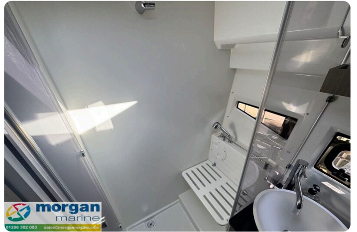
Merry Fisher 1095 - shower