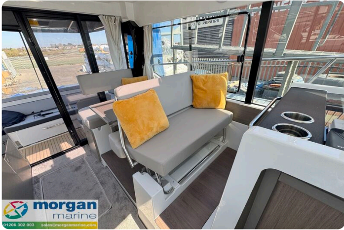
Merry Fisher 1095 - co pilot seat