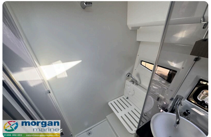
Merry Fisher 1095 - shower