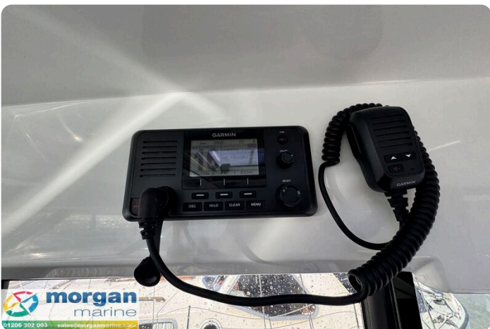
Merry Fisher 1095 - VHF