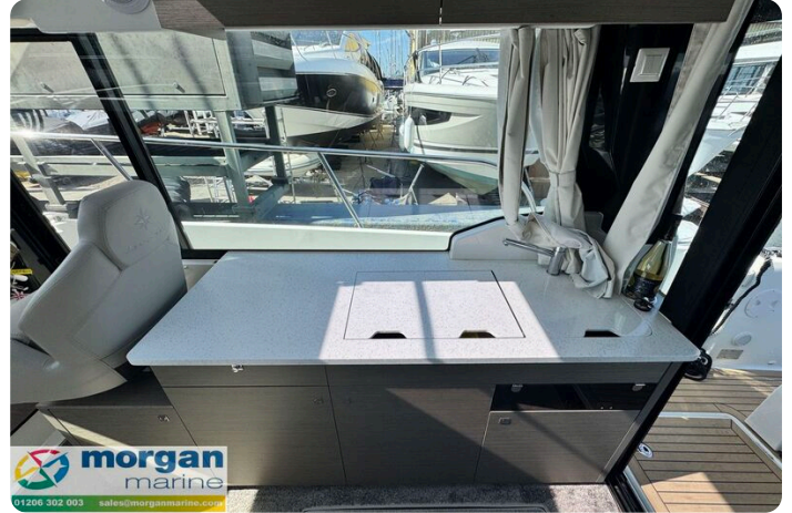
Merry Fisher 1095 - galley