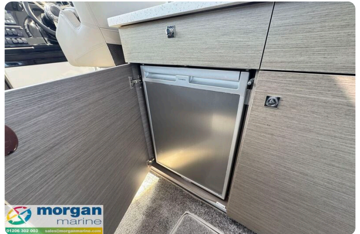
Merry Fisher 1095 - fridge