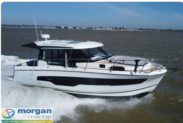
Merry Fisher 1095 - speed