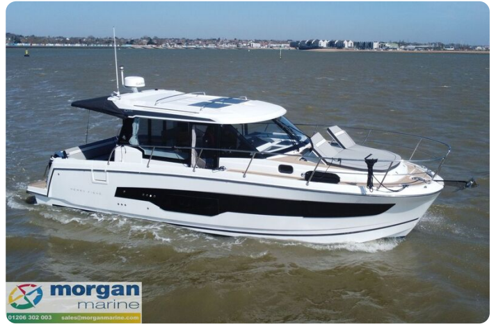
Merry Fisher 1095 - calm