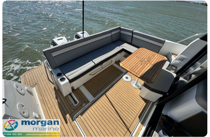
Merry Fisher 1095 - table