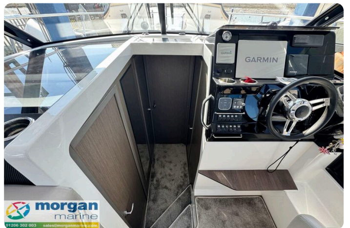
Merry Fisher 1095 - stairs