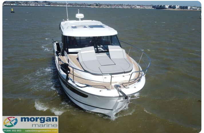
Merry Fisher 1095 - bow seating