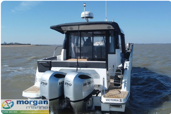
Merry Fisher 1095 - outboard engine