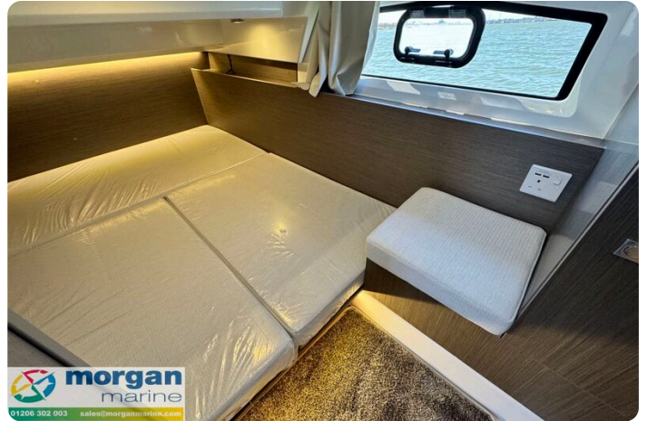
Merry Fisher 1095 - sec berth