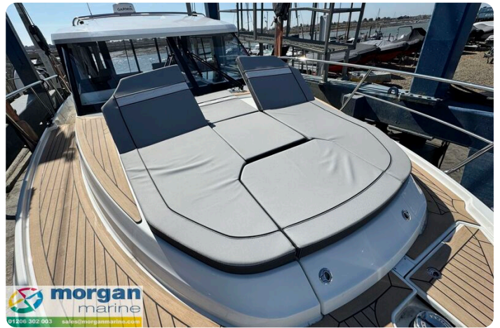
Merry Fisher 1095 - seun cushions front