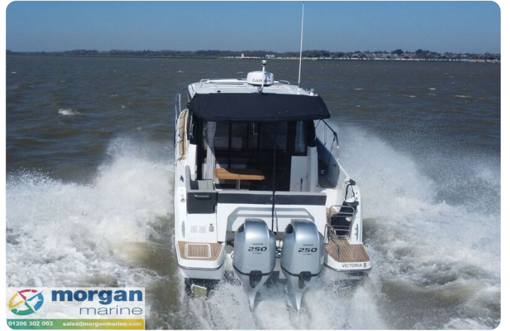
Merry Fisher 1095 - honda