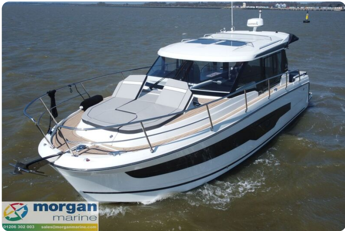
Merry Fisher 1095 - sun-pads