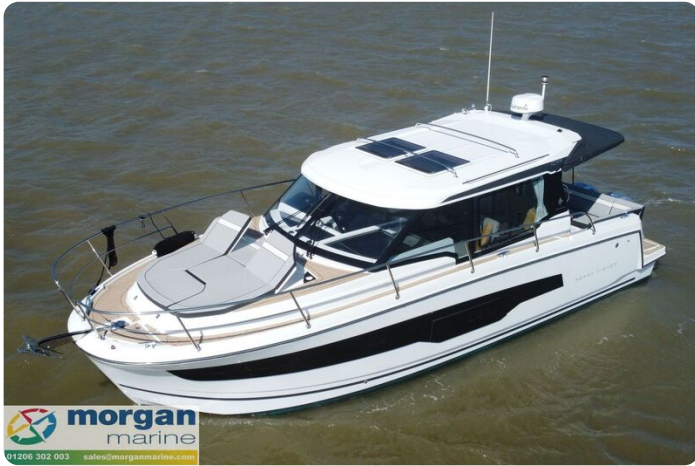
Merry Fisher 1095 - bow view