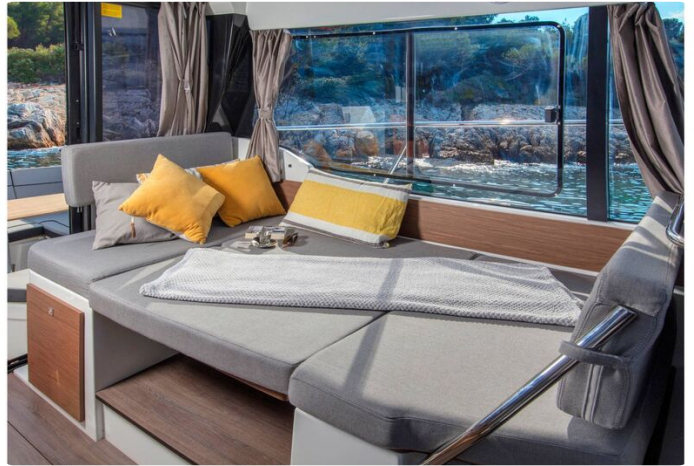
Jeanneau Merry Fisher 1095 - table in wheelhouse converts to berth