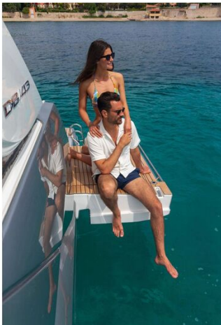
Jeanneau DB 43 inboard - relaxing on the port side terrace