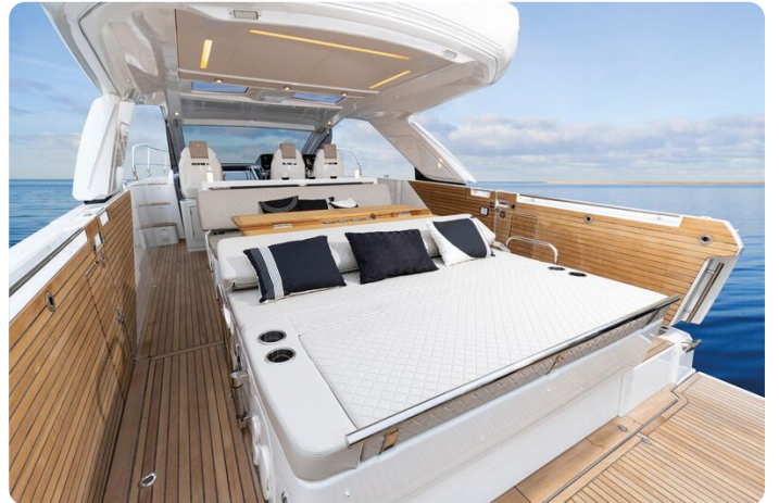
Jeanneau DB 43 inboard - aft sun lounger