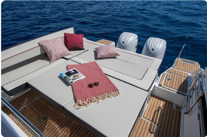
Jeanneau Cap Camarat 9.0 WA - aft cockpit bench folds down to extend sun lounger