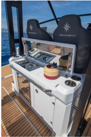
Jeanneau Cap Camarat 9.0 WA - exterior galley