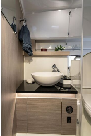
Jeanneau Cap Camarat 9.0 WA - wash basin in toilet compartment