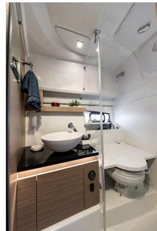
Jeanneau Cap Camarat 9.0 WA Series 2 -