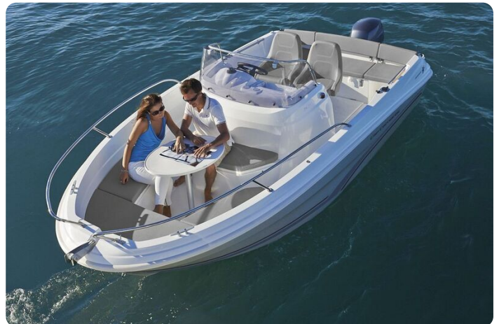
Jeanneau Cap Camarat 5.5 CC - with table in open bow