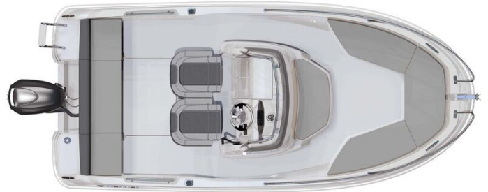
Jeanneau Cap Camarat 5.5 CC - diagram of overhead view