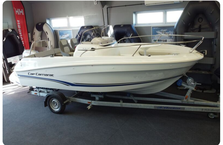
Jeanneau Cap Camarat 5.5 CC - starboard side