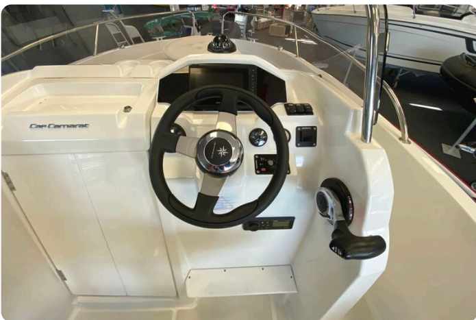
Jeanneau Cap Camarat 5.5 CC - dash and engine controls