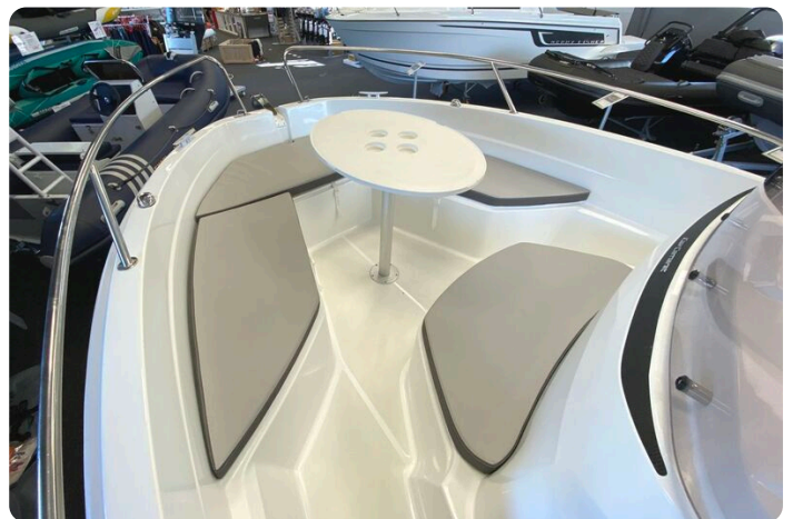
Jeanneau Cap Camarat 5.5 CC - bow seating with seating in-front of console