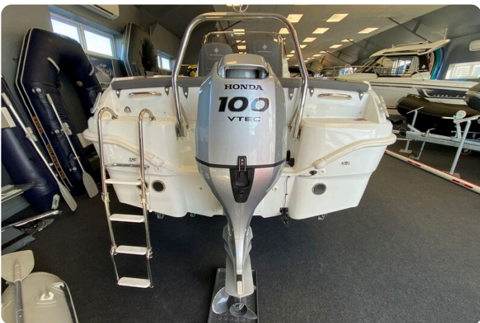
Jeanneau Cap Camarat 5.5 CC - transom with Honda 100hp outboard