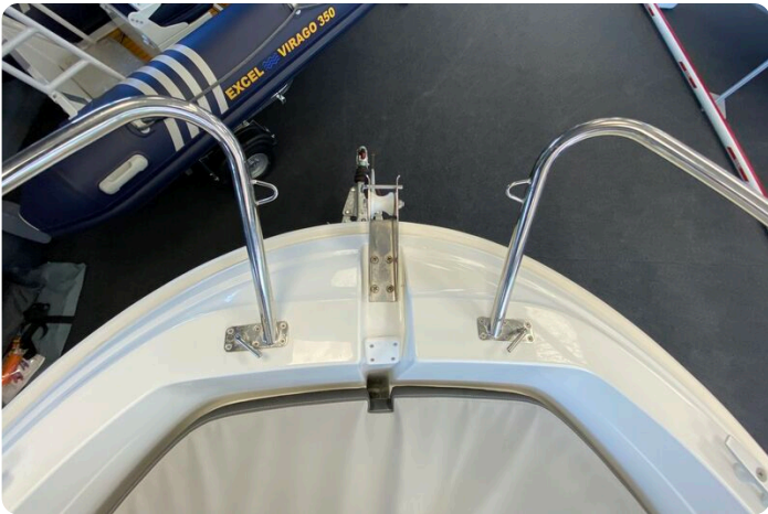
Jeanneau Cap Camarat 5.5 CC - pulpit rails and anchor roller