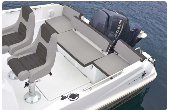
Jeanneau Cap Camarat 5.5 CC - sliding aft bench